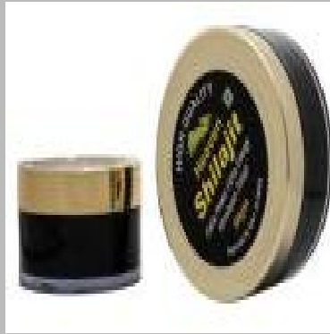
Natural Himalayan Shilajit