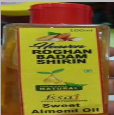
Rogan Badam Shirin Oil