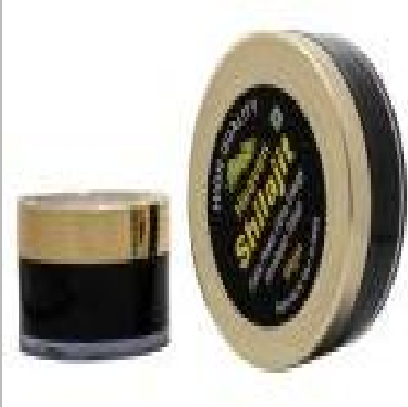
Natural Himalayan Shilajit

HEAVEN SAFFRON is known as top Manufacturer, Exporter, Supplier, Retailer and Trader of best Herbal and Ayurvedic Extract, Herbal Products, Nut Oils, Saffron and Shilajit Extract.