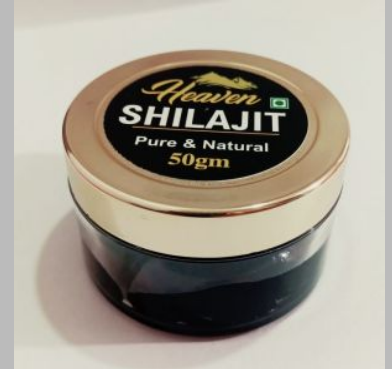
50gm Himalayan Shilajit