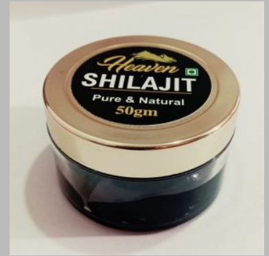
50gm Himalayan Shilajit