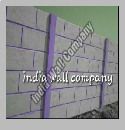
Precast Compound Wall

India Wall Company is known as top and Manufacturer of best Cladding Materials and Building Panels, Cobbles and Kerbs, Fencing Materials, Flower Pot and Garden & Outdoor Furniture.