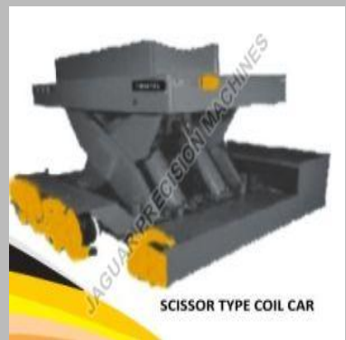
Scissor Type Coil Car