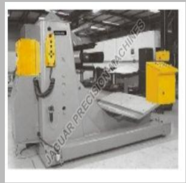
Floor Type Coil Car