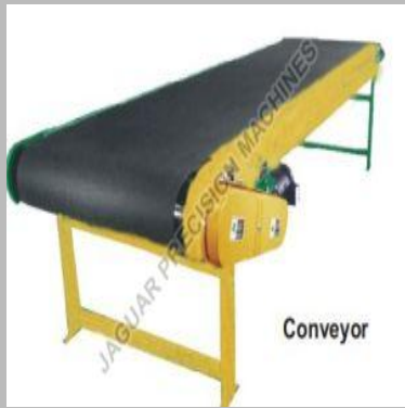
Flat Belt Conveyor

We Jaguar Precision Machines are a leading and distinguished Manufacturer, Exporter, Supplier and Trader of quality Bulk Handling Equipment, Clamps and Clamping Equipment, Industrial Mill Rolls, Metal Angle and Rubber Rollers.