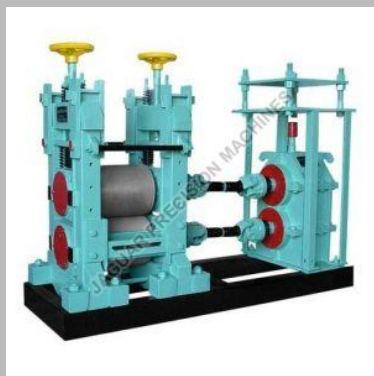
Hot Rolling Mill Pinch Roll