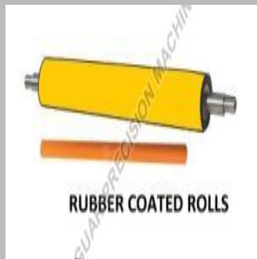
Rubber Coated Roller