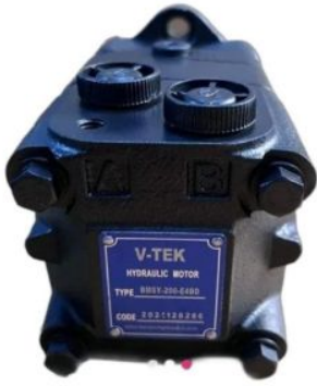
V-Tek OMS Series Orbital Motor