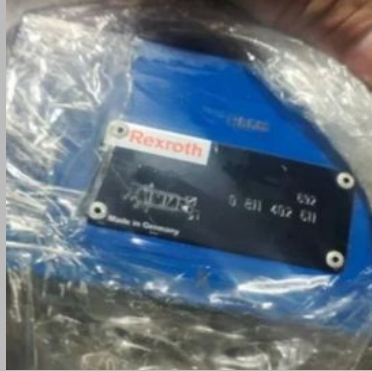
Rexroth Logic Hydraulic Servo Valve