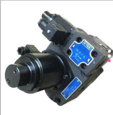
V-Tek Proportional Electro Hydraulic Control P-Q Valve