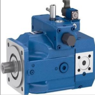
Rexroth A4VSG Series Hydraulic Pump