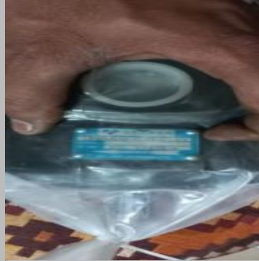
Veljan Hydraulic Vane Pump