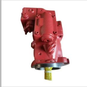
K3VL80 Kawasaki Hydraulic Pump