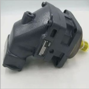
Parker F12 Hydraulic Pump