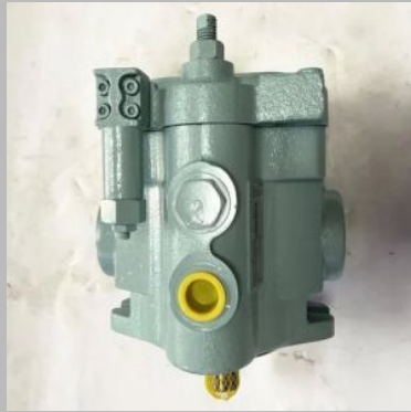
PV20-2R1D-C00-J343 Denison Hydraulic Pump