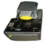
Rexroth Hydraulic Servo Valve