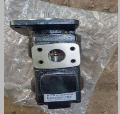
Parker Hydraulic Pump