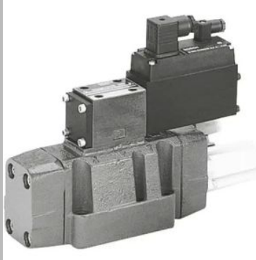
Rexroth Hydraulic Proportional Directional Valve