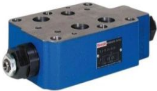
Rexroth Z2FS Throttle Check Valve