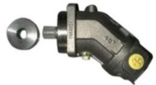
Rexroth Hydraulic Axial Piston Motor