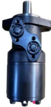
V-Tek OMR Series Orbital Motor