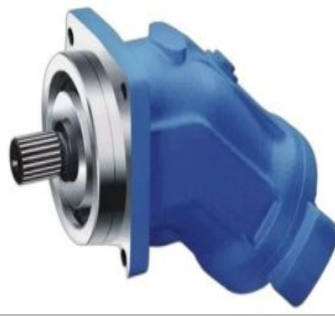
Rexroth Hydraulic Motor