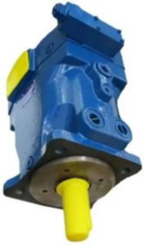
Vickers Axial Piston Pump