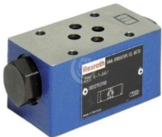
Rexroth Hydraulic Check Valve