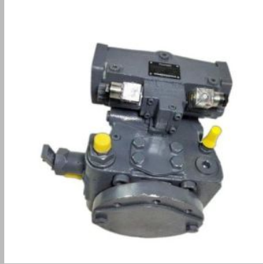
Rexroth A4VG125HWDT1/32L Hydraulic Pump