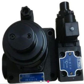
V-Tek EFBG Hydraulic Proportional Valve