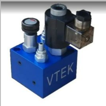
Lift Block Hydraulic Proportional Valve