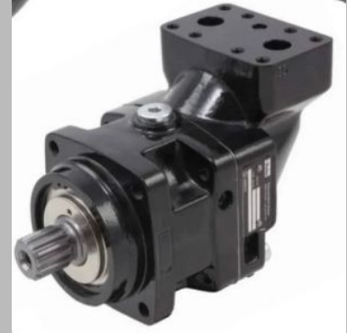
Parker P2145 Series Axial Piston Pump