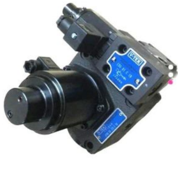
V-Tek Proportional Electro Hydraulic Control P-Q Valve