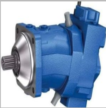
Rexroth WA6VM Series 6X Axial Piston Motor