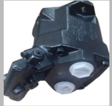
Hydraulic Pressure Control Pump