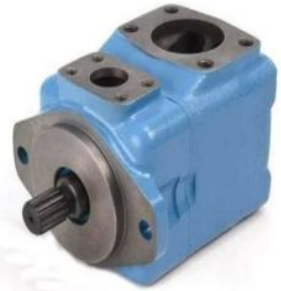
THM Hydraulic Vane Pump