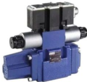
Rexroth Electrohydraulic Servo Valve