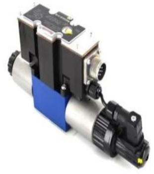
Rexroth Hydraulic Proportional Valve