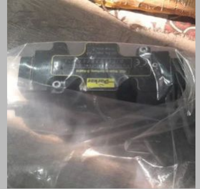
Parker Proportional Electro Hydraulic Valve