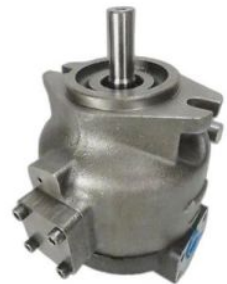
Bosch Hydraulic Vane Pump