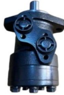
V-Tek OMP Series Orbital Motor