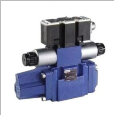
Rexroth Electrohydraulic Servo Valve