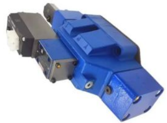
Rexroth 4WRLE 16 V200 Hydraulic Servo Valve