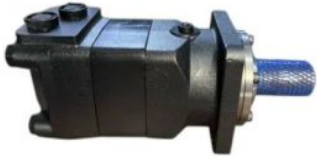
V-Tek 4 Bolt OMT Series Orbital Motor