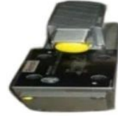
Rexroth Hydraulic Servo Valve