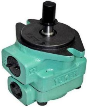
Yuken Y5 Hydraulic Vane Pump