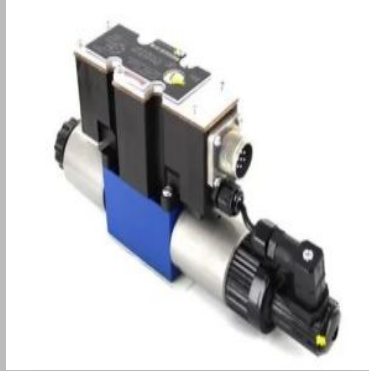
Rexroth Hydraulic Proportional Valve