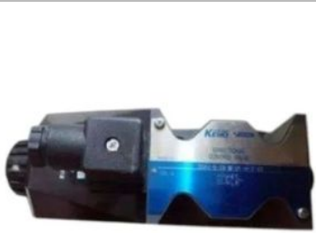
Keiki Tokimec Directional Hydraulic Valve