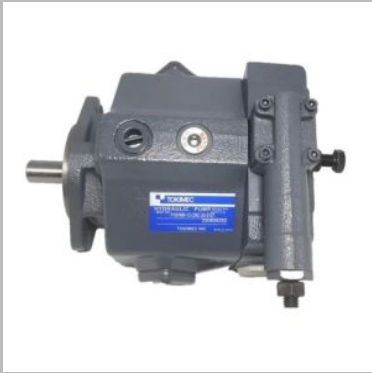
Tokimec Hydraulic Pump