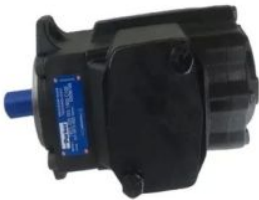
T6DCC Denison Hydraulic Vane Pump