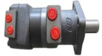
Sai Hydraulic Pump Motor