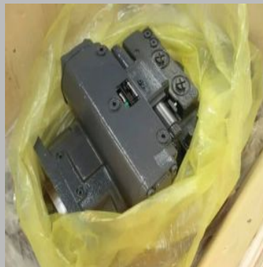
Rexroth A11VO Hydraulic Piston Pump