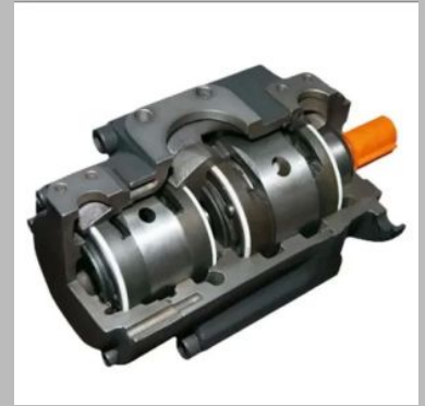
Eaton Vickers Hydraulic Pump