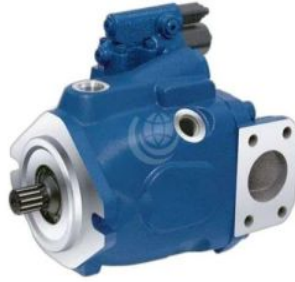
Rexroth A10VO Series Variable Axial Piston Pump