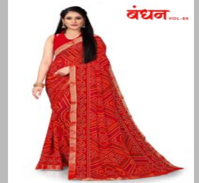
bandhani printed sarees