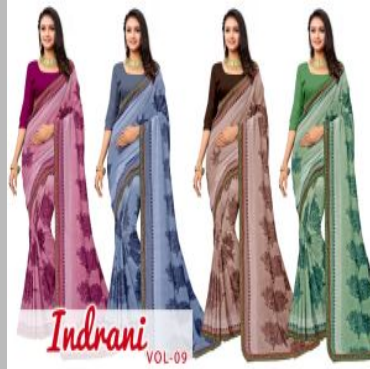
casual wearing sarees