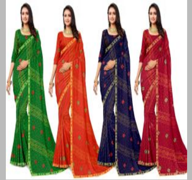
Chiffon Georgette Saree