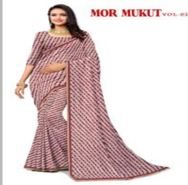
Renial Printed Sarees