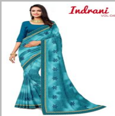
Wholesale printed saree