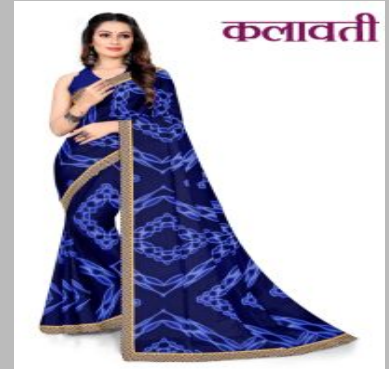
Casual wearing saree