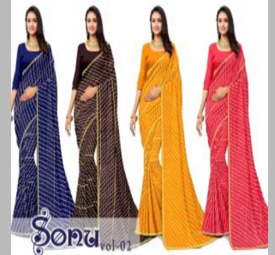
Renial jari weaving printed saree