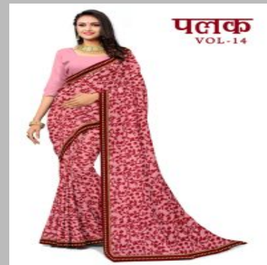
Renial printed saree