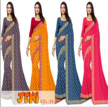
surat saree kumari silk