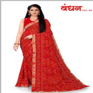
bandhani printed sarees