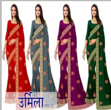
Kumari Silk embroidery work saree