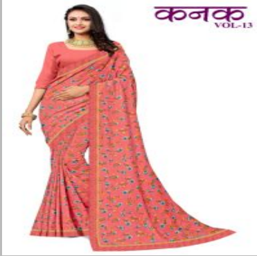
printed chiffon saree