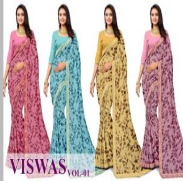
printed chiffon sarees