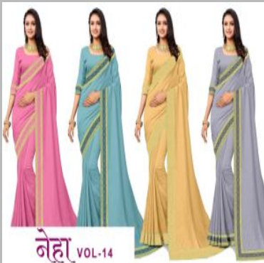
casual daily wear saree