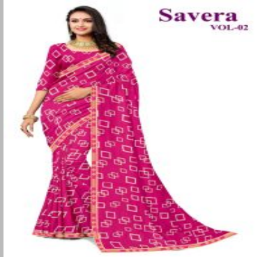
Surat sarees: Buy wholesale sarees catalog by Kamya Sarees