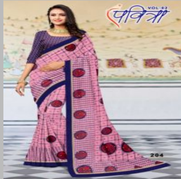
Daily wear saree