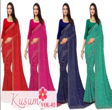
Lehariya printed saree