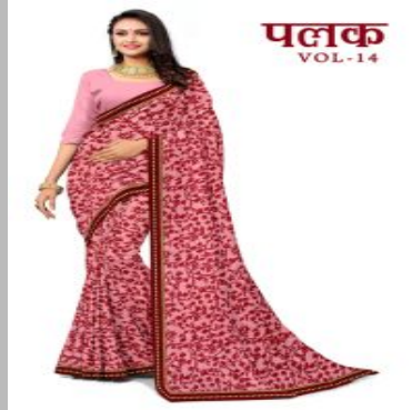
Renial printed saree