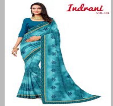
Wholesale printed saree