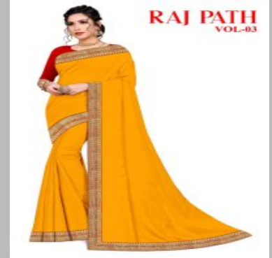
kumari silk solid lace border sarees