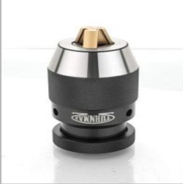
Turnmax Keyless Drill Chuck