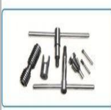
Spare For Lathe Chuck - Handles, Pinions Pins, Screw