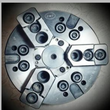
GMT Power Operated Chuck