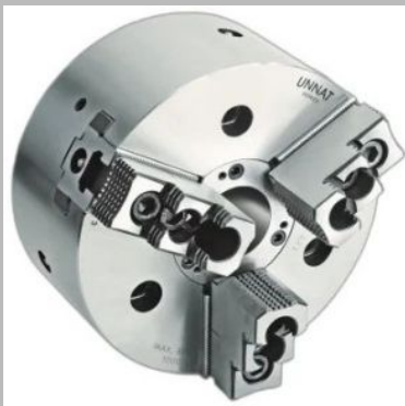
Unnat High Speed Power Chuck