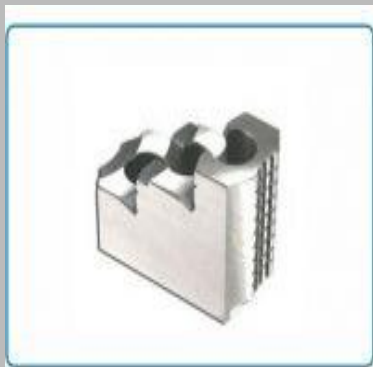
Top Hard Jaws For Power Chucks