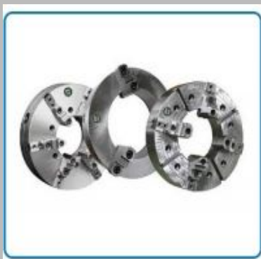
Big Bore Chucks