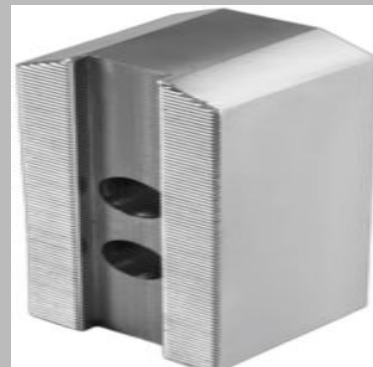
Power Chuck Soft Jaw