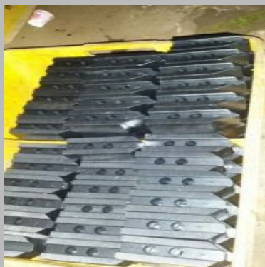
CNC Soft Jaw