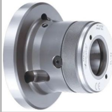
Power Operated Collet Chuck