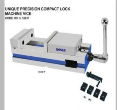
Precision Compact Lock Machine Vice