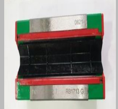
Hiwin Guide Block