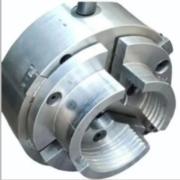
Wood Turning Lathe Chuck