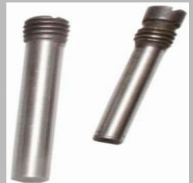
Self Centering Chuck Pinion Pins