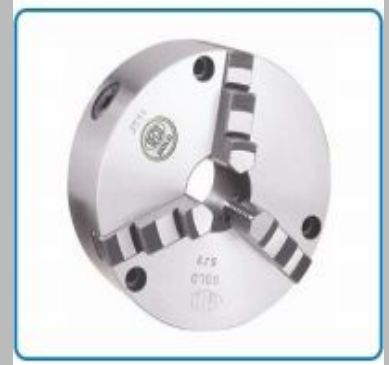
Self Centering Chucks