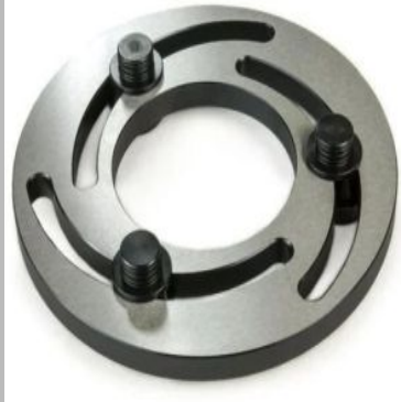
Soft Jaw Boring Ring