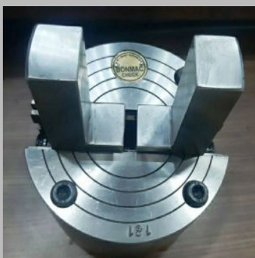
Bonmac Screw Operated 2 Jaw Chuck