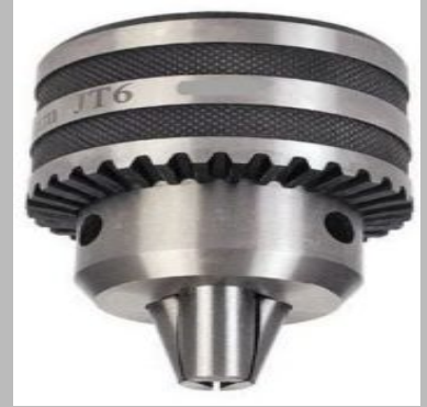
JT6 Drill Chuck