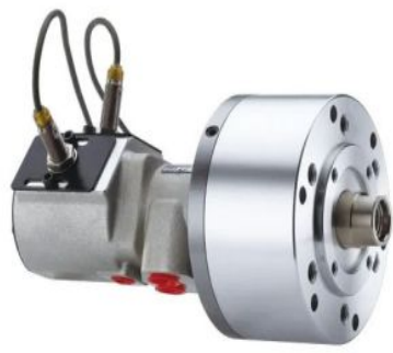
Seco Close Centre Rotary Cylinder