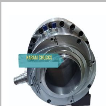
127mm Hydraulic Rotary Cylinder