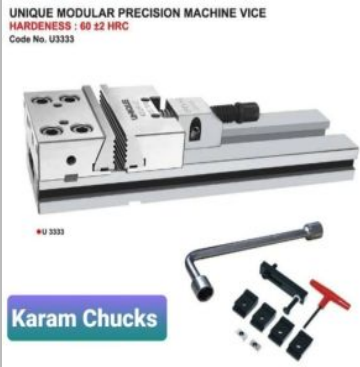
Unique Modular Precision Machine Vice