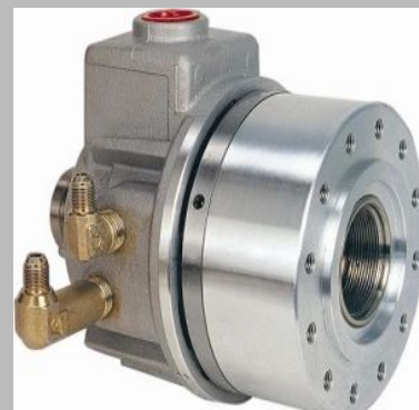
120mm Bore Hydraulic Rotary Cylinder