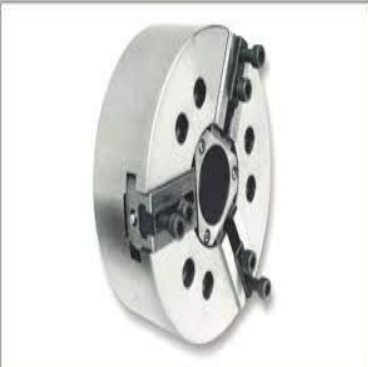
Power Operated Chucks