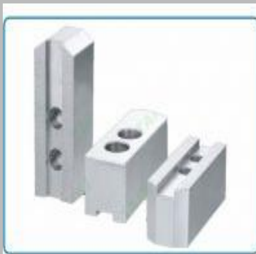
Soft Jaws For Power Chucks