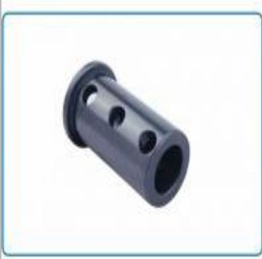
Turret Sleeves For CNC Machines