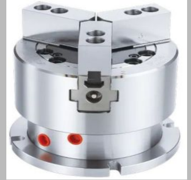
VH-204 Stationary Power Chuck