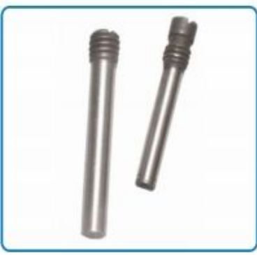
Lathe Chuck Spares