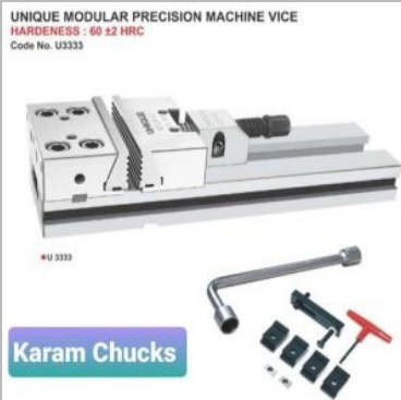
Modular Precision Machine Vice