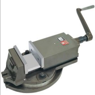
Unique U 310 Milling Machine Vice