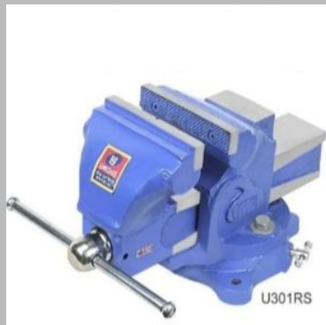
Heavy Duty Bench Vice