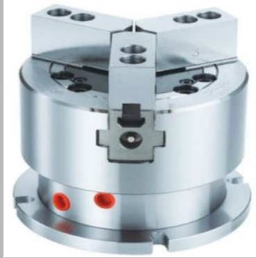
VH-304 Stationary Power Chuck