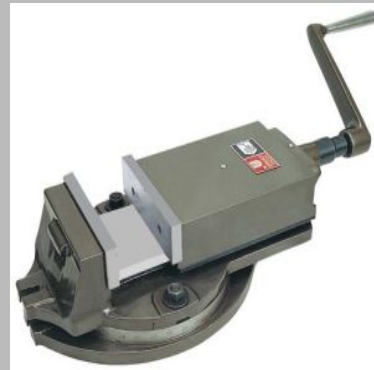
Milling Machine Vice