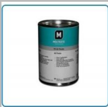
Grease For Power Chucks