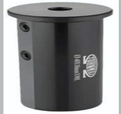
CNC Machine Turret Sleeves