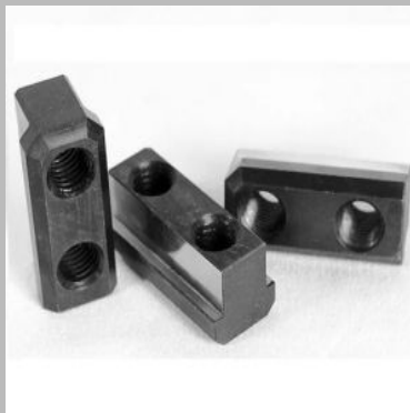
Tee Nut Power Chuck