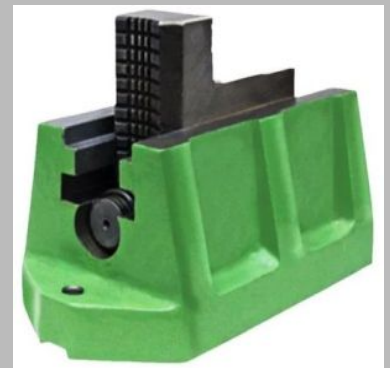
Bonet Face Plate Jaws