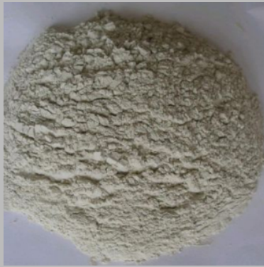
Activated Bleaching Earth Powder