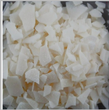
Hydrogenated Castor Oil (HCO)