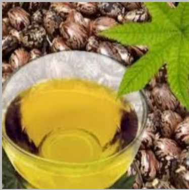
Commercial Castor Oil