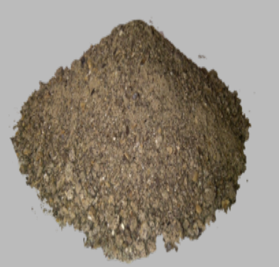
Castor De-Oiled Cake