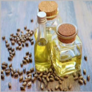
Castor Oil (FSG)

We Kavya Trading Industries are a leading and distinguished Manufacturer, Exporter, Supplier and Trader of quality Carrier Oil, Castor Oil, Coal & Charcoal, DE Oiled Cake and Industrial Chemicals.