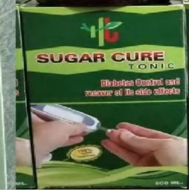
Sugar Cure Tonic