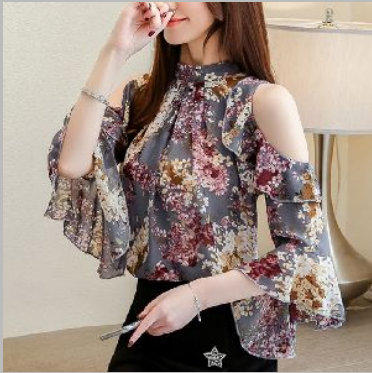
Ladies Tops,ladies tops