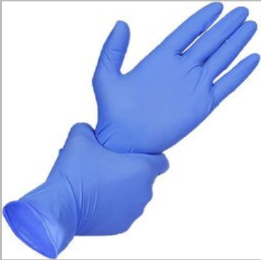
Safety Hand Gloves