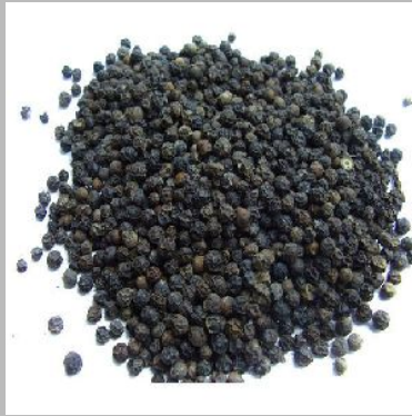
black pepper seeds