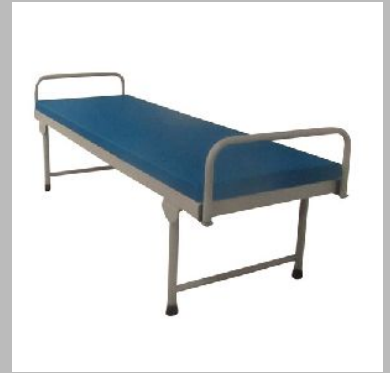
Hospital Attendant Bed