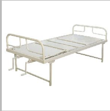
Hospital Fowler Bed