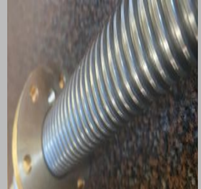
Acme Thread Lead Screw