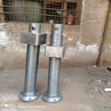
Square Thread Lead Screw