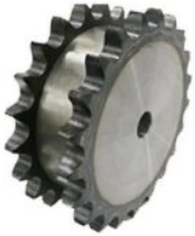
Two Stand Chain Sprocket