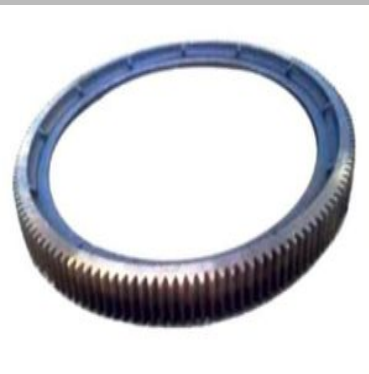
Kiln Girth Gear