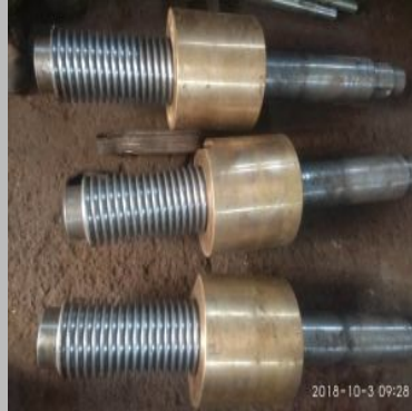
Butterfly Thread Lead Screw