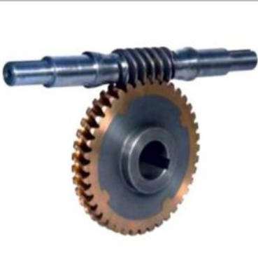
Worm Wheel Gear