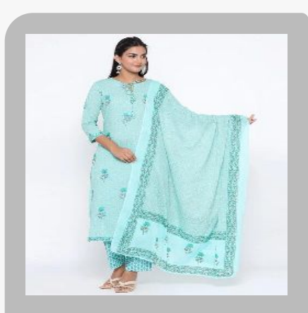
Nylon Viscose Dupatta