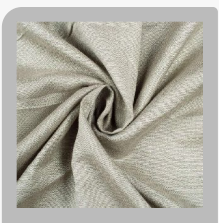
COTTON FLEX FABRIC