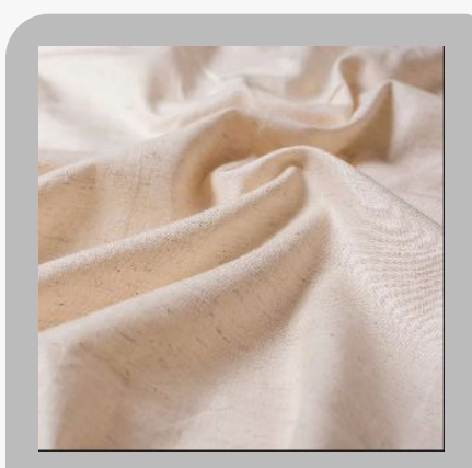
natural flax fabric