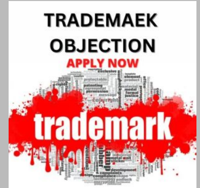
Trademark Objection Service