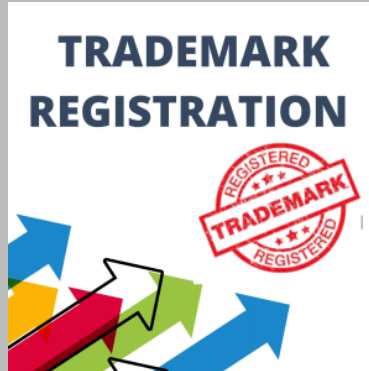
Trademark Registration Service