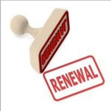
Trademark Renewal Service