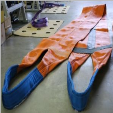
Wide Body Slings