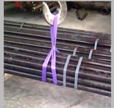
Flat Endless Polyester Slings