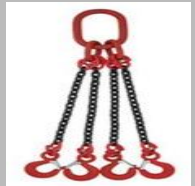
Multi Leg Chain Slings