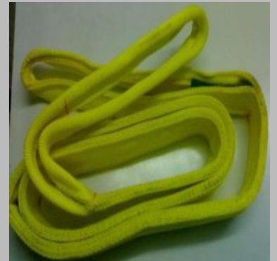
Triplex Webbing Slings