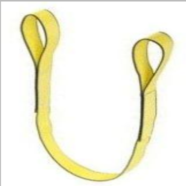
Simplex Webbing Slings

Lift Arts is known as top Manufacturer, Exporter, Supplier and Distributor of best Abrasives & Grains, Auto Accessories, Bags, Belts and Bolts.