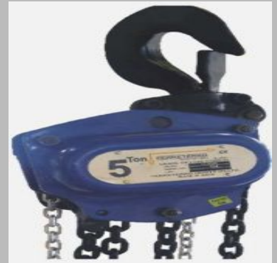
Silver Chain Pulley Block