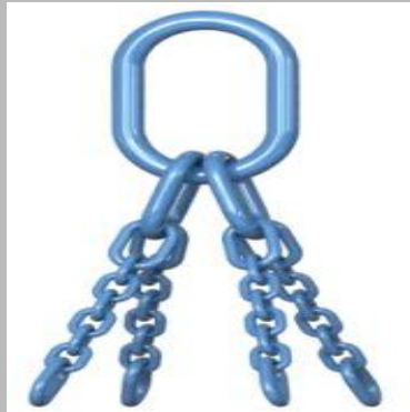
Welded Chain Slings