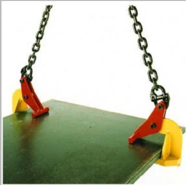
Horizontal Plate Lifting Clamp