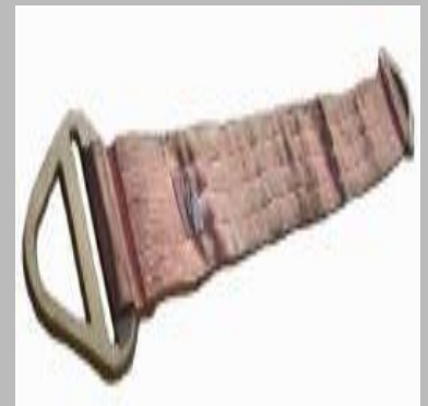
Reeving Choker Slings