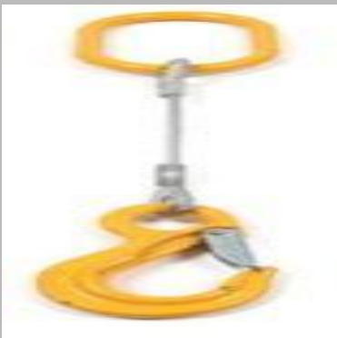
Single Leg Wire Rope Slings