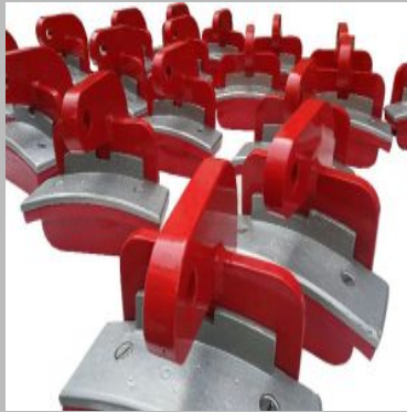
Pipe Lifting Clamp