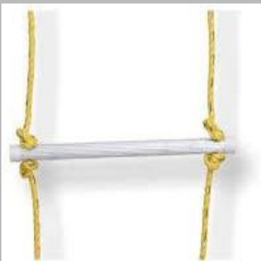
Aluminum Rung Rope Ladder