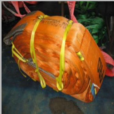
Multilayer Polyester Slings