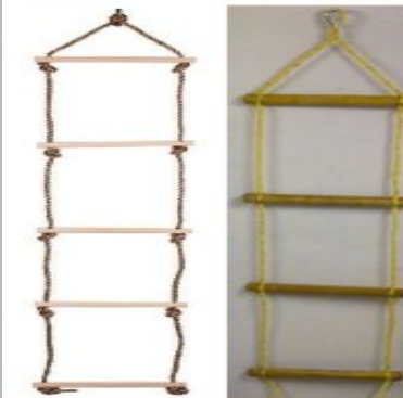
Wooden Rung Rope Ladder