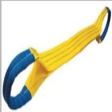
Duplex Webbing Slings