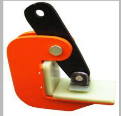
Non Marring Clamp