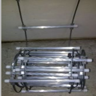
Wire Rope Ladder