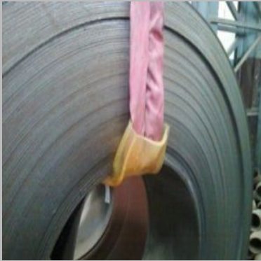
Coil Lifting With Ferretexx Sleeves