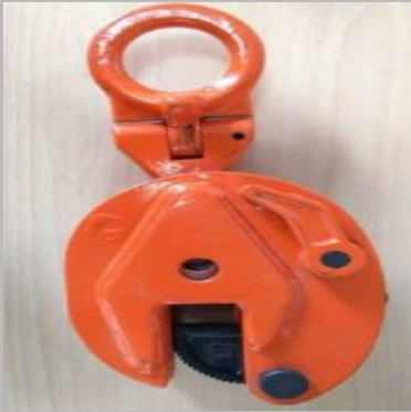
Vertical Plate Lifting Clamp