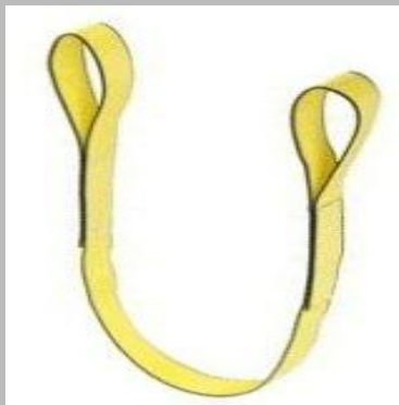
Simplex Webbing Slings