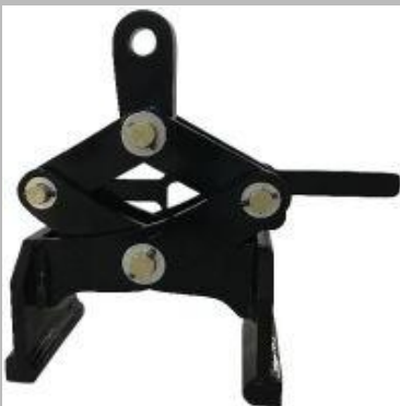
Rail Lifting Tong