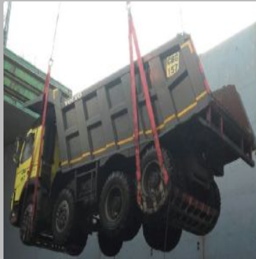
Vehicle Lifting Slings