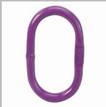
Oblong Ring Assembly