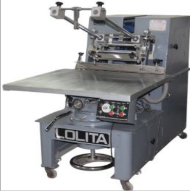
Semi Auto Flat Screen Printing Machine

Lolita Engineering Works is known as top Manufacturer, Exporter, Supplier, Retailer and Service Provider of best Coating Machine, Die Casting Machine, Racks & Stands, Screen Printing Machine and Squeegee Sharpner.