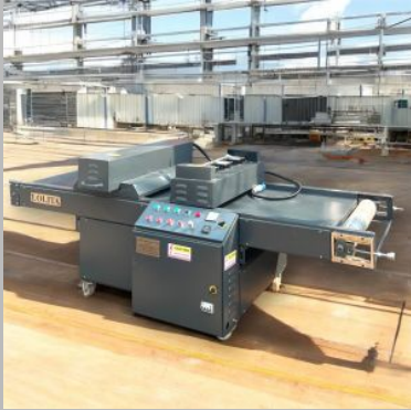
UV Curing Machine