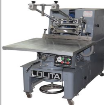
Semi Auto Flat Screen Printing Machine