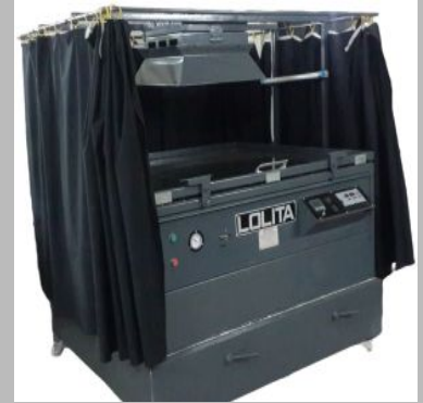
Screen Exposing Machine