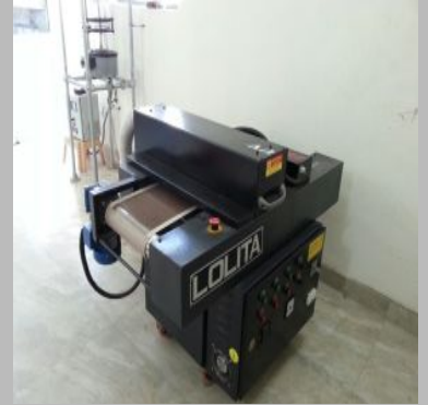
Lab Scale UV Curing Machine