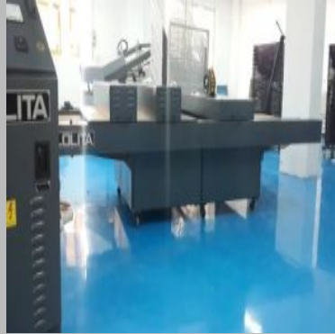
UV Curing Conveyor System