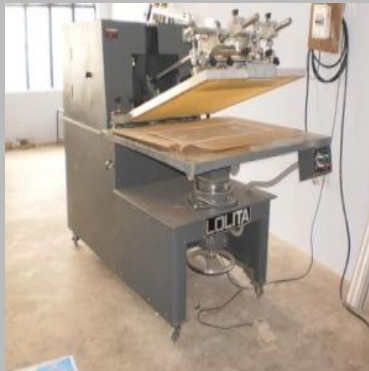
Spot UV Coating Machine