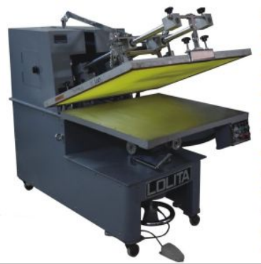
Flat Bed UV Screen Printing Machine