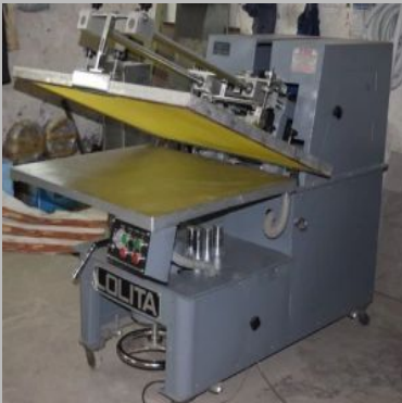
Semi Automatic UV Spot Coating Machine