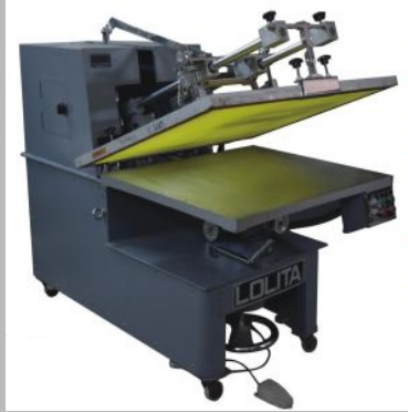
Flat Bed UV Screen Printing Machine