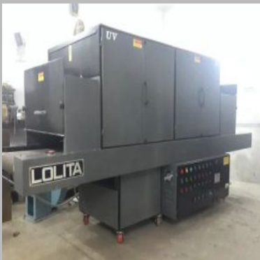
3D UV Curing Machine