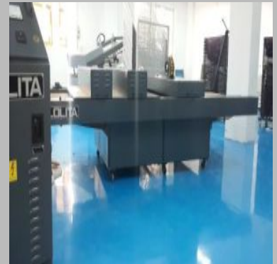
UV Curing Conveyor System