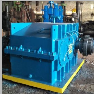
Multistage Reduction Gearboxe