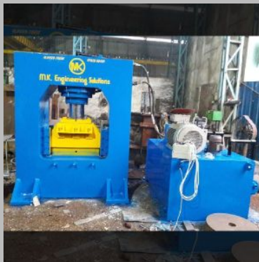
Cold Shearing Machine