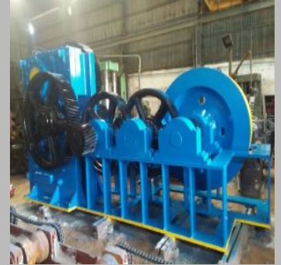
Billet Shearing Machine