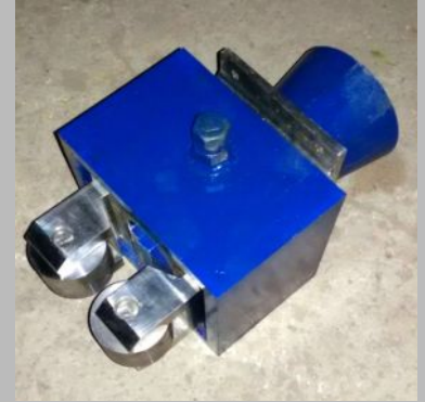
roller guide box