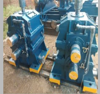
Reduction Cum Pinion Gearbox