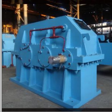
Single Stage Reduction Gearbox