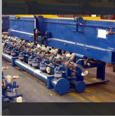
TMT Quenching Box