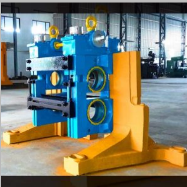
Housingless Mill Stand