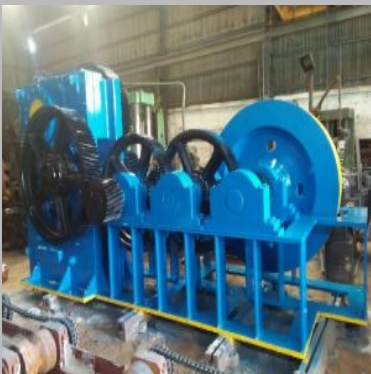
Billet Shearing Machine