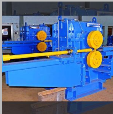
Hot Rolling Mill Stand