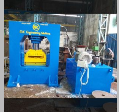
Cold Shearing Machine