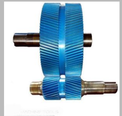
Reduction Gear Boxes