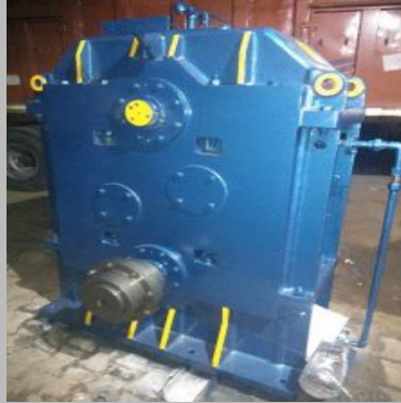
Flying Shearing Machine