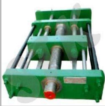
Hydraulic Billet Pusher