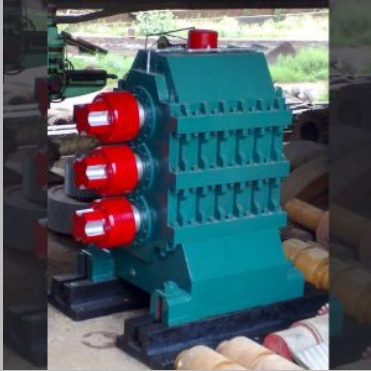
Speed Increasers Gearbox