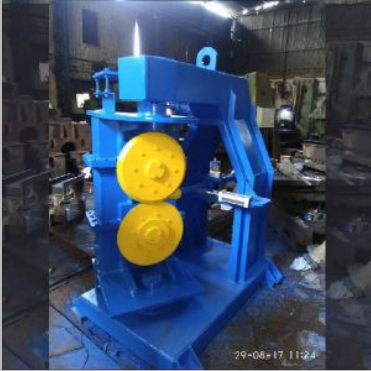
Rotary Shearing Machine