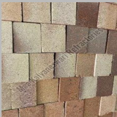
Refractory Bricks Is8 Quality