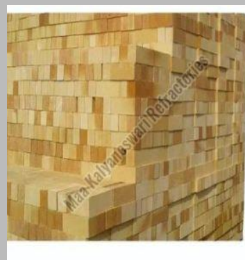
Refractory Side Arch Bricks