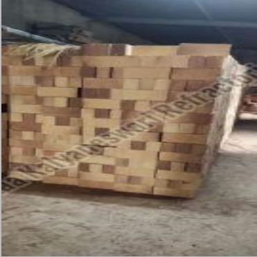
Standard Fire Brick Is8