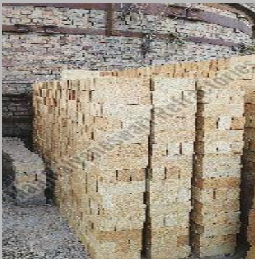
Refractory Fire Brick