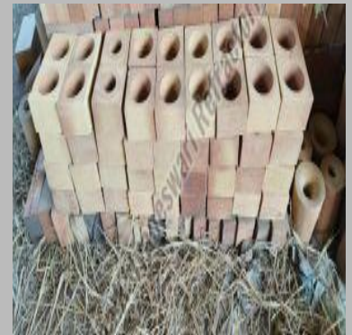
Refractory Tundish Well Block