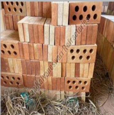
Perforated Refractory Fire Bricks