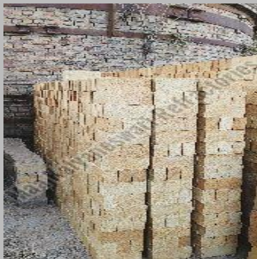
Refractory Fire Brick