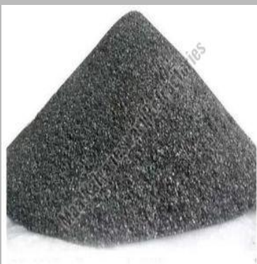
Nozzle Filling Compound NFC