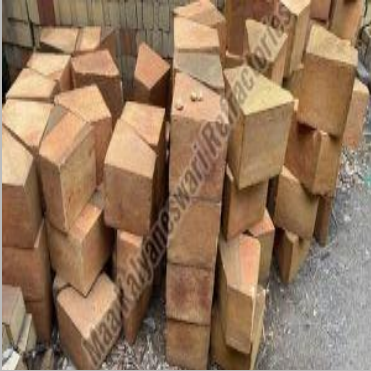
Alumina Skew Bricks