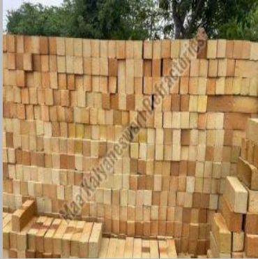
Alumina IS 6 Fire Resistance Bricks