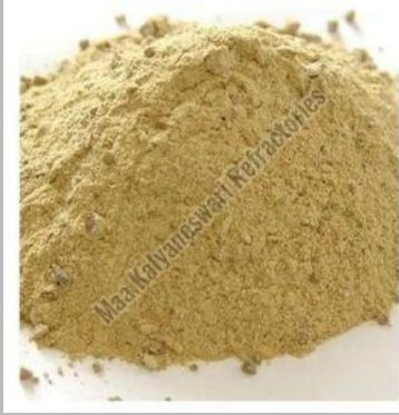
Fire Clay Mortar