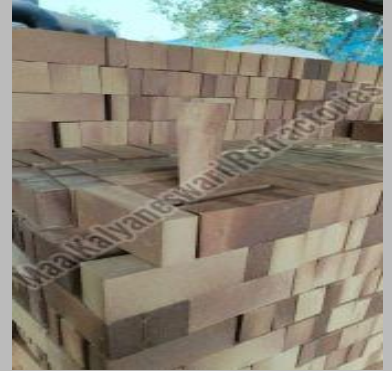
Arch Taper Refractory Fire Bricks