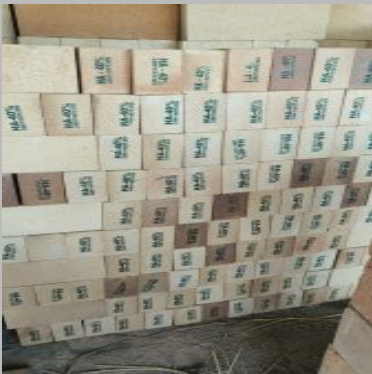
High Alumina Bricks