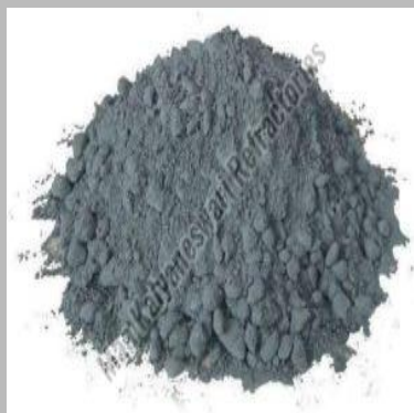
Whytheat K Refractory Castable