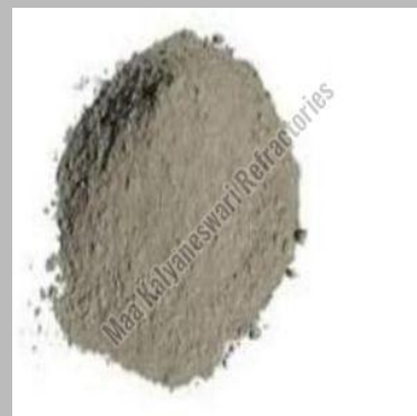
Fire Crete Super Castable