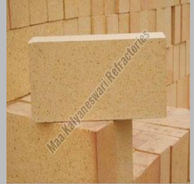
70 High Alumina Bricks