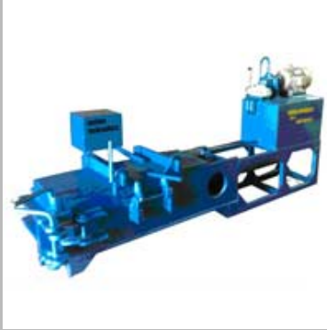
Single Action Hydraulic Scrap Baling Press