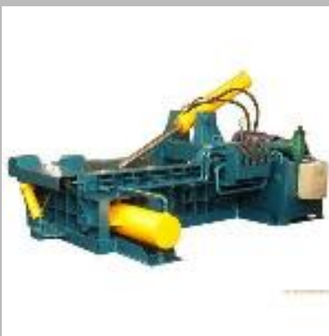
Hydraulic baling press (Raptor)