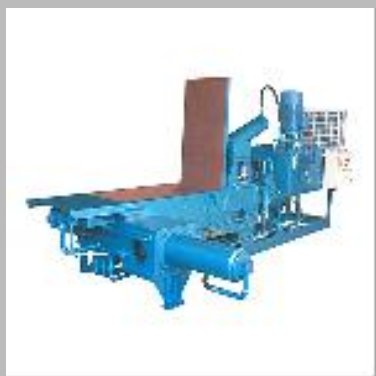
Hydraulic scrap baling press (Triple action MINI)