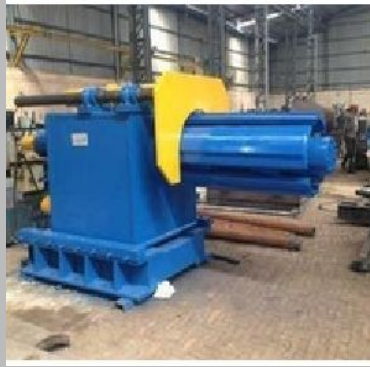
Hydraulic Decoiler Machine