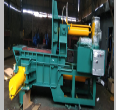
Scrap Bundle Press