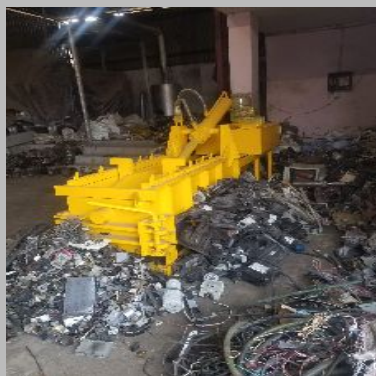
Scrap Baling Presses

Malwa Hydraulics is known as top Manufacturer, Exporter, Supplier and Retailer of best Grinding Mill, Hydraulic & Pneumatic Tools, Hydraulic Cyclinders, Hydraulic Presses and Industrial Furnace.