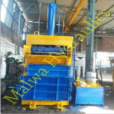
Vertical Baling Presses