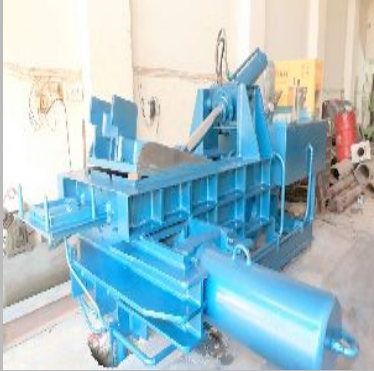
Triple Action Hydraulic Scrap Baling Press