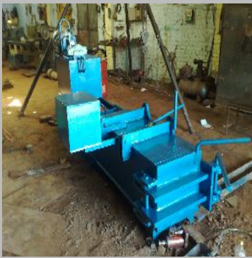
Scrap Bailing Press