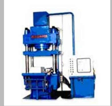
Pillar Type Hydraulic Press