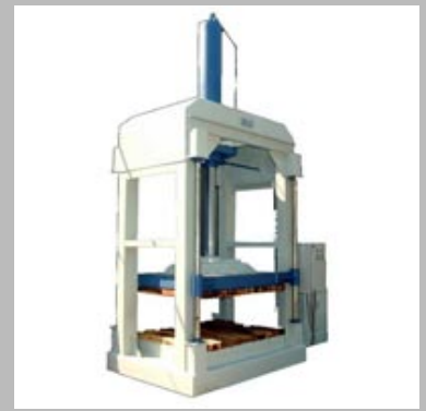
Non-metal Scrap Baling Press