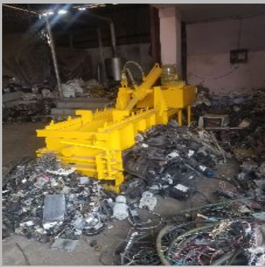
Scrap Baling Presses