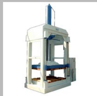
Non-metal Scrap Baling Press