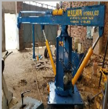
Hydraulic Pusher for Induction Furnace