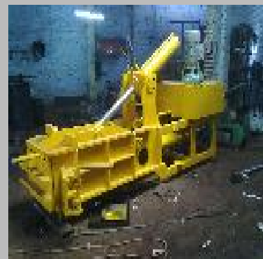
Hydraulic baling press Double action