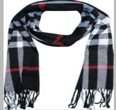
mens stylish muffler