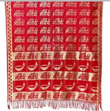
Mata Ki Chunri