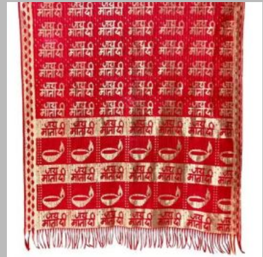
Mata Ki Chunri