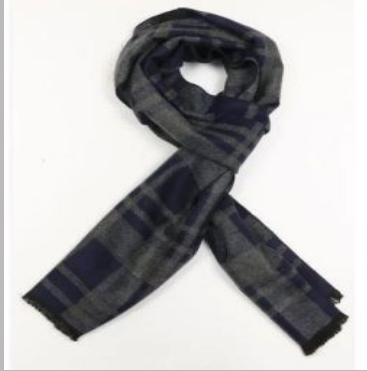
Mens Winter Muffler