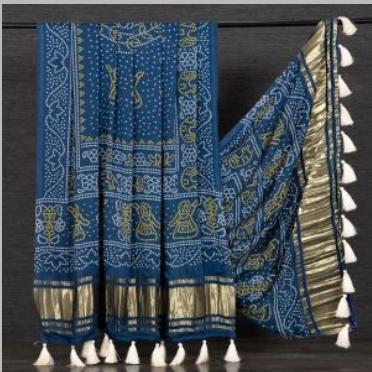
Printed Cotton Dupatta