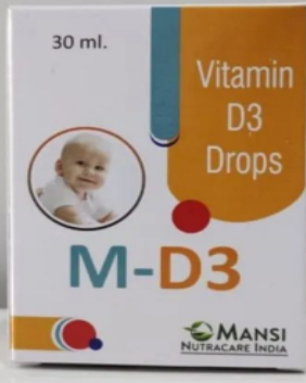
Vitamin D3 Drop