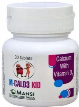
Calcium Vitamin D3 Tablet