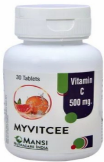
500mg Vitamin C Tablet

MANSI NUTRACARE INDIA is known as top Manufacturer, Exporter, Supplier and Service Provider of best Dietary Supplements & Nutraceuticals, Health Care Products, Manufacturing & Assembling Services, Mineral Supplements and Multivitamin Supplements.