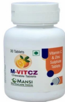
Vitamin C And Zinc Sulphate Tablet