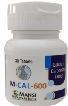
Calcium Carbonate Tablet