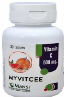
500mg Vitamin C Tablet