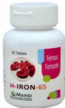
Ferrous Fumarate Tablet