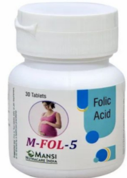
Folic Acid Tablet