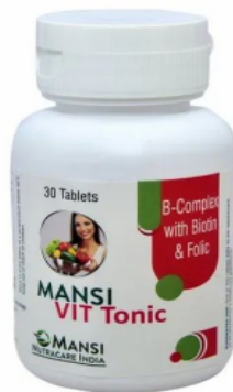
B Complex With Biotin Folic Tablet