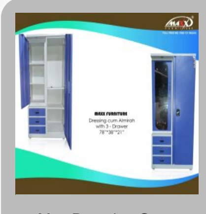
Max Dressing Cum Almirah