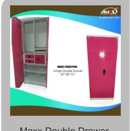
Maxx Double Drawer Almirah