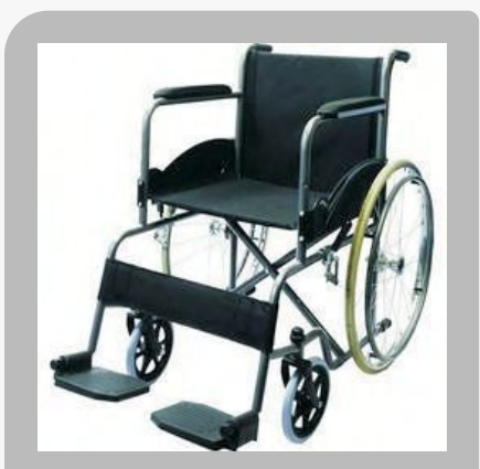
Wheel Chair with Break