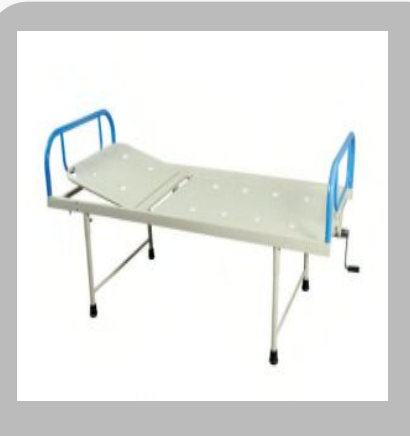
Semi Fowler Standard Bed