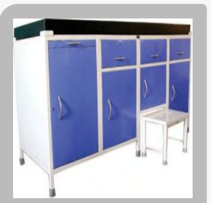
Full Size Examination Couch