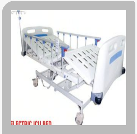
Three Function Electric Icu Bed