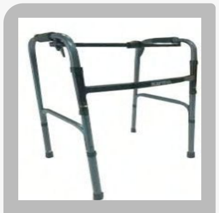
Plain Movable Walker