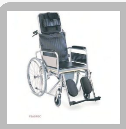
Reclining Commode Wheel Chair