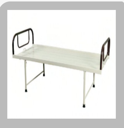
Plain Hospital Bed

Maxx Furniture is known as top Manufacturer, Exporter, Supplier, Retailer and Distributor of best Airport Equipment, Almirah, Bed Mattress, Canvas and Ceramic Tile Display.