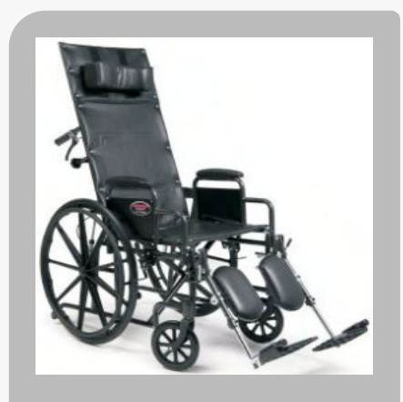
Reclining Wheel Chair