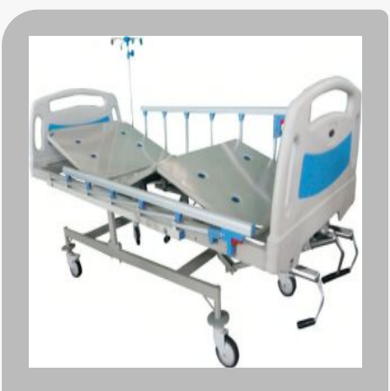
Three Function Manual Icu Bed