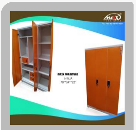
maxx 54 inch triple door almirah