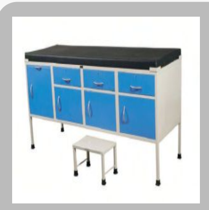
Small Size Examination Couch