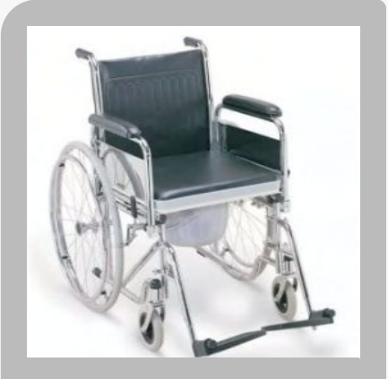
Regular Chrome Plated Wheel Chair