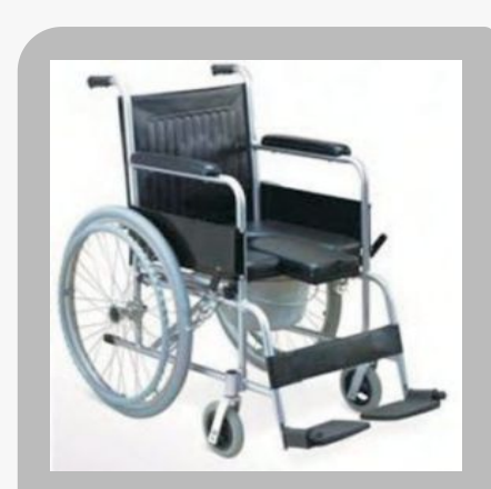
Commode Wheel Chair