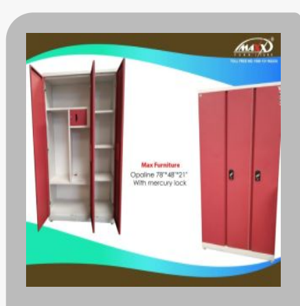
Maxx 48inch Tripple Door Almirah