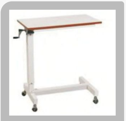
Mayo's Type Over Bed Table