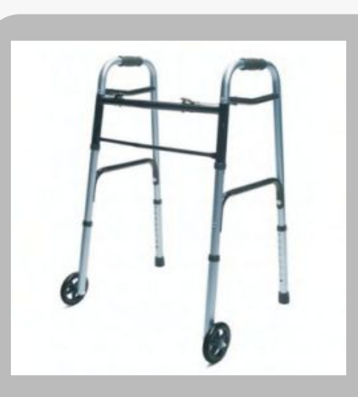
Movable Walker with Wheel