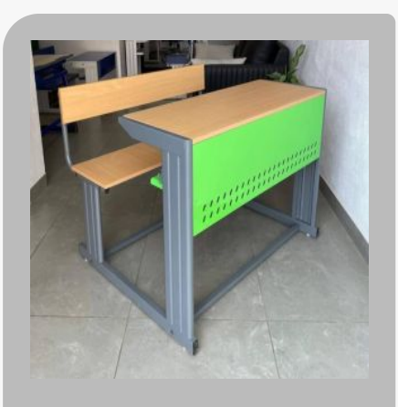
School Desk Bench