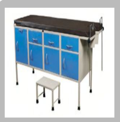
Gynec Examination Couch