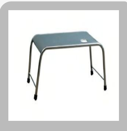
SS Over Bed Table