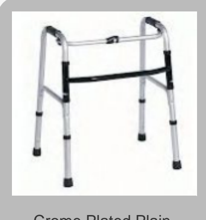
Crome Plated Plain Movable Walker