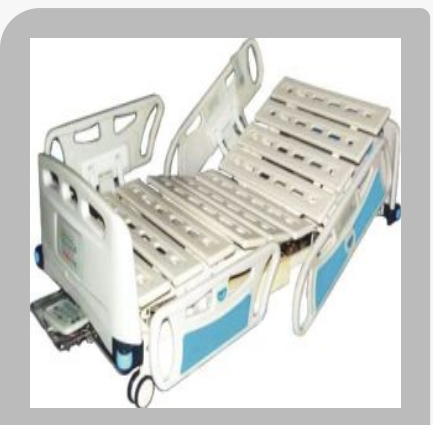
Five Function Electric Icu Bed