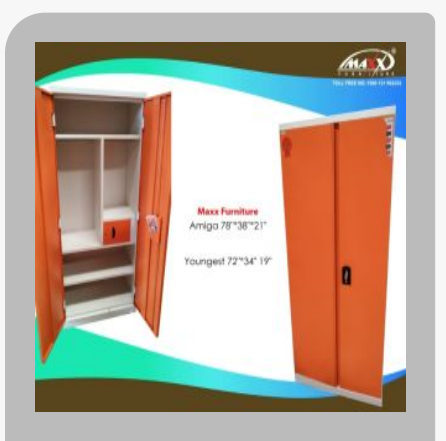
Maxx Economy Youngest Almirah