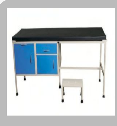
Half Closed Examination Couch