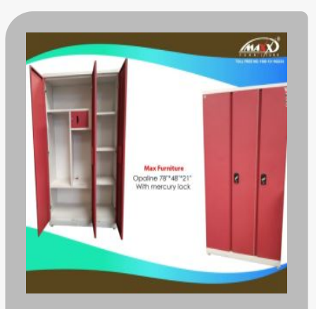
Maxx 48inch Tripple Door Almirah