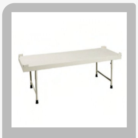
Standard Attendant Bed