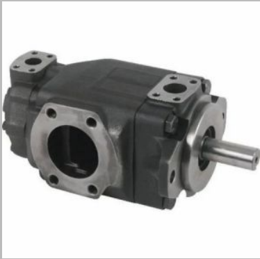
Yuken Vane Pump