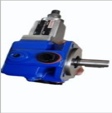
Vane Type Hydraulic Motor