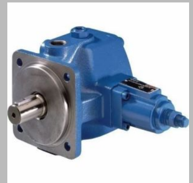
Bent Axis Piston Pump