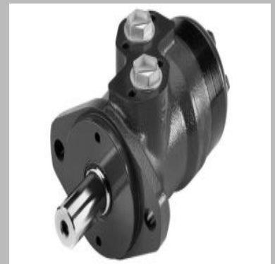
Danfoss Hydraulic Motor