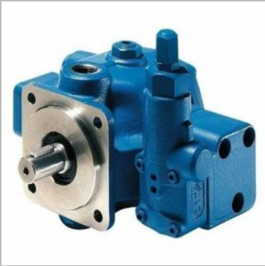
Hydraulic Variable Vane Pump