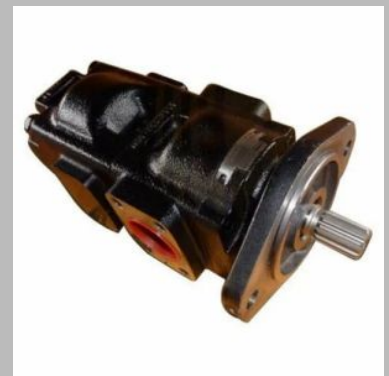
JCB Hydraulic Pump