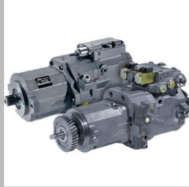
Linde Hydraulic Pump