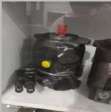
Radial Piston Pump