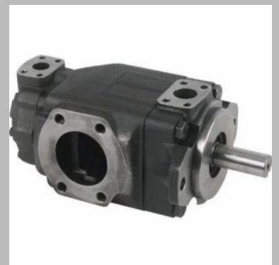
Veljan Hydraulic Vane Pump