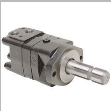
Parker Hydraulic Pump