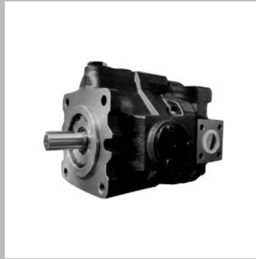
Variable Displacement Pump