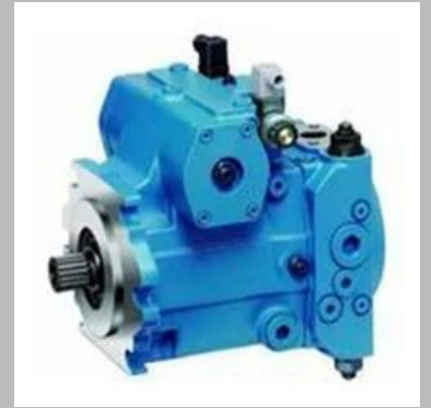
Rexroth Valve Hydraulic Pump