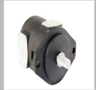
Hydraulic Single Vane Pump