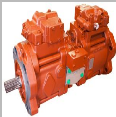
Kawasaki Hydraulic Pump