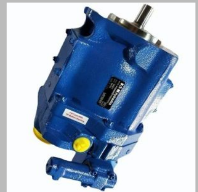
Eaton Vickers Hydraulic Pump