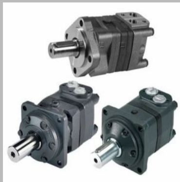
Danfoss Hydraulic Orbital Motor