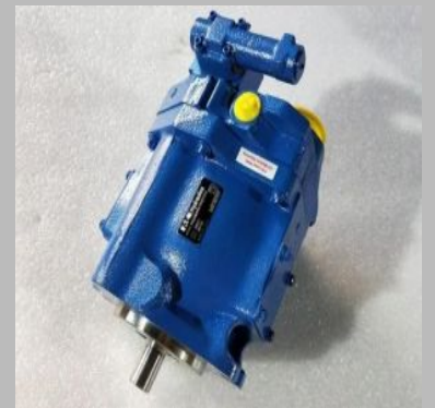
Eaton Vickers Hydraulic Piston Pump