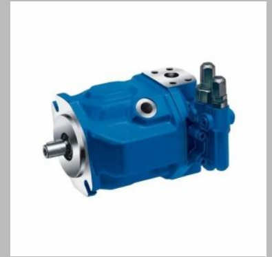
Rexroth Piston Pump