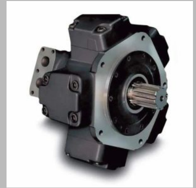
Orbit Hydraulic Motor