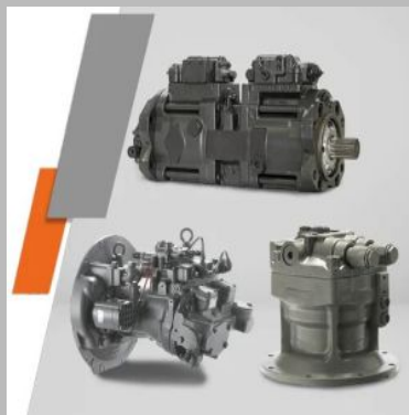
Hitachi Hydraulic Pump