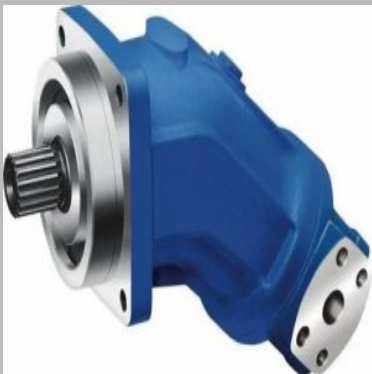
Hydraulic Bent Axis Pump