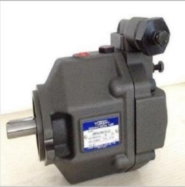
Yuken Hydraulic Piston Pump