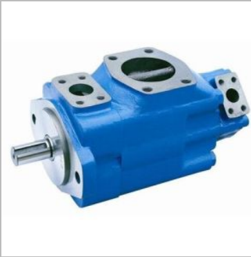
Hydraulic Vane Pump