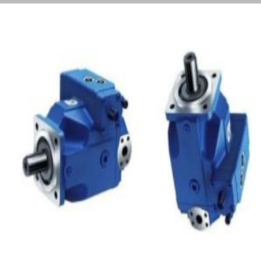
Rexroth Hydraulic Piston Pump