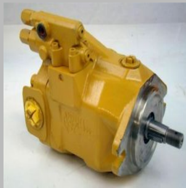
Hydraulic Axial Piston Pump