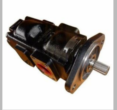
JCB Hydraulic Pump