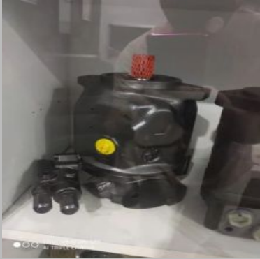
Radial Piston Pump