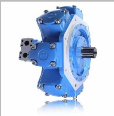
Intermot Hydraulic Motor