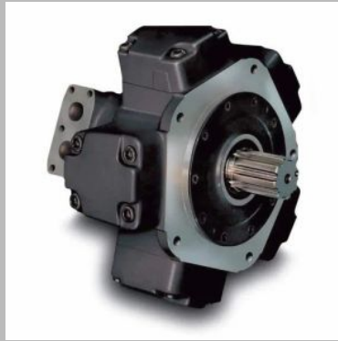
Radial Piston Motor