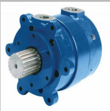
Crane Hydraulic Pump