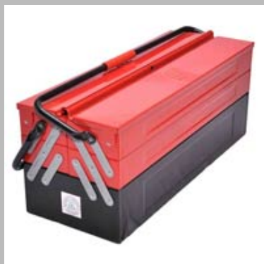
Three Compartment Cantilever Tool Boxes