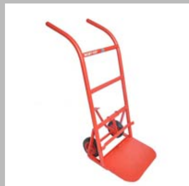
Gunny Bag Trolley