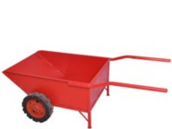
Industrial Trolley (MGMT - WB)