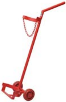
single cylinder trolley