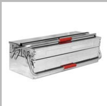
Three Compartment Stainless Steel Cantilever Tools Boxes