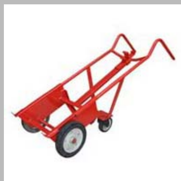
Industrial Trolley (MGMT - BT)