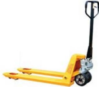
Hydraulic Pallet Truck