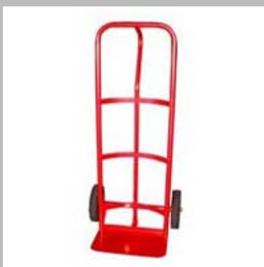
Industrial Trolley (MGMT - CT)