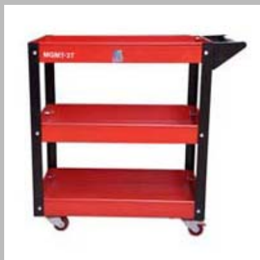
Tool Cabinet Trolley (MGMT-3T)