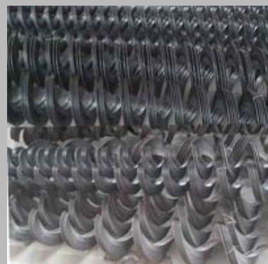
Cold Rolled Conveyor Screw Blades