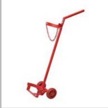
Industrial Trolley (MGMT - SCT)