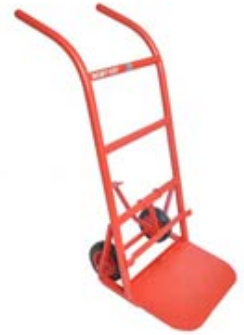
Gunny Bag Trolley