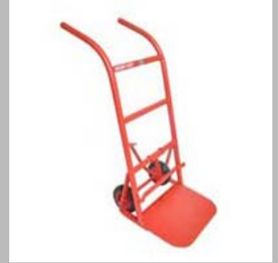
Industrial Trolley (MGMT - GBT)