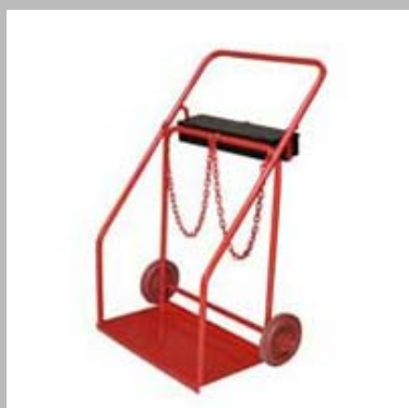
Industrial Trolley (MGMT - DCT)