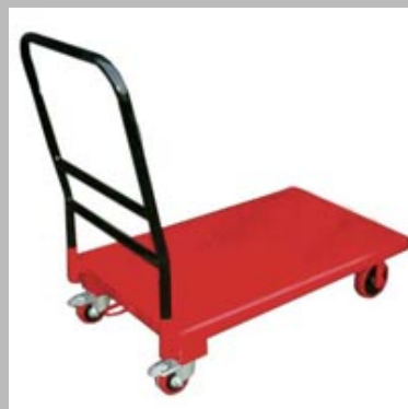
Industrial Trolley (MGMT - PT)