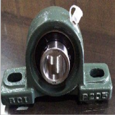
UCP Series Bearings