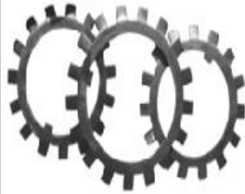
STAINLESS STEEL LOCK WASHERS