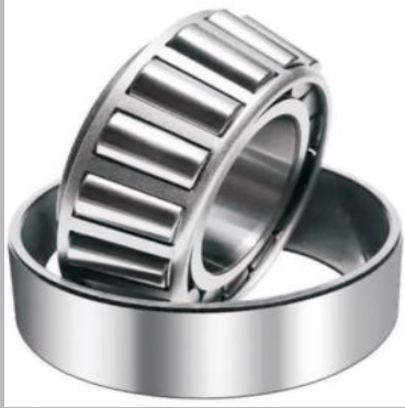
Taper Roller Bearing