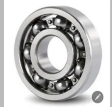
Single Row Deep Groove Ball Bearing