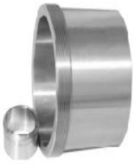
Stainless Steel Withdrawal Sleeves