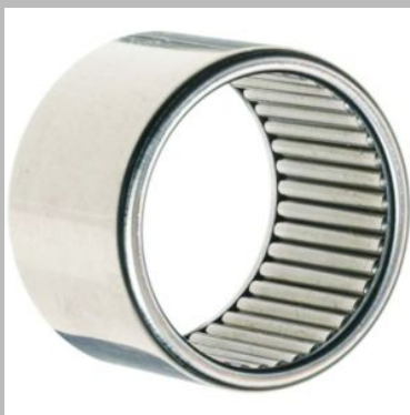
Needle Roller Bearing