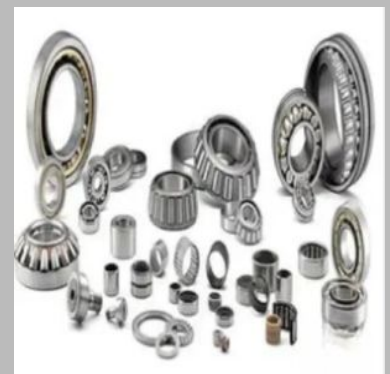
Industrial Ball Bearing