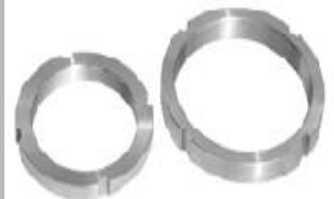
Stainless Steel Lock Nuts