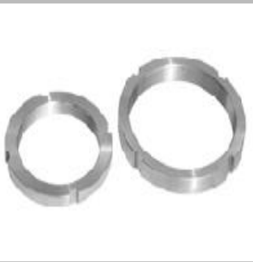
Stainless Steel Lock Nuts