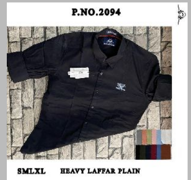
Mens Heavy Laffar Plain Shirt