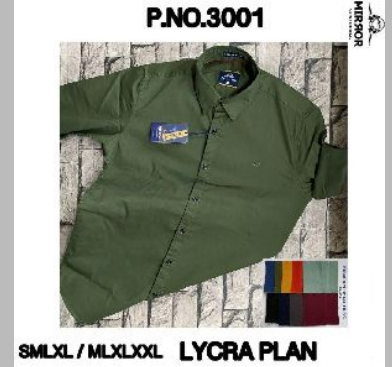
Mens Lycra Plain Shirt