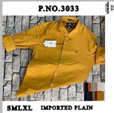
Mens Imported Plain Shirt