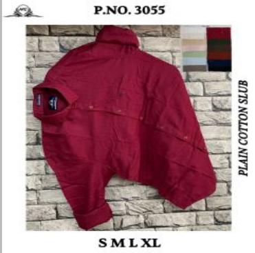
Mens Plain Shirt