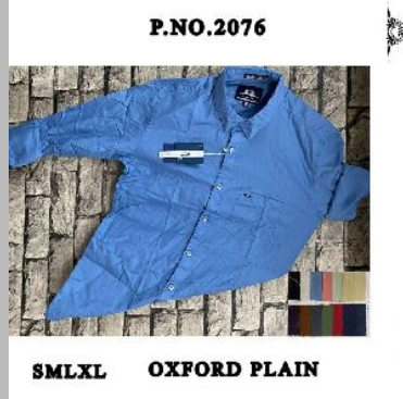
Mens Oxford Plain Shirt