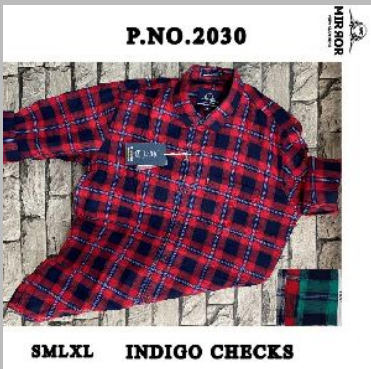
Mens Indigo Check Shirt