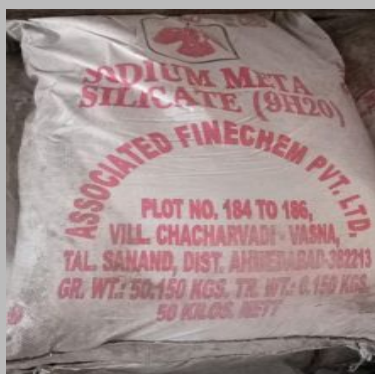
Sodium Metasilicate Powder