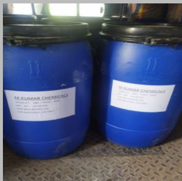
Disperse Printing Thickener