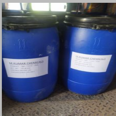
Disperse Printing Thickener