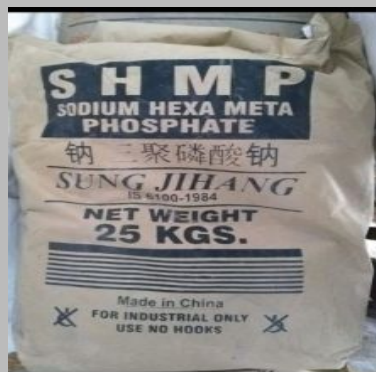
Sodium Hexametaphosphate Powder