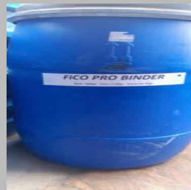
Fico Pro Foil PASTE