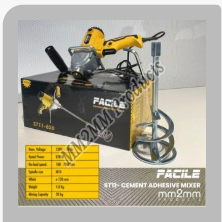
FACILE 850 WATTS PUTTY MIXER