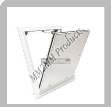
Easy Access Plain 2020 Ceiling Trap Door