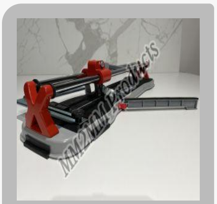
Manual Tile Cutting Machine