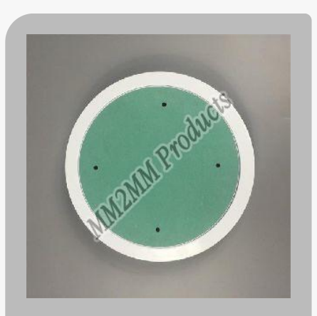
Easy Access Round Ceiling Trap Door