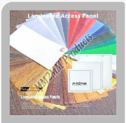
Easy Access Lamianted 4545 Ceiling Trap Door