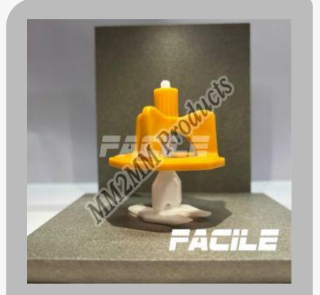
FACILE Tile Leveling System Spiral Kit Reusable Tile Tools(Orange Cap -50pcs ) MM2MM PRODUCTS