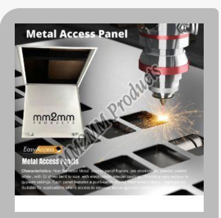
Easy Access Metal Trap Door 4545