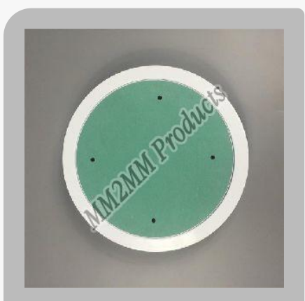
Easy Access Round Ceiling Trap Door