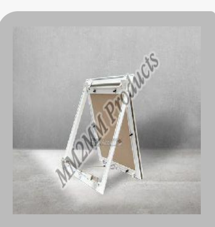
Easy Access Aluminum PC Frame Ceiling Trap Door