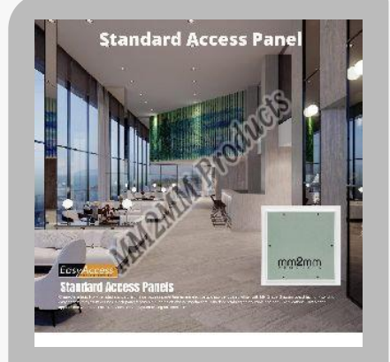
Easy Access Trap Door 4545