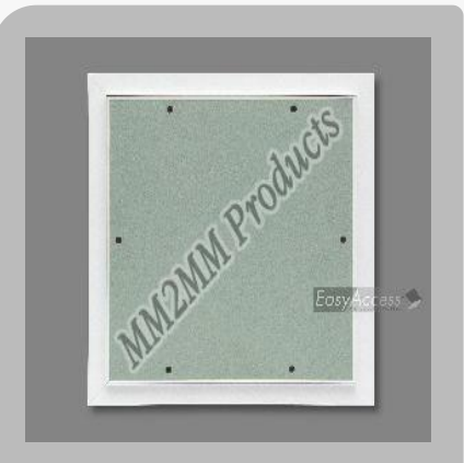
Easy Access ceiling Trap Door 3030