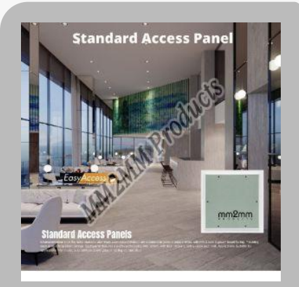
Easy Access Trap Door 6060