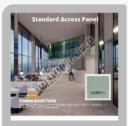
Easy Access Trap Door 2020