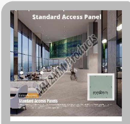
Easy Access Trap Door 2020