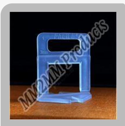
Facile(R)Tile Leveling System Clip Big 3MM PREMIUM