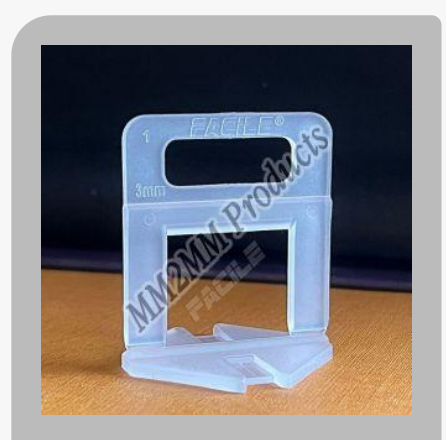
Tile Leveling System Clips