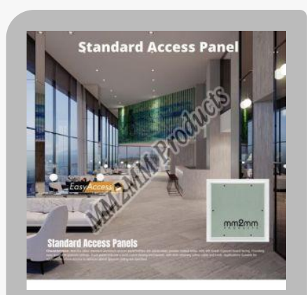
Easy Access 6060 Ceiling Trap Door