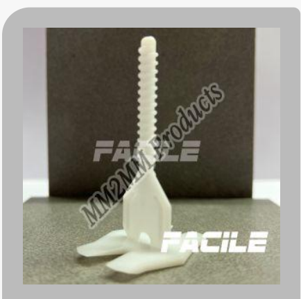
FACILE Tile Leveling System Spiral Kit Tile Leveler Needle Thickness 1.5mm/ 3mm Tile Tools