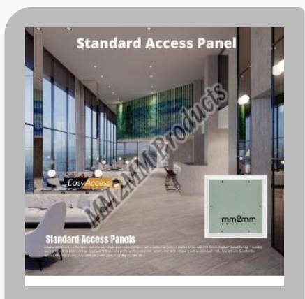
Easy Access Trap Door 6060