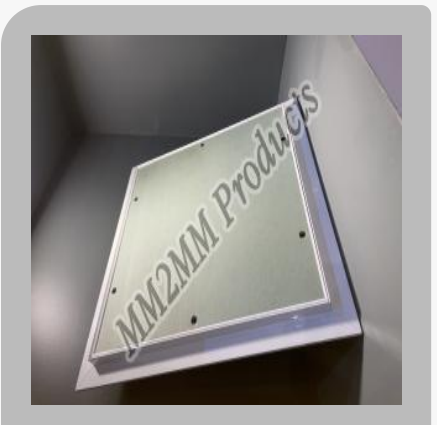
Easy Access Aluminum White Ceiling Trap Door