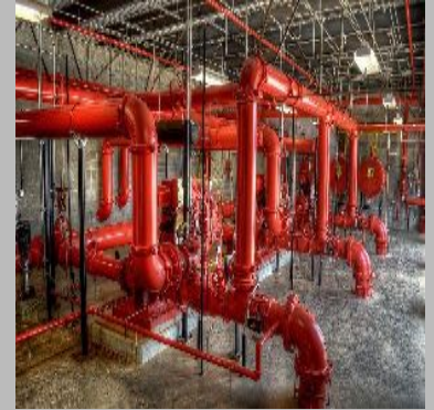
Fire Fighting Consultancy Service