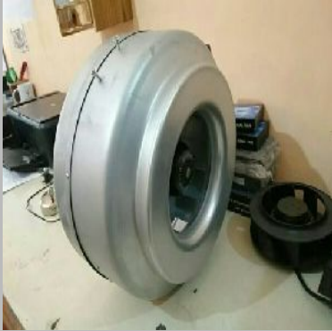
Ostberg Inline Fan