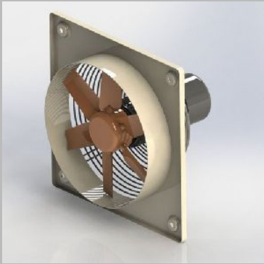
Wall Mounted Axial Fan