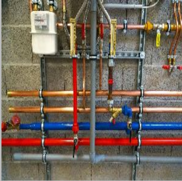
Plumbing Consultancy Service