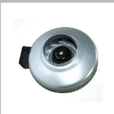
Industrial Inline Fan