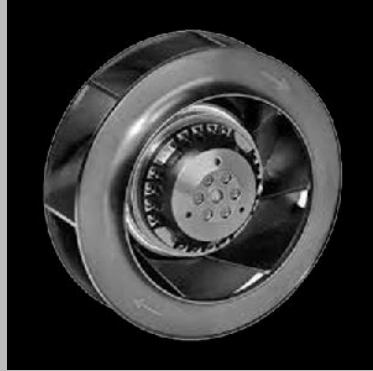
R2E175AR72-05 EBM PAPT BACKWARD CURVED FANS