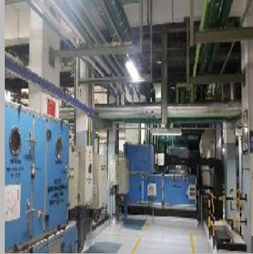
HVAC Consultancy Service