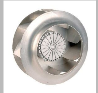
Backward Curved Fan