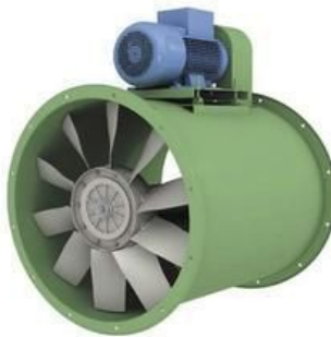
Axial Flow Fans