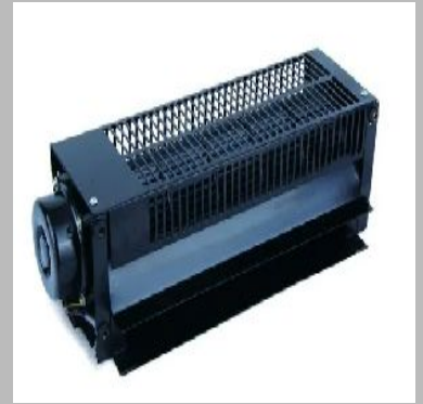
Elevator Blower Fan