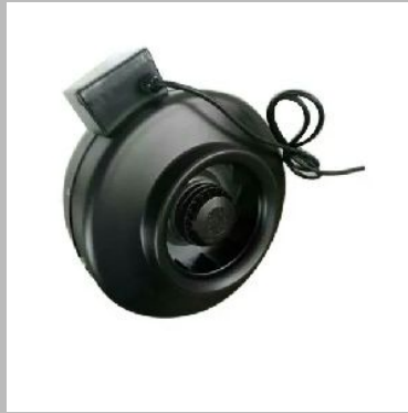
Kitchen Exhaust Fan