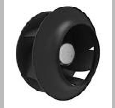
r2e133-ae17-05 backward curved fans