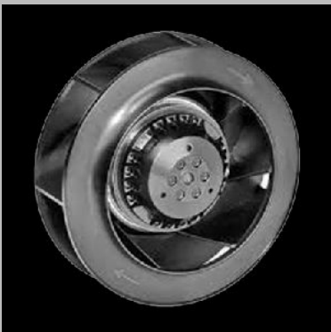
backward curved blower