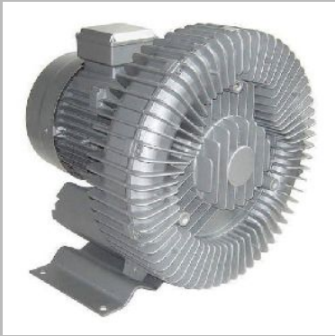
Side Channel Blower