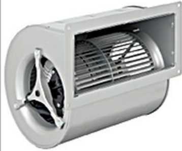
FS120 Centrifugal Blower Forward Curved Dual Inlet DH120A1-AGT- 01 (FS-120)