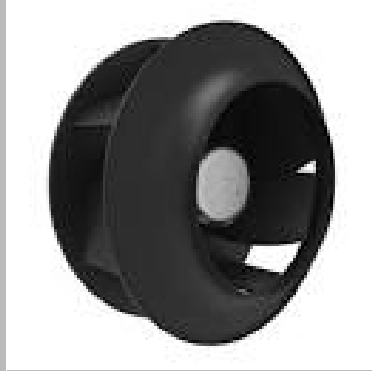
r2e133-bh66-05 backward curved fans