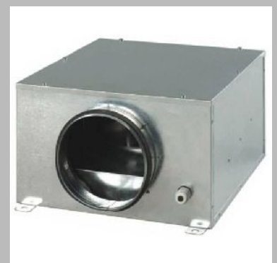
Inline Box Fan