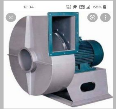
Centrifugal Air Blowers