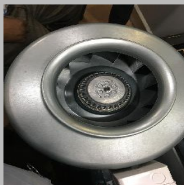
Inline Duct Fan