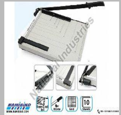
Manual Paper Cutting Machine NB12