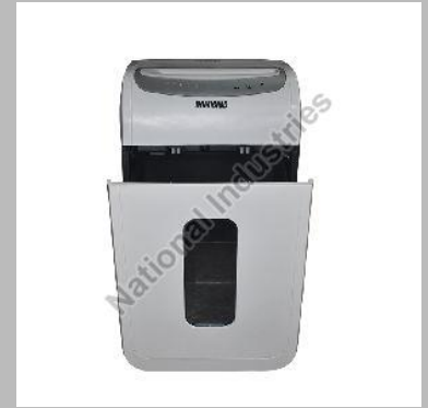
Heavy Duty Paper Shredder NB 26CD