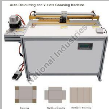
Pneumatic V Grooving Machine