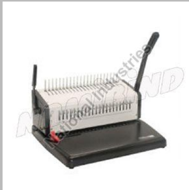
S-900 | Comb Binding Machine (A4)