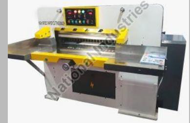
Namibind Hydraulic Paper Cutting Machine