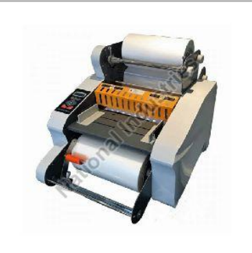
Thermal Desktop Hot Roll Laminator | F350