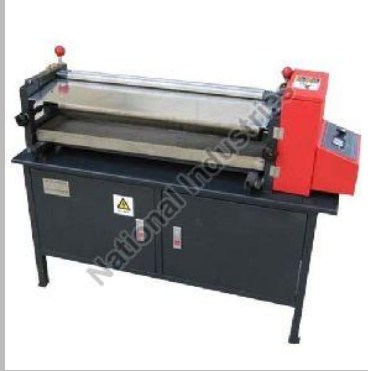
ZX-700 | Glue Binding Machine (Cold Only)