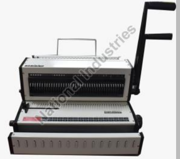
wiro binding machine |(2 in 1) 2018