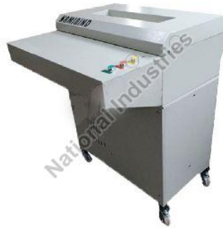
cardboard shredders | Shredman - 750HD