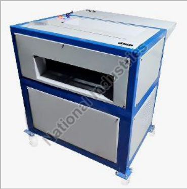
SC- 7611 Strip Cut High Speed Paper Shredder Machine