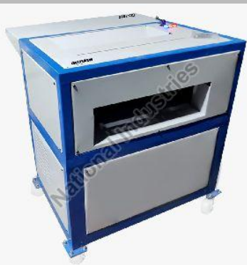
Heavy Duty Cross Cut Shredder Machine