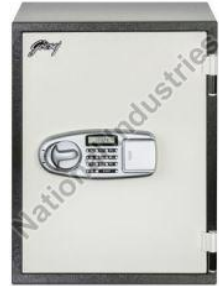
Godrej Safire 40L (Vertical) Electronic Home Locker