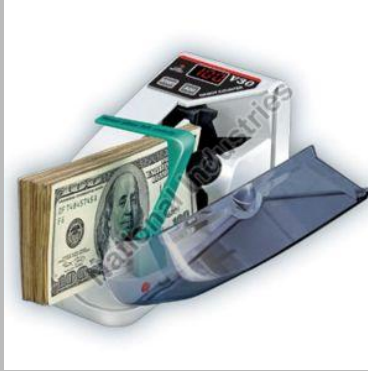
V30 | Portable Note Counting Machine