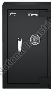
Godrej Safe Matrix 3016 Digital Locker