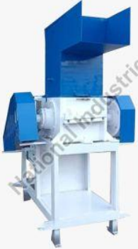
Single Shaft Organic Waste Shredder Machine