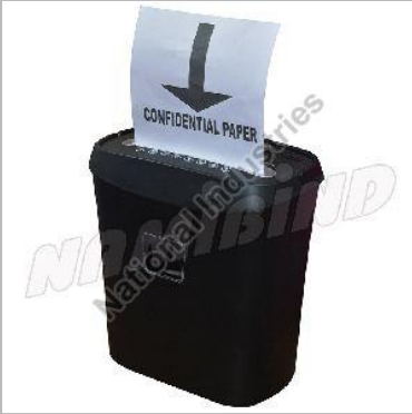
Personal Paper Shredder | NB-5X