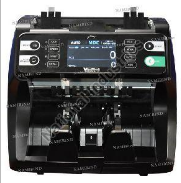
Valuematic | Godrej mix value counting machine