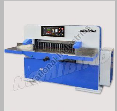
paper cutting machine | ZX-4300 (43?)