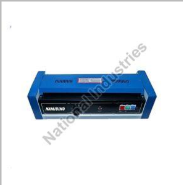
Semi-Automatic Lamination Machine (24&Prime;)