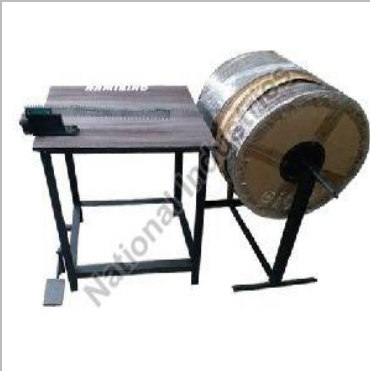
Wiro Cutting Machine