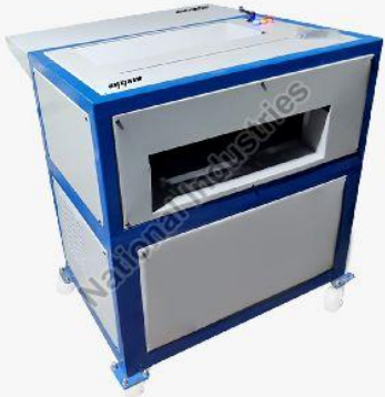
industrial paper shredder