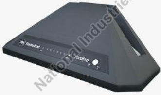
GBC T 500 Pro Thermal Binding Machine

National Industries is known as top Manufacturer, Exporter, Trader and Supplier of best Adhesives, Adhesives & Sealants, Agricultural Shredder, Air Purifiers and Banding Machine.