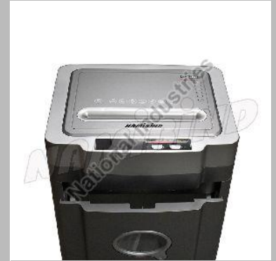
NB-2425 | Heavy Duty Paper Shredder