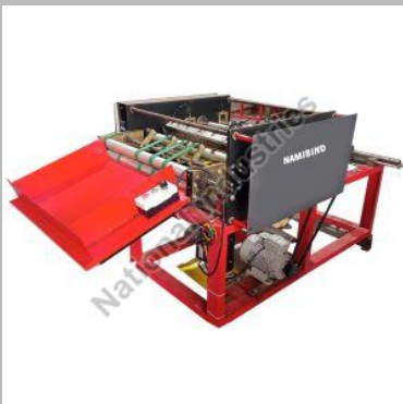
Paper Reel to Sheet Cutting Machine