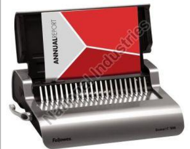
QuasarE 500 Electric Comb Binding Machine