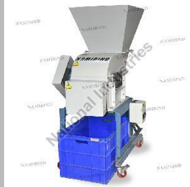
organic waste shredder machine