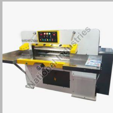
Namibind Hydraulic Paper Cutting Machine