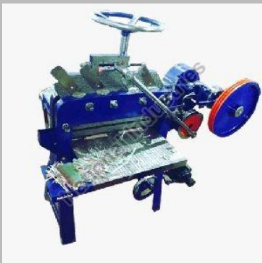
NAMIBIND Mild Steel Manual Paper Cutting Machine 32&amp;amp;amp;quot;