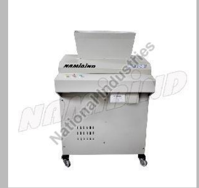
IHD 100 Industrial Paper Shredder