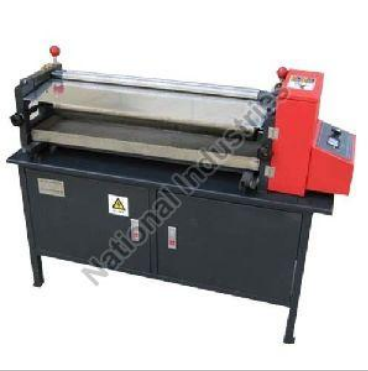
ZX-700A | Hot & Cold Glue Binding Machine