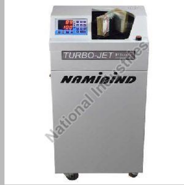
Namibind Bundle Counter Turbojet Floor