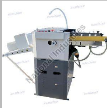
paper half cutting machine