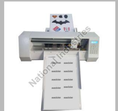
label cutting machine / A3+ Pro