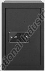
NX Pro Digital 40L Locker