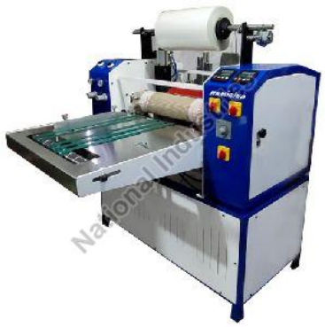
Double-side Digital Thermal Lamination Machine Ultima -15