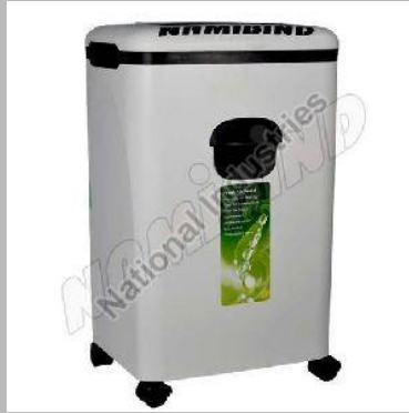
Paper shredder with Air Purifier | NB-62X