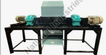
Raffia Bag shredder machine