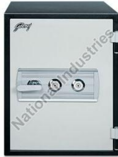
Godrej Safire 40L (Vertical) key lock Home Locker