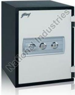
Godrej Safire 20L Mechanical