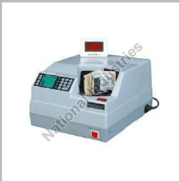
Maxsell Bundle Counter Nepal Delhi