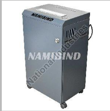
Heavy Duty Paper Shredder NB-521