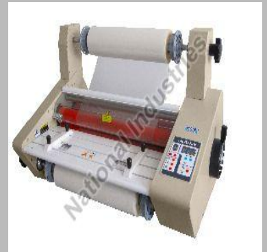
Roll to Roll Laminator Falcon 3650 ( 25&Prime;)