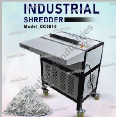
Cross Cut High Speed Paper Shredder