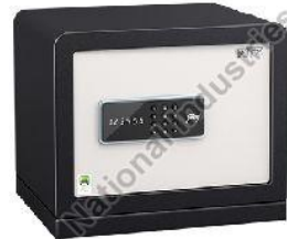
Godrej Ritz Touch with I Buzz Home Locker