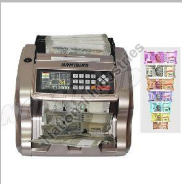
Mix Note Value Counting Machine