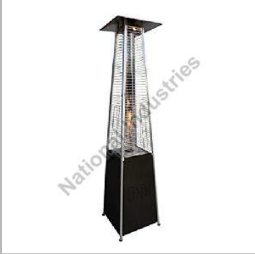
Pyramid Tower Heater