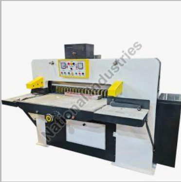
Semi-Automatic Paper Cutting Machine