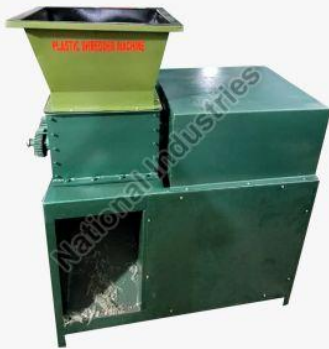
Plastic Waste Shredder Machine PWS-750