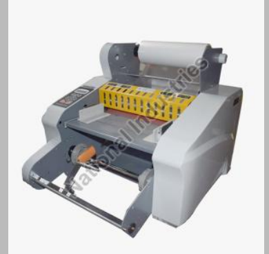
Thermal Lamination Machine