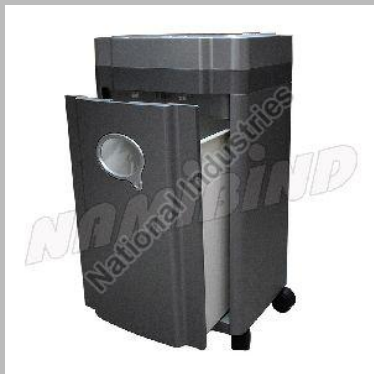
heavy duty paper shredder