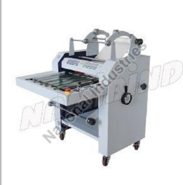
Thermal Laminator Model No. 490