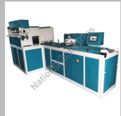
Fully Automatic notebook making machine