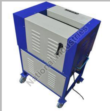
Heavy Duty Paper Shredder | shredman 1000