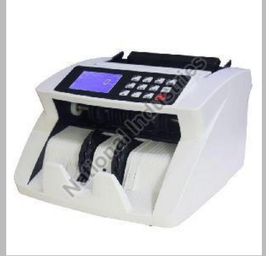
Money Counting Machine KASTROL 1