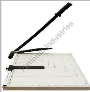
Manual Paper Cutting Machine NB18