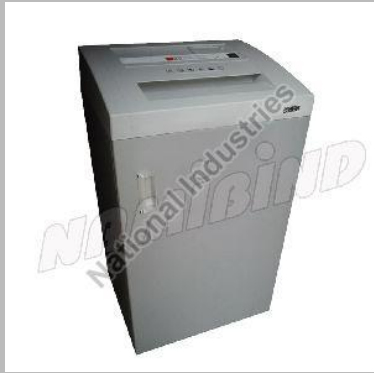
Heavy Duty Paper Shredder | NB-621A