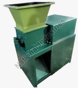
Mix Waste Shredder Machine | PWS-1000