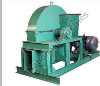
Sawdust Making Machine