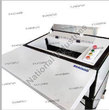
SC-5610 High Speed Paper Shredder