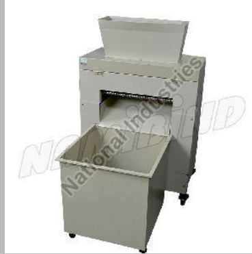
IHD 99 Industrial Paper Shredder