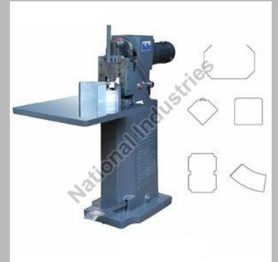
Pneumatic Corner Cutting Machine NB 1200A