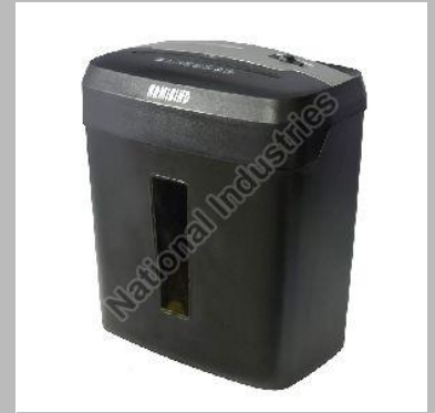
Personal Use Paper Shredder | NB-11X