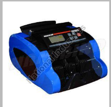
Loose Note Counting Machine Primex B