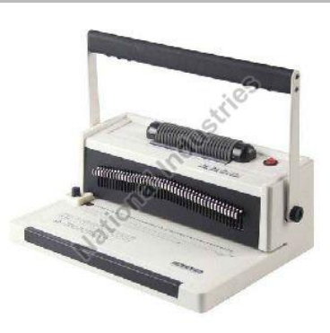
S20A | Manual Punching and Auto Inserter Binding machine