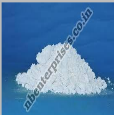
Hafnium Oxide Powder