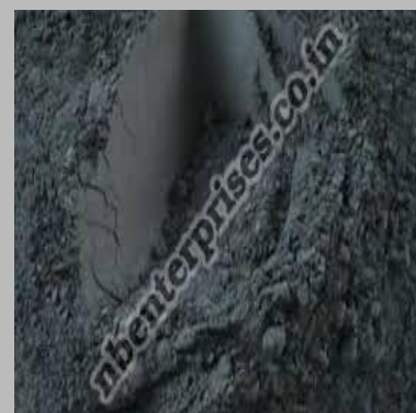
Tungsten Carbide Powder