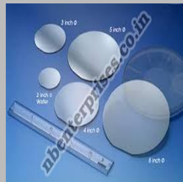
Gallium Nitride Substrate