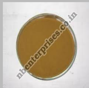
Zirconium Nitride Powder