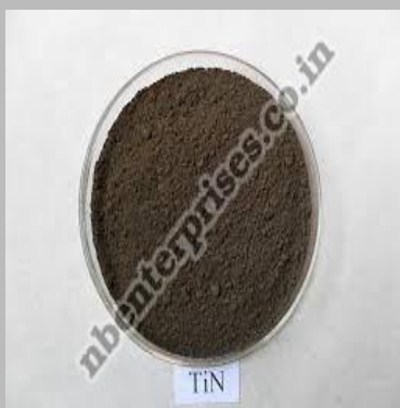
Titanium Nitride Powder