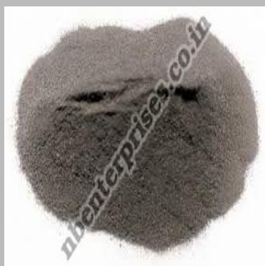
Niobium Carbide Powder