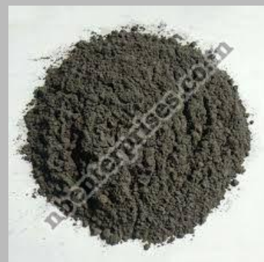
Titanium Boride Powder