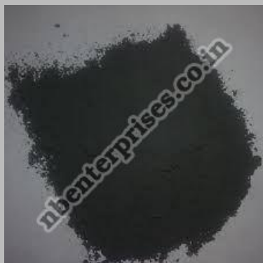
Zirconium Carbide Powder