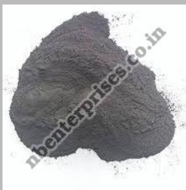
Tungsten Metal Powder