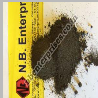
Tantalum Carbide Powder