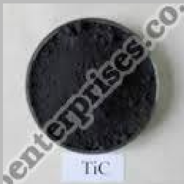
Titanium Carbide Powder