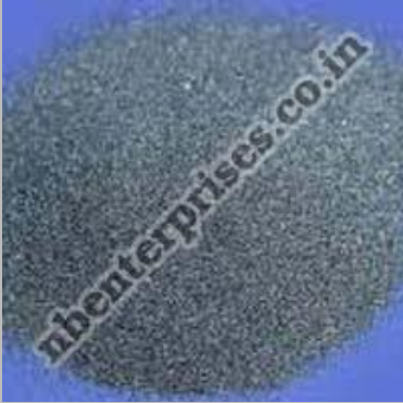
Titanium Alloys Powder