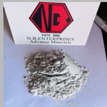
Aluminum Nitride Powder