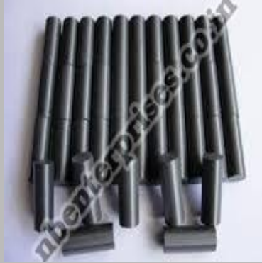
Silicon Nitride Rods