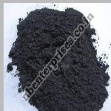
Hafnium Carbide Powder