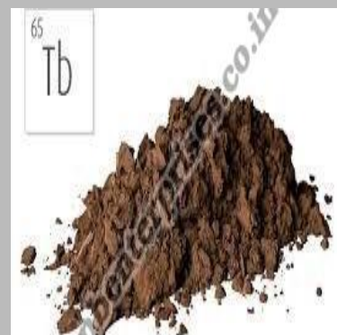
Terbium Oxide Powder