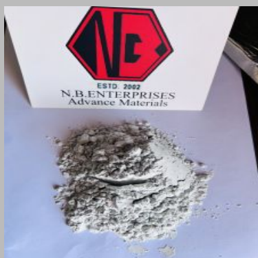
Aluminum Nitride Powder