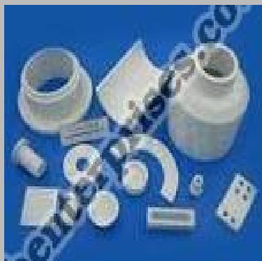
Boron Nitride Plate