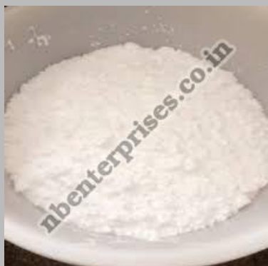
Scandium Oxide Powder