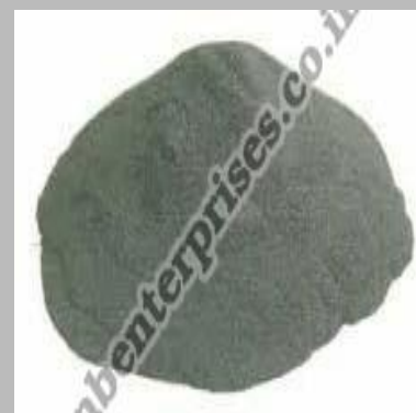
Titanium Hydride Powder