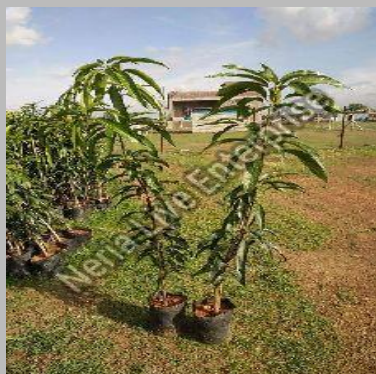
Mango Malda Grafted Plant