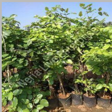
Red Sandalwood Plant