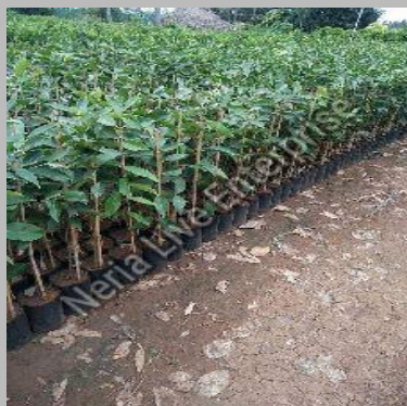
Syzygium Cumini Plant