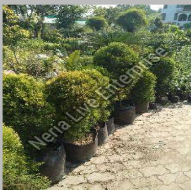
Golden pine plant