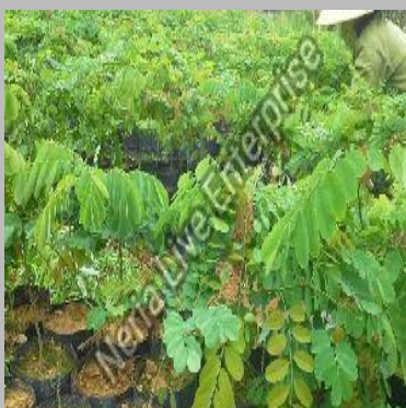
Indian Senna Plant