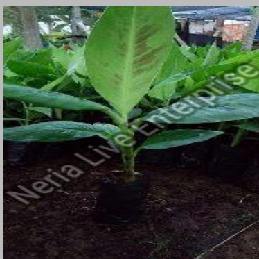
Tissue Culture Banana Plant