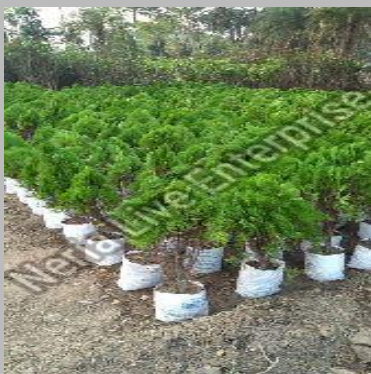
Tuja Pine Plant