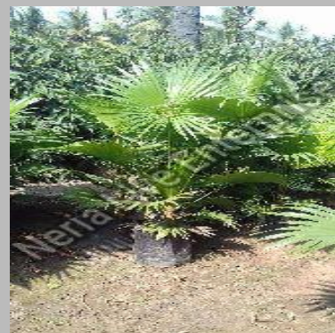
Umbrella Palm Plant