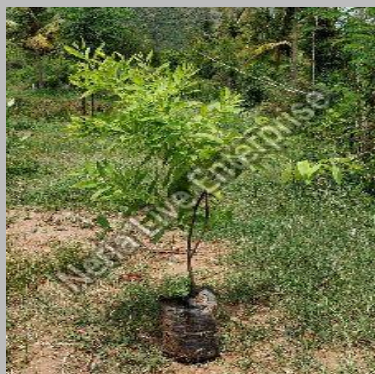
white sandalwood plant