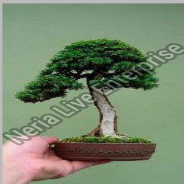
Yew Bonsai Trees