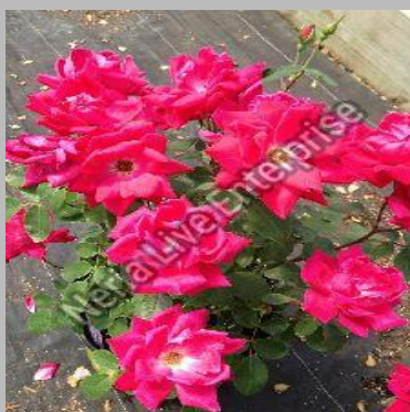
Thornless Rose Plant