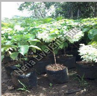
White Mussaenda Plant