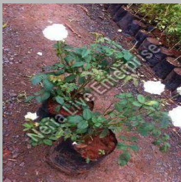
White Rose Plant