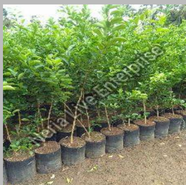
Orange Grafted Plant