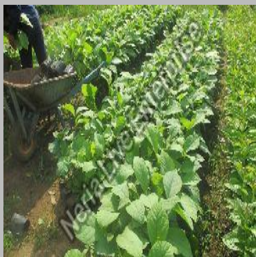
Tissue Culture Teak Plants