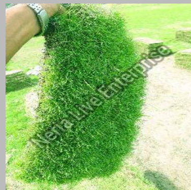
Mexican Carpet Grass