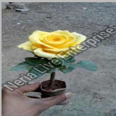
Yellow Rose Plant