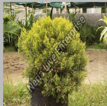
Golden Pine Tree