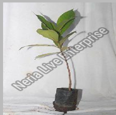
Almond Grafted Plant