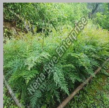
Silver Oak Plant