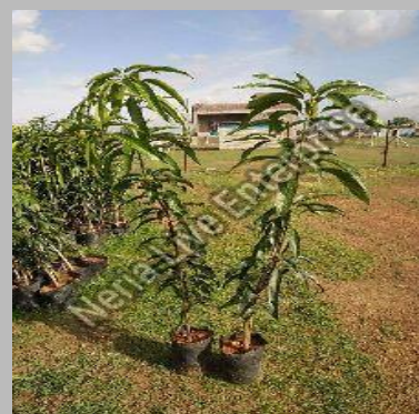
Mango Malda Grafted Plant