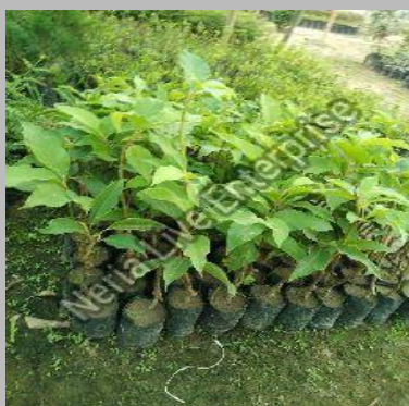
Magnolia Champaca Plant