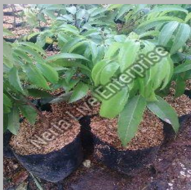
Litchi Seedless Plant