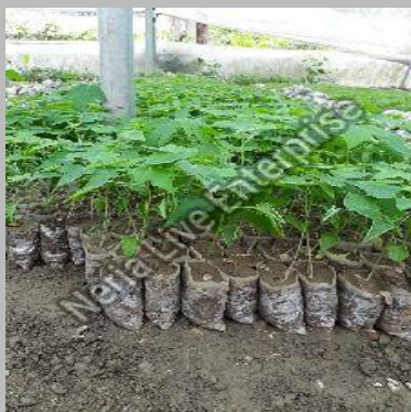
Red Lady Papaya Plant