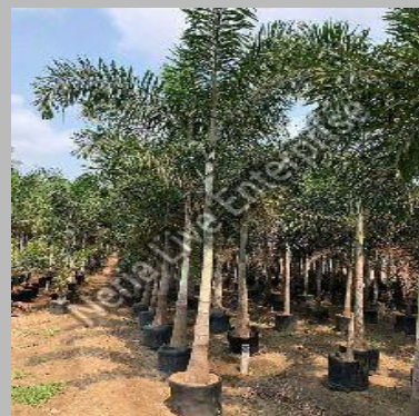
Fox Tails Palm Tree