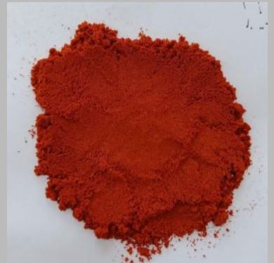
Red Chilli Powder