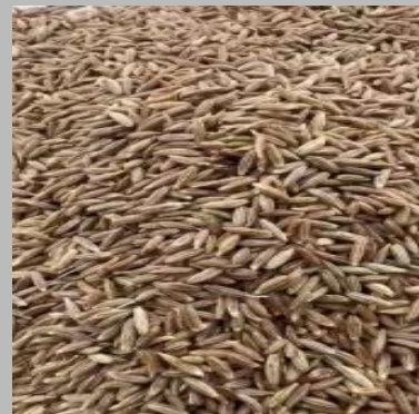
Cumin Seed Jeera