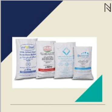
PP Woven Sugar Bag