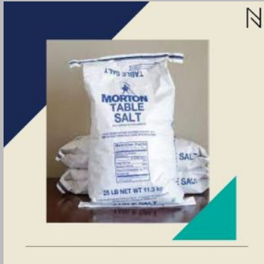
PP Woven Salt Bag