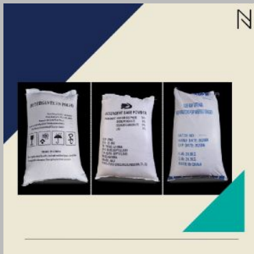
PP Woven Detergent Bag