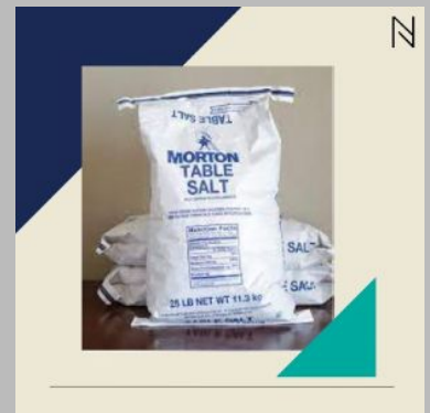
PP Woven Salt Bag