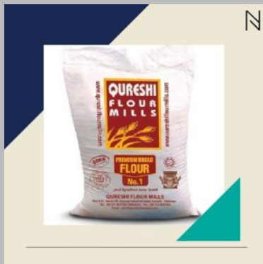
PP Woven Flour Bag