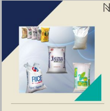
Flexo Printed PP Woven Bag