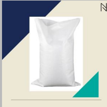
Plain PP Woven Bag