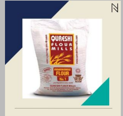
PP Woven Flour Bag