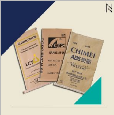
pp laminated kraft paper bag

Nico Flex Pvt. Ltd. is known as top Manufacturer, Exporter and Supplier of best Agricultural Bags, Bulk Bags & Sacks, Food Bags, Laminated Bag and Woven Bags.