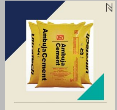
PP Woven Cement Bag