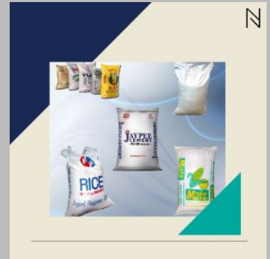
Flexo Printed PP Woven Bag