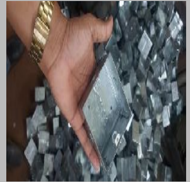
metal junction box