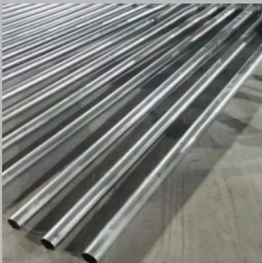
SS Street Light Pole