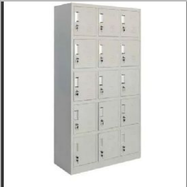
Mild Steel Storage Locker