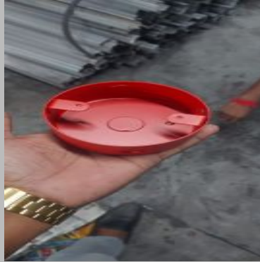
mild steel box