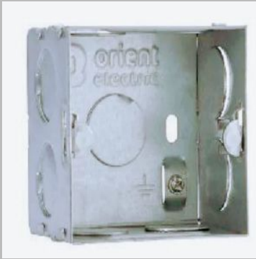
modular electrical box