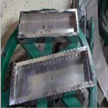
Army star car box