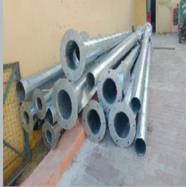
street light pole