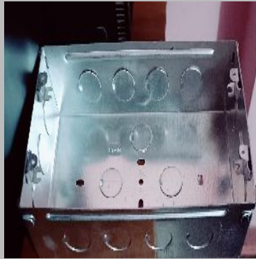
gi modular box