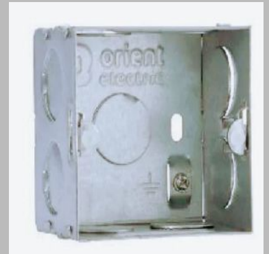
modular electrical box