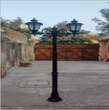
Cast Iron Garden Light Pole