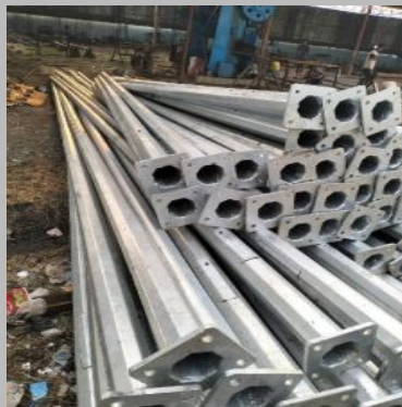
solar street light pole