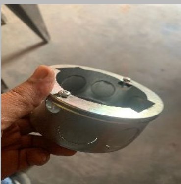
concealed metal boxes