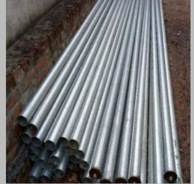
steel tubular poles