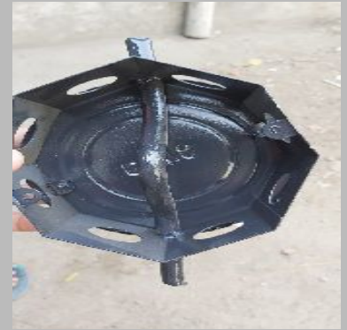
electric fan box