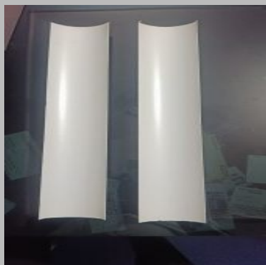
Powder Coated Aluminium Coving

Om Enterprises is known as top Manufacturer, Exporter, Supplier and Trader of best Clean Room Equipment, Corner Guard, Hardware Fittings and Accessories, Metal Angle and Powder Coating Services.