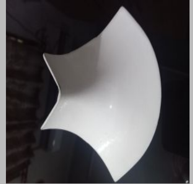
Aluminium 2D Corner