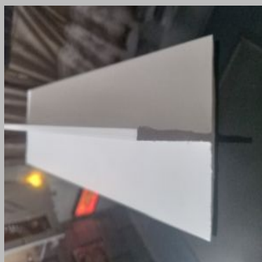
Aluminium T Shape Angle