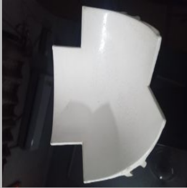
Aluminium 3D Corner