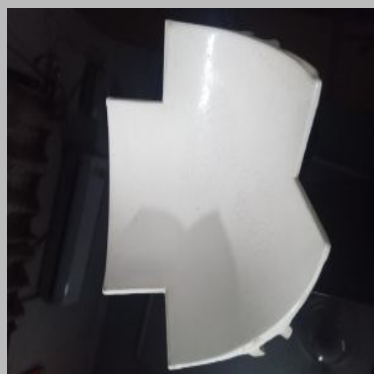
Aluminium 3D Corner