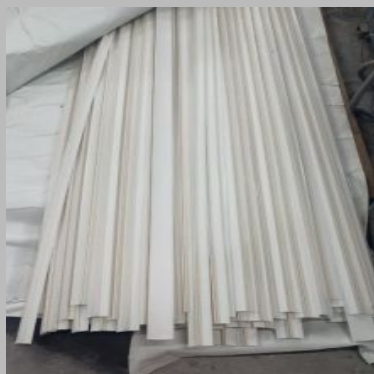
Soft Edge PVC Coving