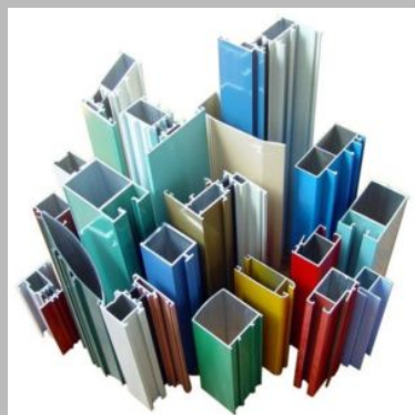
Powder Coated Aluminium Section