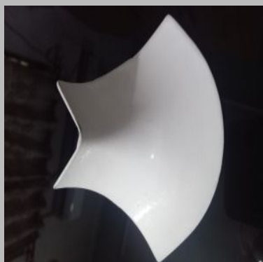
Aluminium 2D Corner