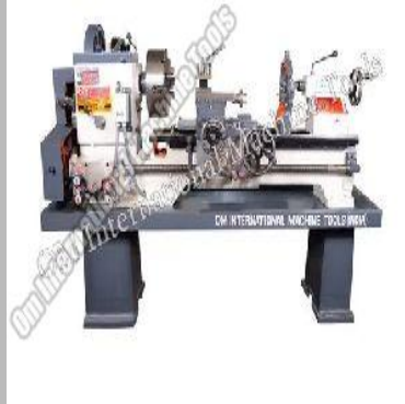
Light Duty Lathe Machine