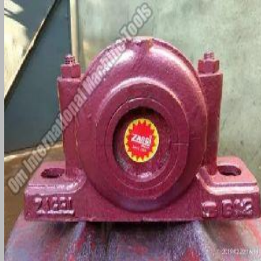
S - 600 Series Plummer Block