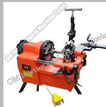
Landis & Pipe Threading Machine