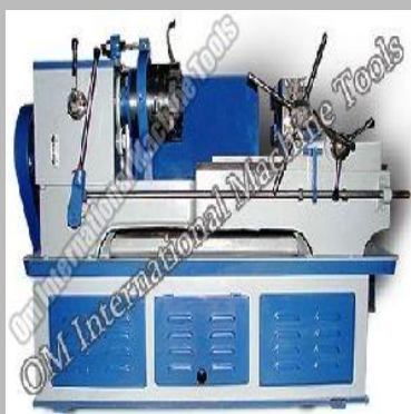
Bolt Threading Machine