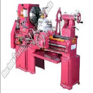
Medium Duty Conventional Lathe Machine