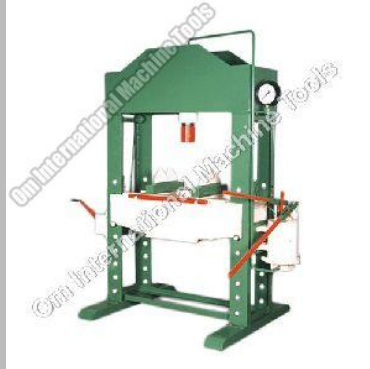
Hand Operated Hydraulic Press Machine