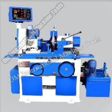
Hydraulic Cylindrical Grinding Machine