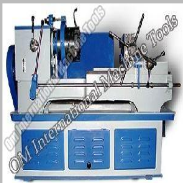
Scaffolding Pipe Threading Machine