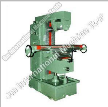
horizontal universal milling machine