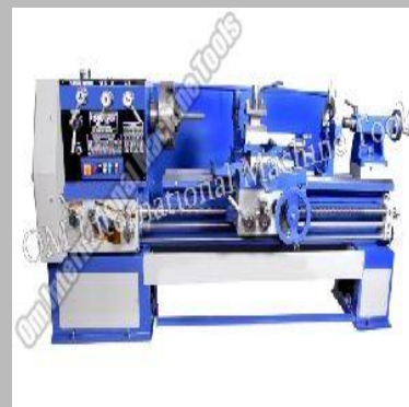
All Gear Head Lathe Machine 9 Feet