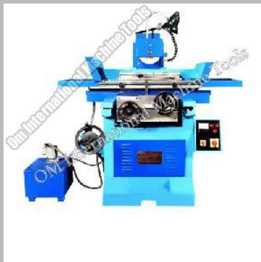
Heavy Duty 12 X 24 Surface Grinding Machine