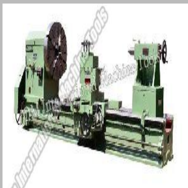
Heavy Duty Roller Grooving Lathe Machine