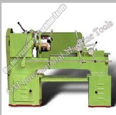
Lanco Threading Machine