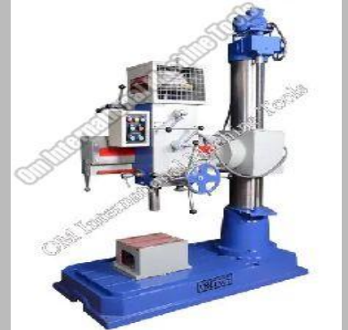
Auto Feed & Auto Lift Heavy Duty Radial Drilling Machine