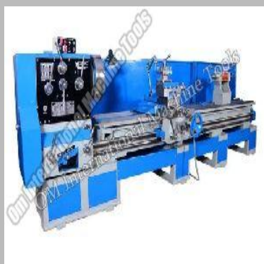
All Gear Head Lathe Machine