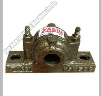
NSK - 506 Series Plummer Block