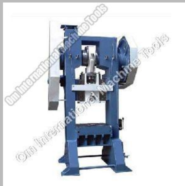
H Type Power Press Machine