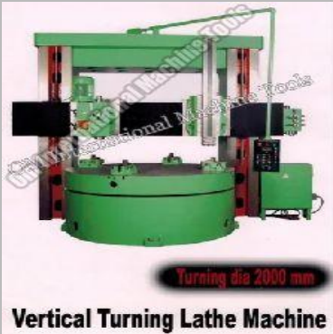
Vertical Turning Lathe Machine