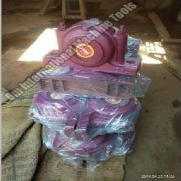
S Series - S 522 Plummer Block