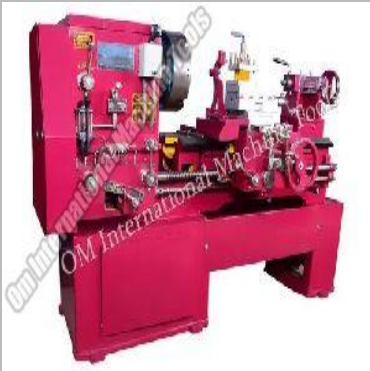
6 Feet Export Model Heavy Duty Lathe Machine