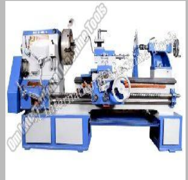
8 Feet Automatic Heavy Duty Lathe Machine