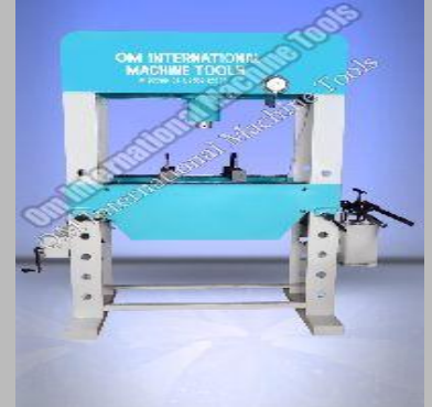
Hand Operated Hydraulic Press 60 Ton