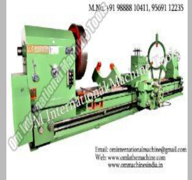
Heavy Duty Roll Grooving Lathe Machine 24 Feet