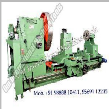
Gear Head Big Center Lathe Machine 20 Feet