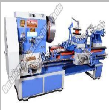
9 Feet Heavy Duty Cone Pulley Belt Driven Lathe Machine