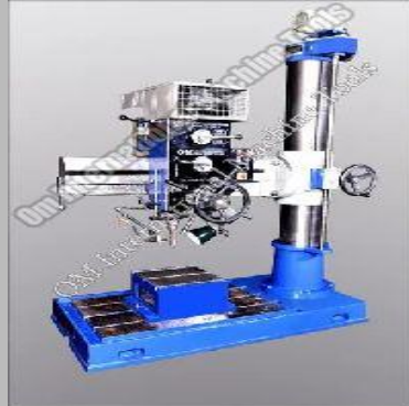
Semi Automatic Radial Drilling Machine