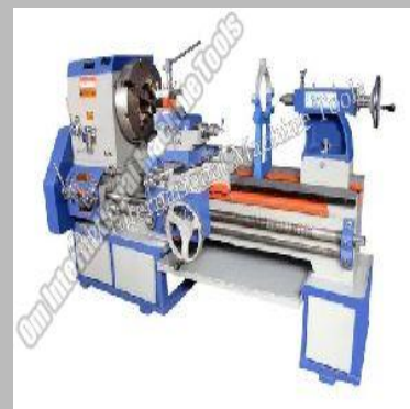
8 Feet Big Bore Heavy Duty Lathe Machine