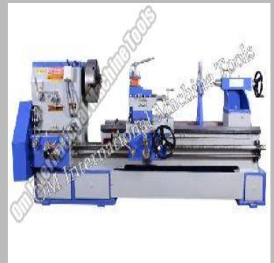
10 Feet Heavy Duty Lathe Machine