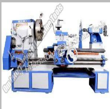
8 Feet Automatic Heavy Duty Lathe Machine