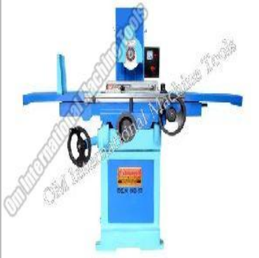
Surface Grinding Machine