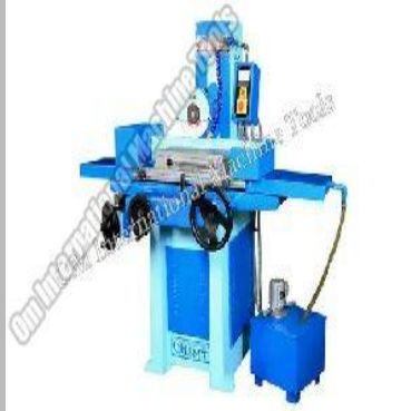
Microfeed Type Surface Grinder Machine