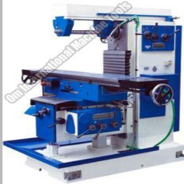
Universal Milling Machine