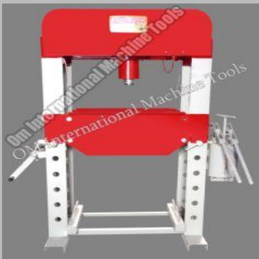
Hand Operated Hydraulic Press 40 Ton