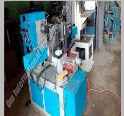
Hydraulic Pipe Knurling Machine