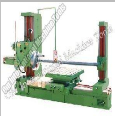
Horizontal Boring Machine