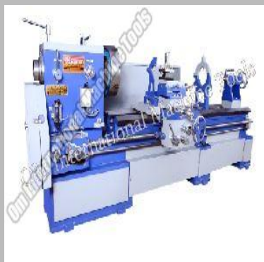
Semi Gear Head Lathe Machine