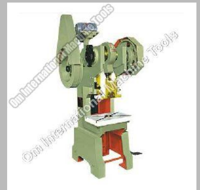
c type power press machine