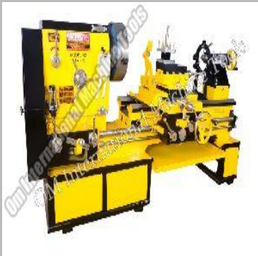
Heavy Duty Lathe Machine 8 Feet