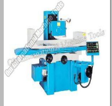
Hydraulic Surface Grinding Machine