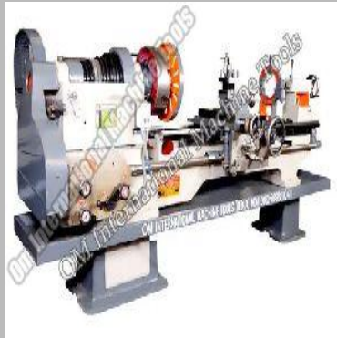
9 Feet Cone Pulley Belt Driven Lathe Machine