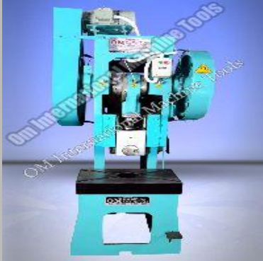
Power Press 30 Ton