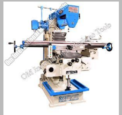
All Geared Universal Milling Machine