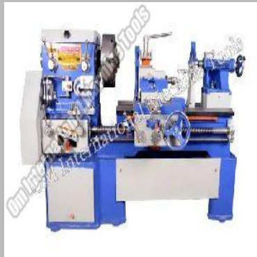
Center Conventional Lathe Machine