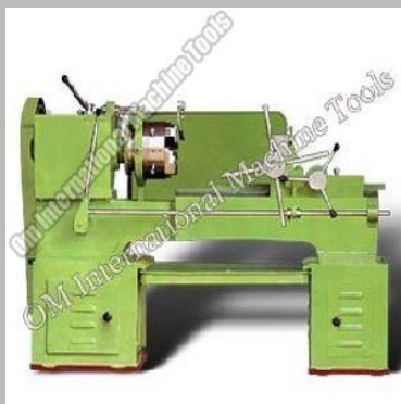
Rod & Bar Threading Machine