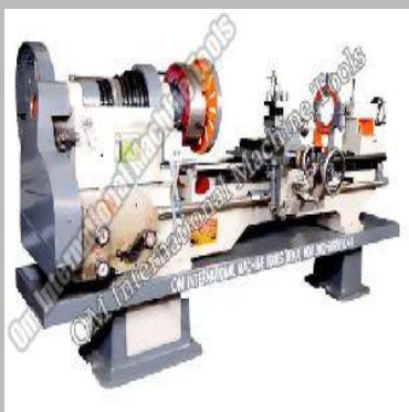
9 Feet Cone Pulley Belt Driven Lathe Machine