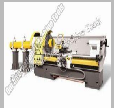
Heavy Duty 500mm Oil Country Lathe Machine