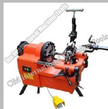
Bolt & Pipe Threading Machine