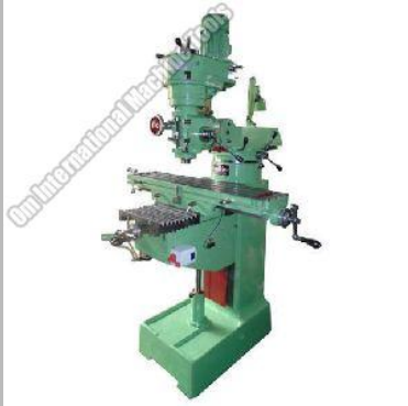
vertical milling machine