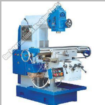
All Geared Vertical Milling Machine