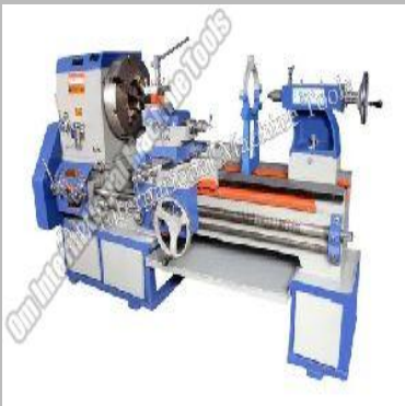
8 Feet Big Bore Heavy Duty Lathe Machine