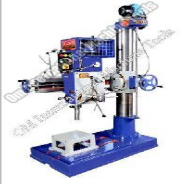
Single Column Radial Drilling Machine