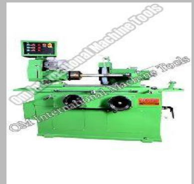
Cylindrical Grinding Machine