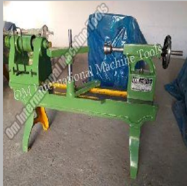
Spinning Lathe Machine