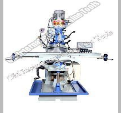
M1TR Vertical RAM Turret Milling Machine