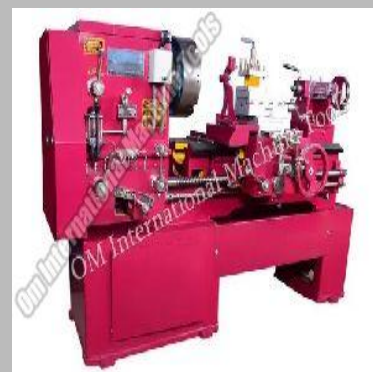
6 Feet Export Model Heavy Duty Lathe Machine