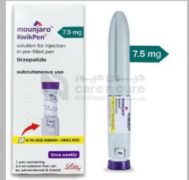
Mounjaro Injection 7.5mg