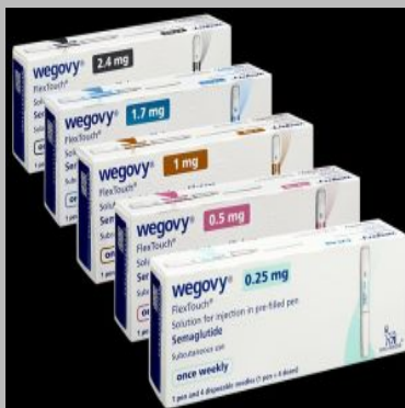
Wegovy Semaglutide 4 Prefilled Injections