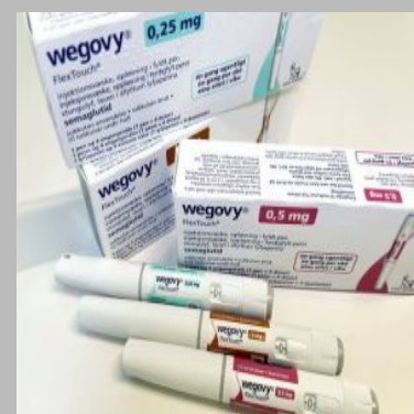
Wegovy Injection 0.5 Mg