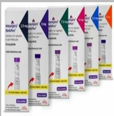
Mounjaro 10mg Injection