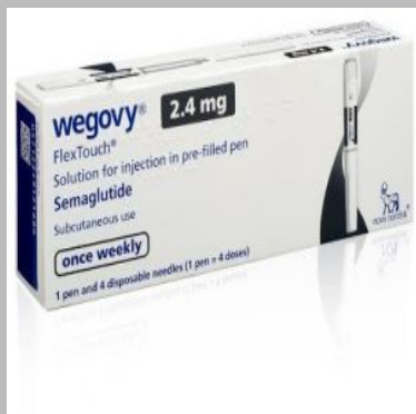
Ozempic Injection 2 Mg