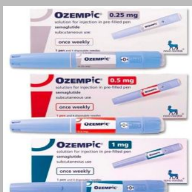
Ozempic Injection 0.5 Mg