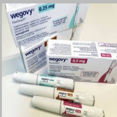
Wegovy Injection 1 Mg