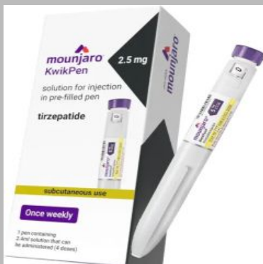
Mounjaro Injection 2.5 Mg