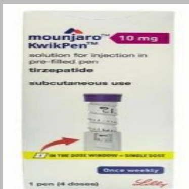
Mounjaro Tirzepatide Injections