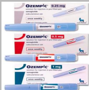
Ozempic Injection 1mg