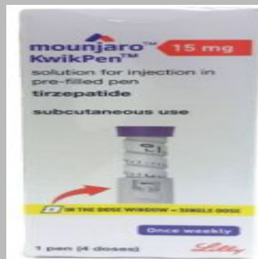
Mounjaro Injection 15 Mg