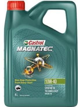
castrol magnatec 10w40 4 ltr engine oil