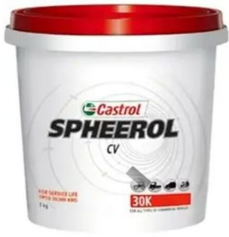
Castrol Spherol CV 30K Grease