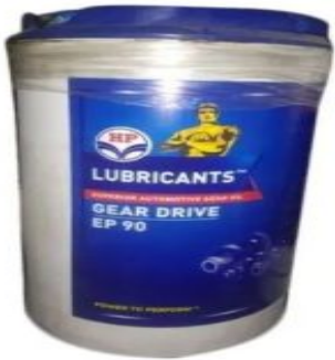
HP EP 90 Lubricant Gear Oil