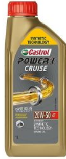
CASTROL POWER1 CRUISE