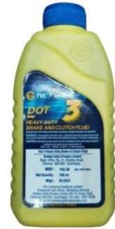
TVS Dot 3 Heavy Duty Brake Clutch Fluid