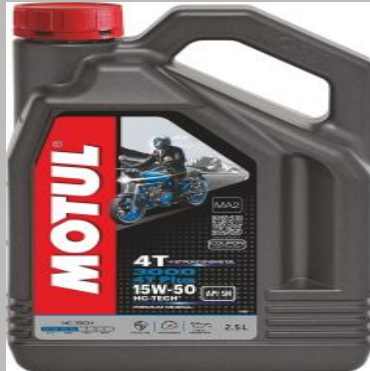
MOTUL 3000 4T 15W50 - 2.5 LTR