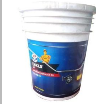
HP Enklo 68 Hydraulic Oil