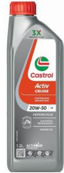
castrol activ cruise 20w50 engine oil