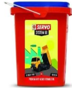
Servo System 68 Hydraulic Oil