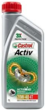
Castrol Activ 20W40 4T Bike Engine Oil

P. K. Enterprises is known as top Supplier, Retailer and Trader of best Automotive Oil, Cutting Oil, Engine Oils, Gear Oils and Gulf Industrial Lubricants.