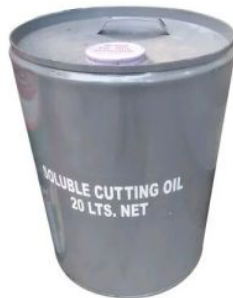
Soluble Cutting Oil