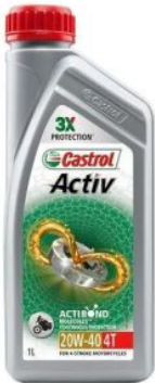
Castrol Activ 20W40 4T Bike Engine Oil