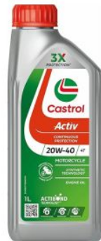
ACTIV 20W40 - 1 LTR