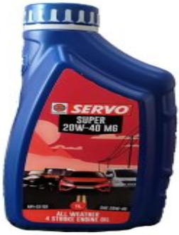
servo super 20w40 1 ltr engine oil