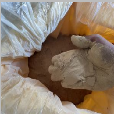
Seedless Amla Powder