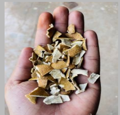
Dry Orange Peel