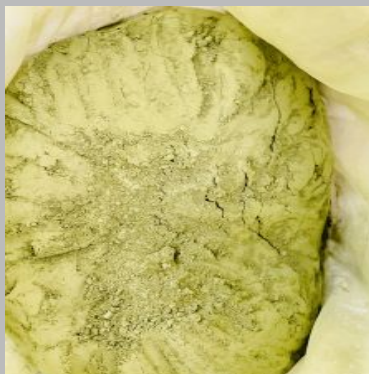
Natural Henna Powder