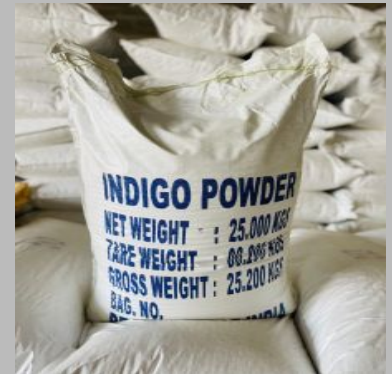
Indigo Leaf Powder