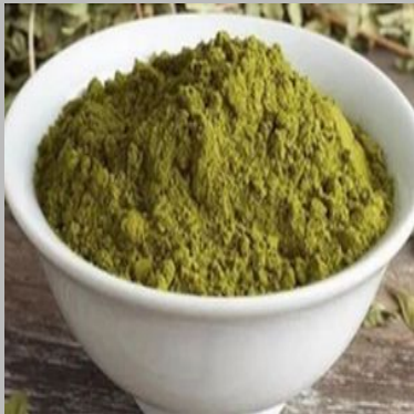
Organic Rajasthani Henna Powder

We Tamanna Industries are a leading and distinguished Exporter, Supplier and Manufacturer of quality Amla, Edible Nuts, Hair Care Products, HENNA PRODUCT and Herb Leaves.