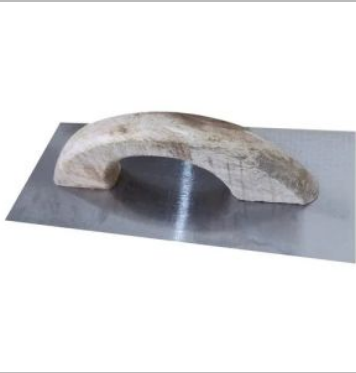
Wooden Handle Gurmala