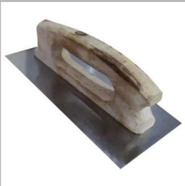
High Speed Steel Putty Plastering Gurmala