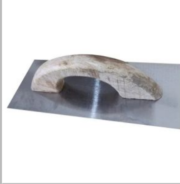
Wooden Handle Gurmala