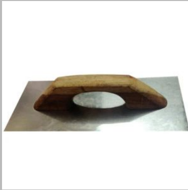
High Speed Steel Plaster Gurmala