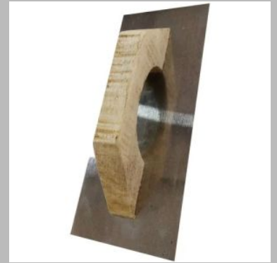
High Speed Steel Gurmala