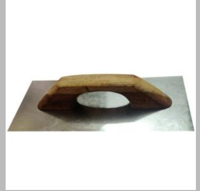
High Speed Steel Plaster Gurmala