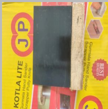
Black Wooden Handle Scraper