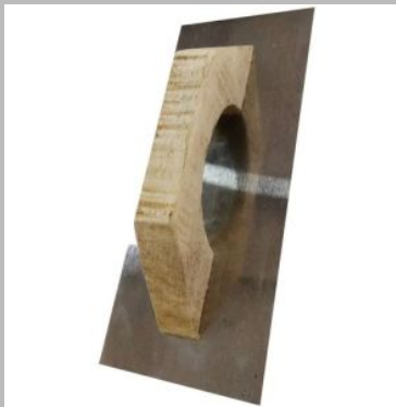
High Speed Steel Gurmala