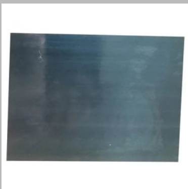
High Speed Steel Putty Blade