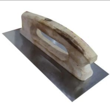
PVC Plastering Trowel