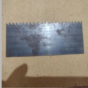
Pressure Feed Pop Teeth High Speed Steel