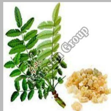
Boswellia Serrata Extract