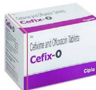
Cefix-O Cefixime and Ofloxacin tablets