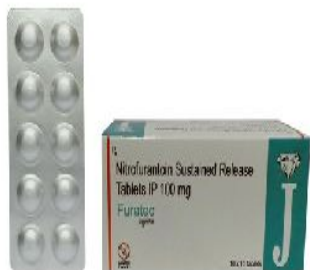
Jantec Nitrofurantoin 100 MG