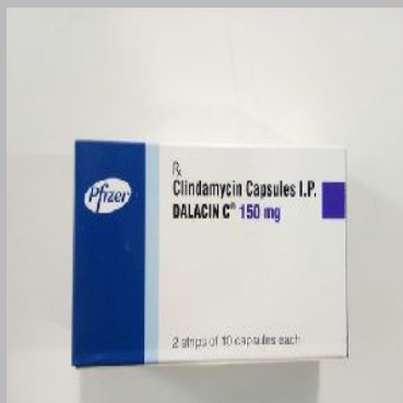
Dalacin C 150 mg: Clindamycin Capsule I.P