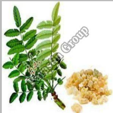
Boswellia Serrata Extract