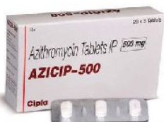
AZICIP-500 :Azithromycin tablet IP 500 mg