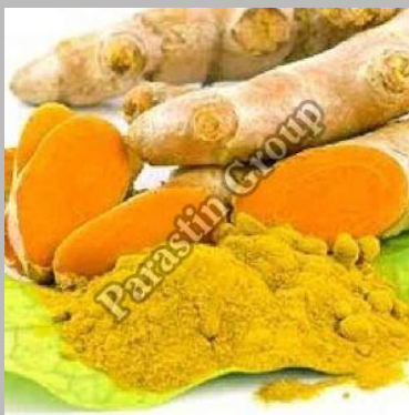
Curcuma Longa Extract