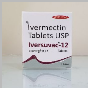
IVERMECTIN TABLETS 12 MG USP