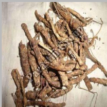
Picrorhiza Kurroa Extract