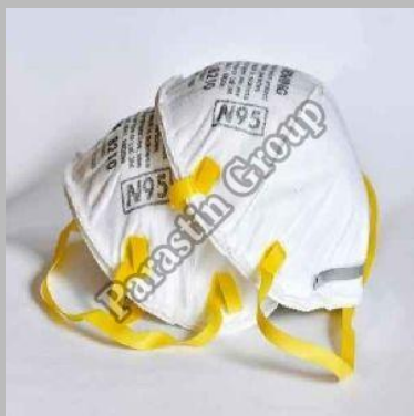
N95 Face Mask