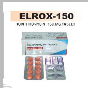
Elrox-150: Roxithromycin 150 MG tablets IP