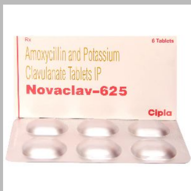
NOVACLAV-625: AMOXYCILLIN AND POTASSIUM CLAVULANATE TABLETS IP