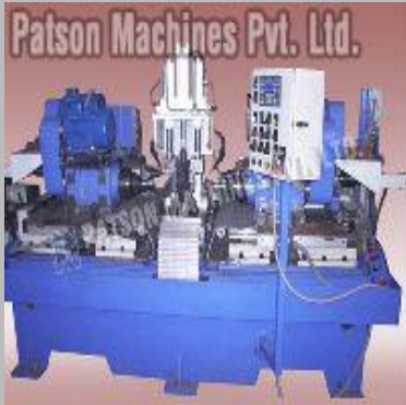
Fine Boring Machine