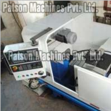
Special Purpose CNC Machine (974)