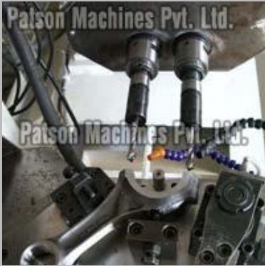
Special Purpose Tapping Machine (477)