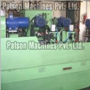
Special Purpose Boring Machine