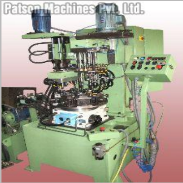
Special Purpose Rotary Indexing Type Drilling and Tapping Machine