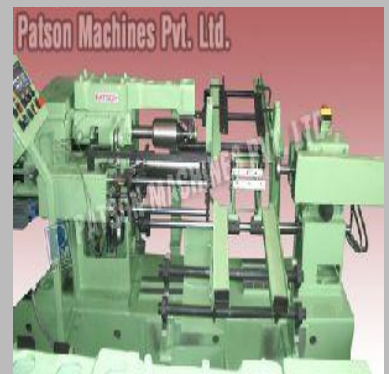
Case Trimming SPM OFAJ