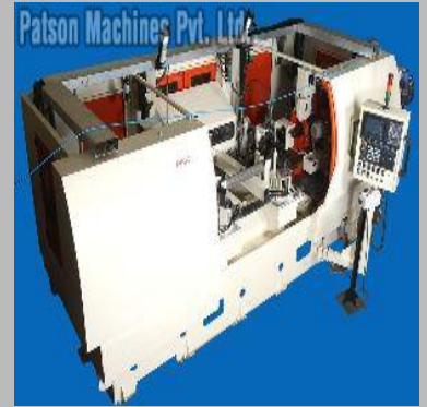
Special Purpose CNC Milling and Deburring Machine for RTB