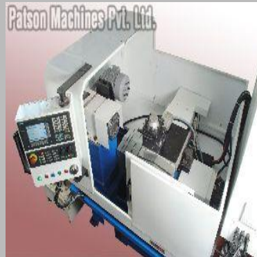
Special Purpose CNC Boring and Teeth Chamfering Machine for Sprockets