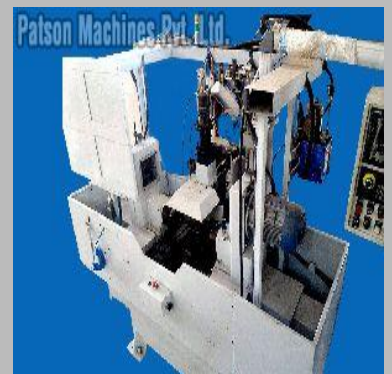
Special Purpose Facing and Centering Machine for Crankshaft