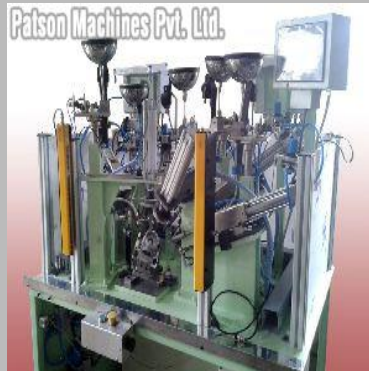
Ball Pressing Machine For Carburetor