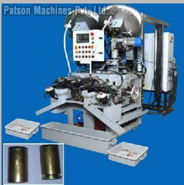
Grooving Machines for Cartridge Case