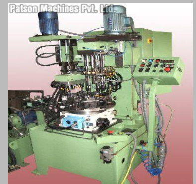
Rotary Indexing Machine (802)