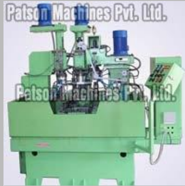
Special Purpose Rotary Indexing Machine (961)