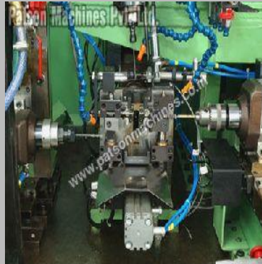
Multi Operation Carburetor Machining Machines