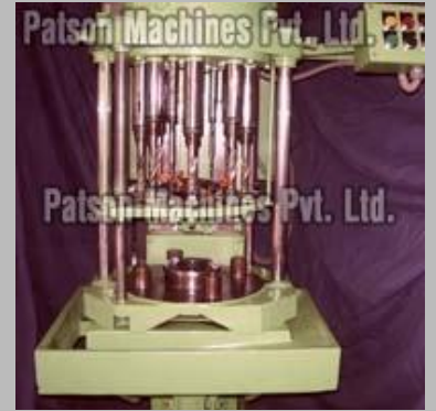
Special Purpose Drilling Machine (MSD-400)