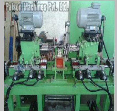
Two Way Drilling SPM For Home Appliances Component