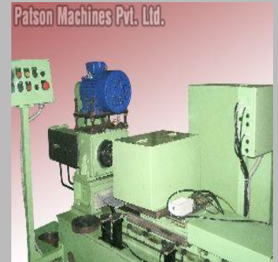
Special Purpose Brake Drum Grooving and Chamfering Machine