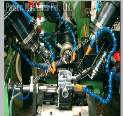
Industrial Carburetor Machining Machines