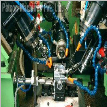
Special Purpose Drilling Machine For Carburetor