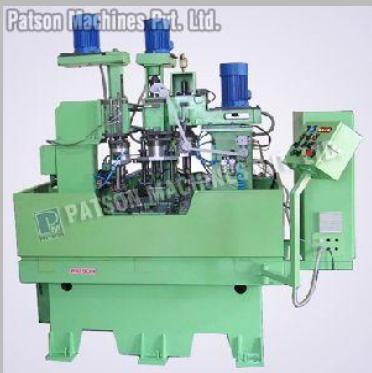
Rotary Indexing Drill, Reaming and Tapping SPM