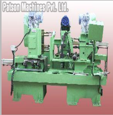
Way Type Drilling Machine (888)