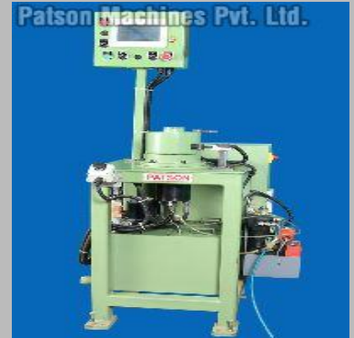
High Speed Spinning Machine