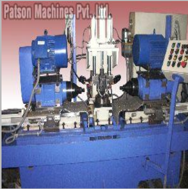
Special Purpose Yoke U Drilling Machine