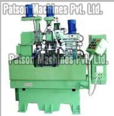
Rotary Index Machine