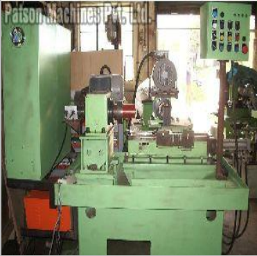
Special Purpose Sprocket OD Radius Milling Machine