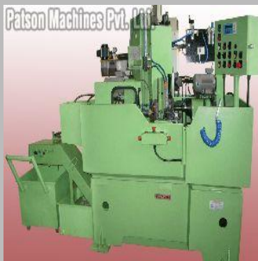
Special Purpose Drilling, Milling and Broaching Machine