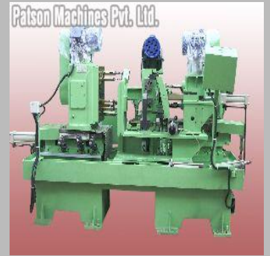
3 Way Special Purpose Drilling Machine