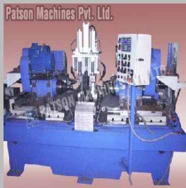
Horizontal Fine Boring Machines