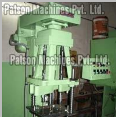
Special Purpose Drilling Machine (484)