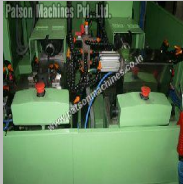
Precision Boring SPM