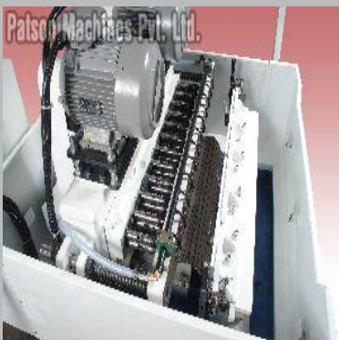
Special Purpose Drilling Machine (958)