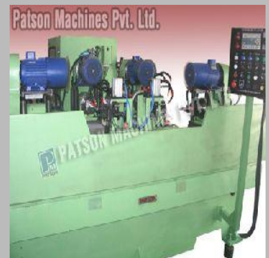
Fine Boring SPM Machines