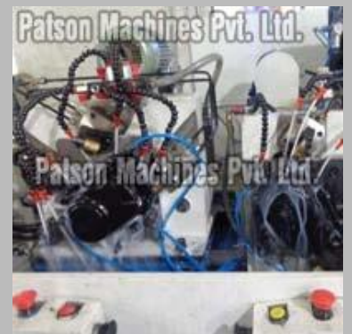
Special Purpose Drilling and Tapping Machine (965)