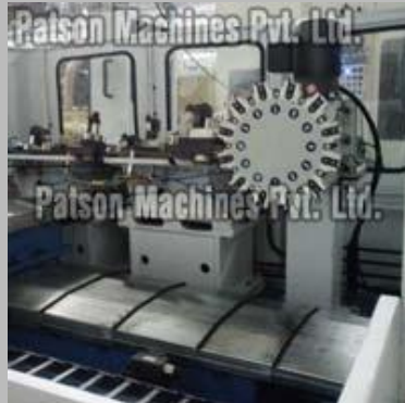
Special Purpose CNC Machine (948)