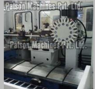
Special Purpose CNC Machine (948)