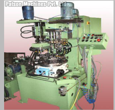
Rotary Indexing Machine (802)