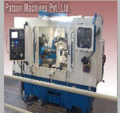
Special Purpose CNC Machine (914)