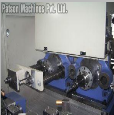
Special Purpose Servo Controlled Deep Drilling Machine