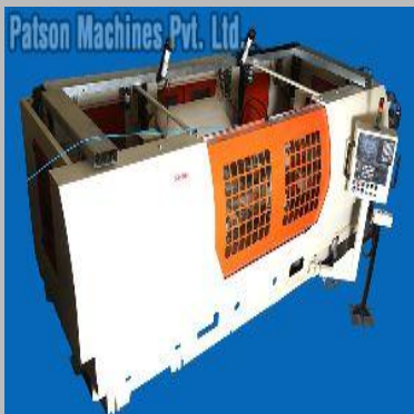
CNC Milling and Deburring Machine