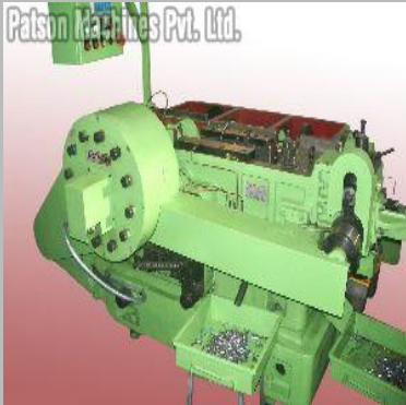
Lead Swaging Machines