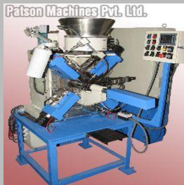
Special Purpose Servo Controlled 5 Axis Microdrilling Machine