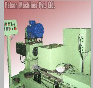
Special Purpose Turning Machine (858)