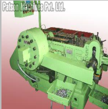
Lead slug Swaging Machines