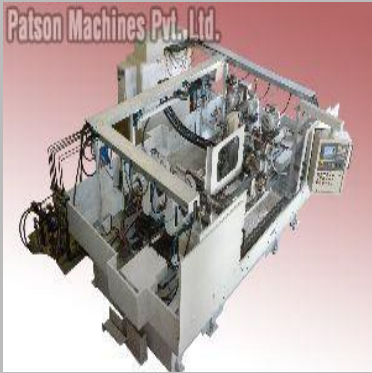
Special Purpose Drilling & Tapping Machine (977)