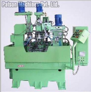
Special Purpose Rotary Indexing Type Drill, Reaming and Tapping Machine