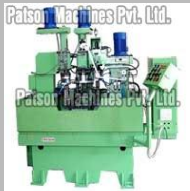
Rotary Index Machine