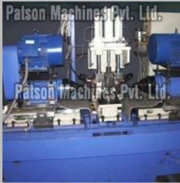
Special Purpose Drilling Machine (807)