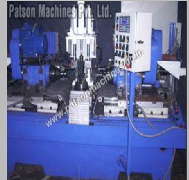
Precision Boring Machines