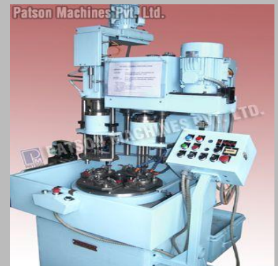
Index Type Drill Tap SPM