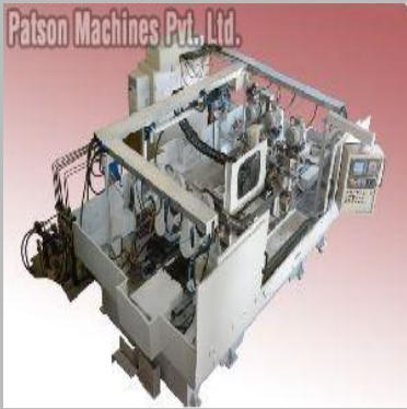
Special Purpose CNC Drill Tap Machine for RTB