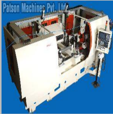
CNC Milling SPM For RTB