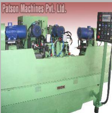
Precision Boring Machine