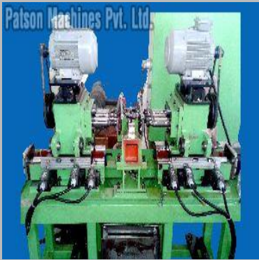
Special Purpose Two Way Drilling Machine for Home Appliances