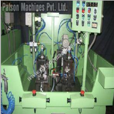
Two Station Carburetor Machining Machines