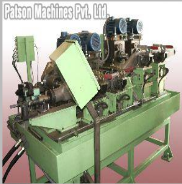
4 Spindle Special Purpose Trepanning Machine