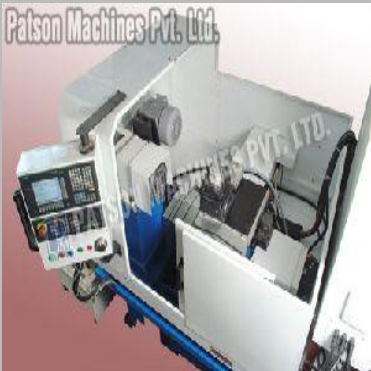
CNC Boring SPM and Teeth Chamfering SPM for Sprocket