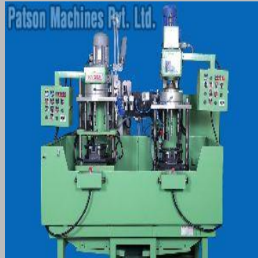
multi spindle drilling