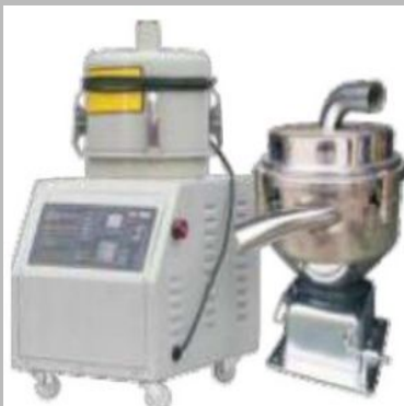
700 G Auto Vacuum Loader