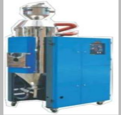
All in One Dehumidifier Dryer