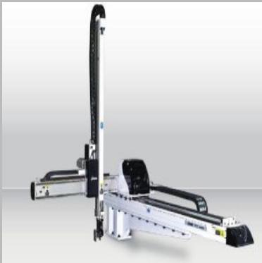
Three Axes Servo Driven Robot