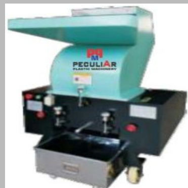
High Power Crusher