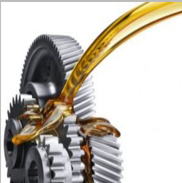
Safol Gear Oil