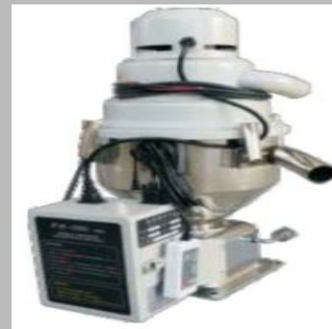
300 G Auto Vacuum Loader