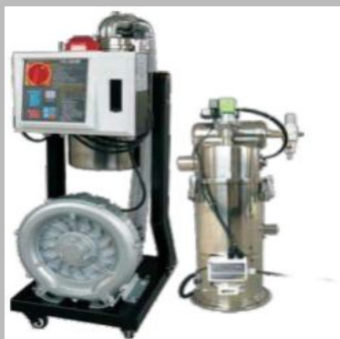
Separated Type Cleaning Free Auto Loader