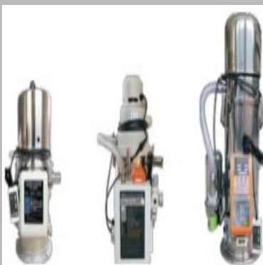
Integrated Type Cleaning Free Auto Loader