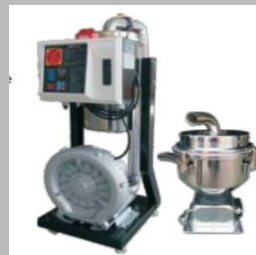
900 G Auto Vacuum Loader