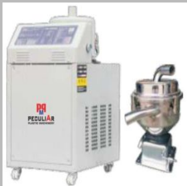
800 G Auto Vacuum Loader