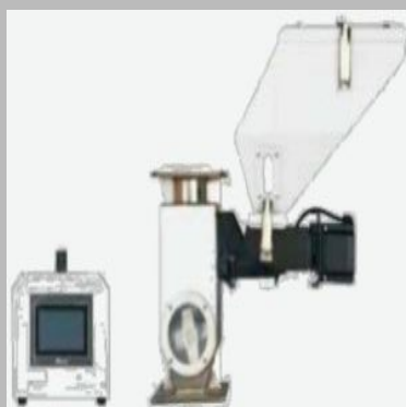
Single Color Masterbatch Mixer Volumetric Doser Machine