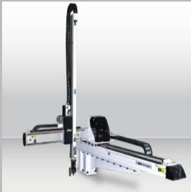
Three Axes Servo Driven Robot