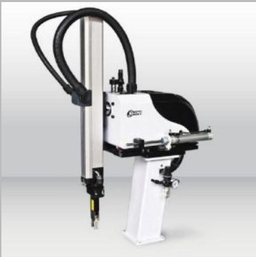
Swing Arm Robot

Peculiar Plastic Machinery is known as top Manufacturer, Exporter and Trader of best , Air Dryers, Blender, Blowers and Clamps.