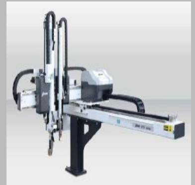
Five Axes Servo Driven Robot