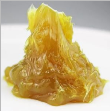
Safol Food Grade Grease