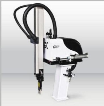
Swing Arm Robot