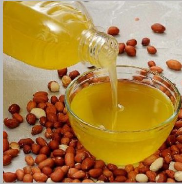
Cold Pressed Peanut Oil