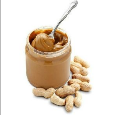
Regular Peanut Butter