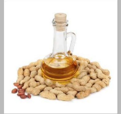
Peanut Virgin Oil