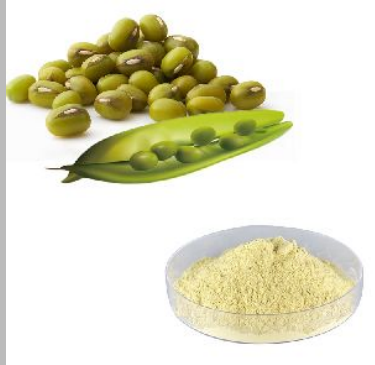
Mung Bean Protein Isolate