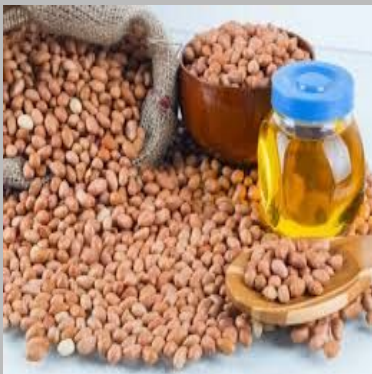
Peanut Extra Virgin Oil