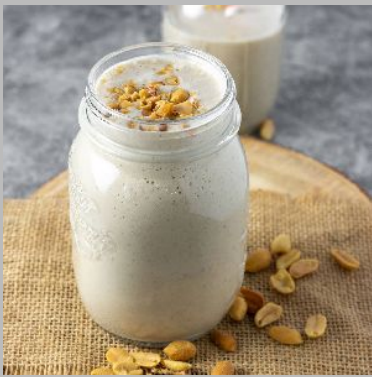
Peanut Flavored Milk