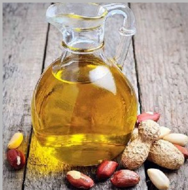
Organic Peanut Virgin Oil