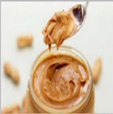
Flavoured Peanut Butter