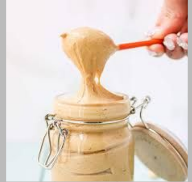
Low Fat Peanut Butter