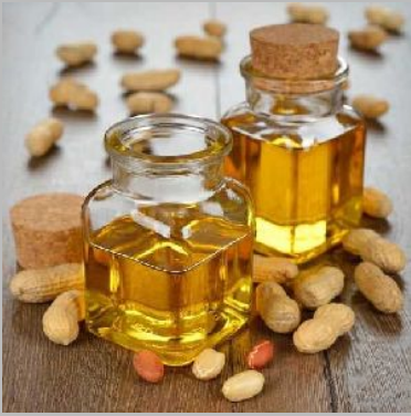
cold pressed groundnut oil

We Plant Aliments Private Limited are a leading and distinguished Manufacturer, Exporter and Supplier of quality Birthday Cakes, Confectionery Ingredients, Dairy Products, Dietary Supplements & Nutraceuticals and Edible Oils.