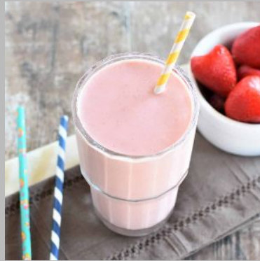
Peanut Strawberry Milk