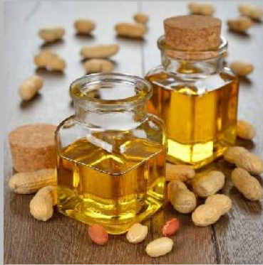
cold pressed groundnut oil