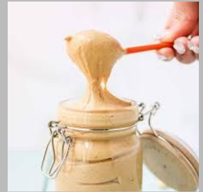
Low Fat Peanut Butter