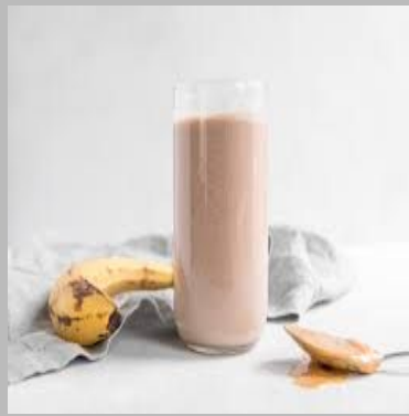
Peanut Cocoa Milk