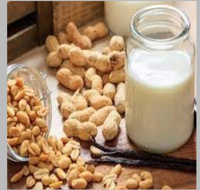
Peanut Plain Milk