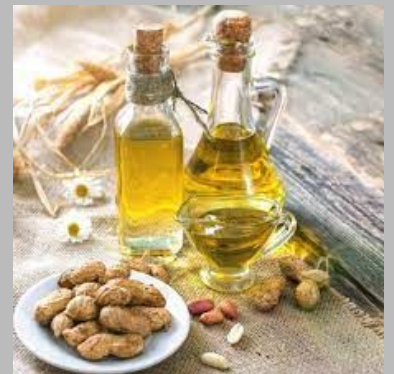
Organic Peanut Extra Virgin Oil