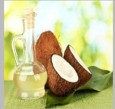
Coconut Virgin Oil