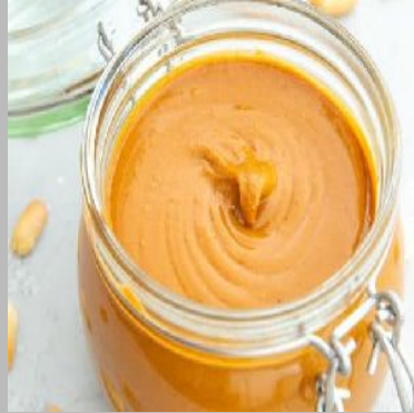
Mix Fruit Flavored Peanut Butter