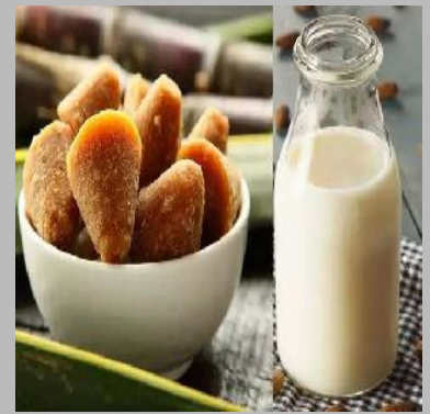
Jaggery Based Peanut Milk