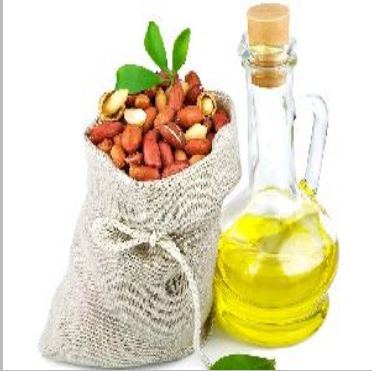
Virgin Peanut Oil