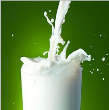
Plant Based Carbonated Milk