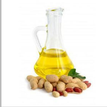
virgin groundnut oil