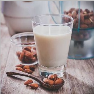
Peanut Almond Milk