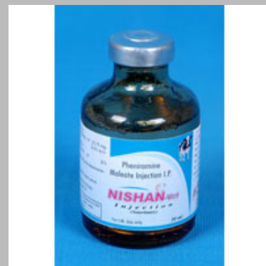
Pheniramine Maleate Injection