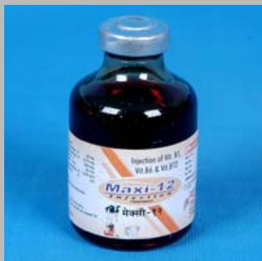
Vitamin B1 B6 B12 Injection