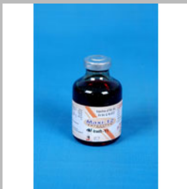
Vitamin B1 Injection