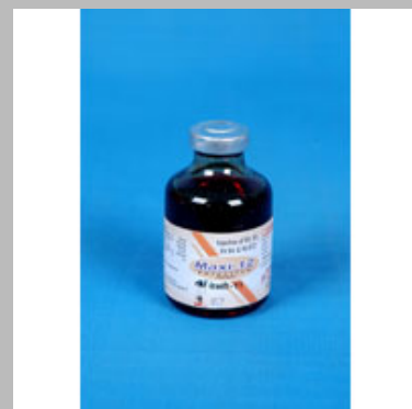
Vitamin B1 Injection