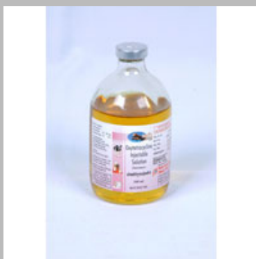
Oxytetracycline Injectable Solution