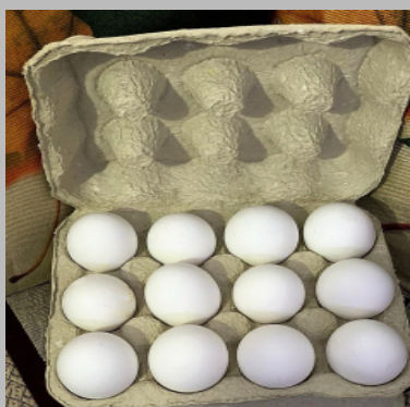
White Paper 12 Piece Egg Tray with Lock