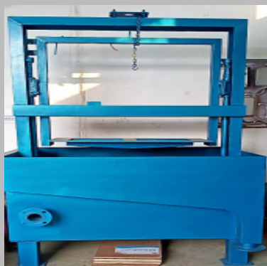
ET1 2 Mould Egg Tray Machine

PRABH GLOBAL is known as top Manufacturer, Exporter, Supplier, Trader and Service Provider of best Cargo & Shipping Services, Container Handling Services, Dinnerware, Tableware and Serving Utensils, Disposable Tray and Egg Tray.