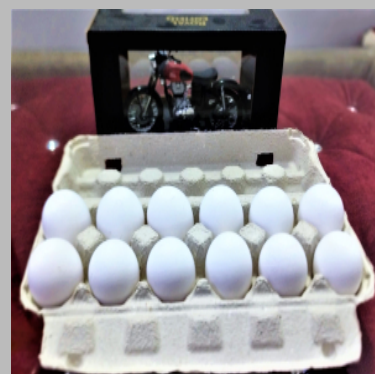
Hot Pressed Egg Paper 12 Piece Tray