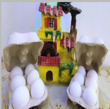
White Paper 6 Piece Egg Tray With Lock