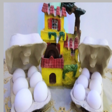
White Paper 6 Piece Egg Tray With Lock