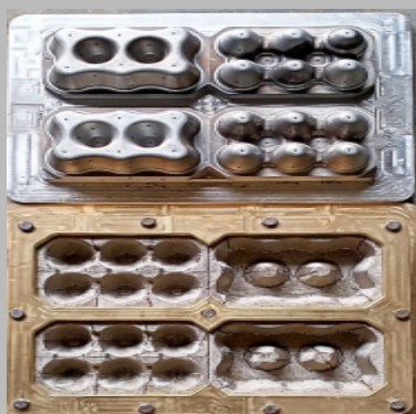
12 Egg Tray Mould