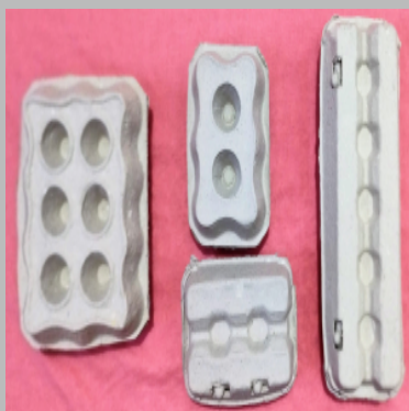
White Paper 6 Piece Egg Tray