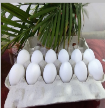
White Paper 12 Piece Egg Tray