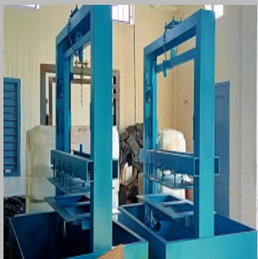
ET1 3 Mould Egg Tray Machine