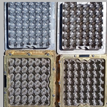
30 Egg Tray Mould