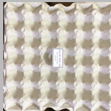
White Paper 30 Piece Egg Tray