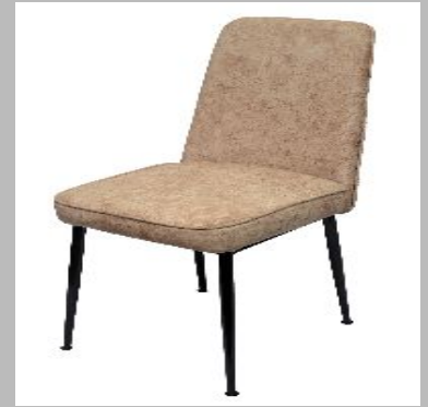
NEW DINNING 02