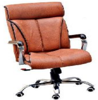
C-12 HB Corporate Chair