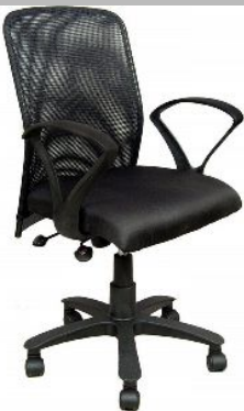
MESH-10 SIGMA SUNAMI HDL