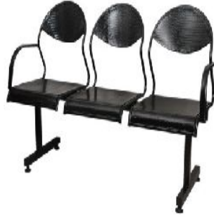
3 Seater Waiting Chair