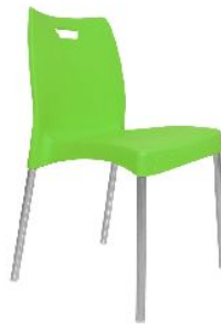
FIBER CAFE CHAIR