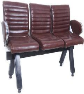
Cushion Waiting Chair