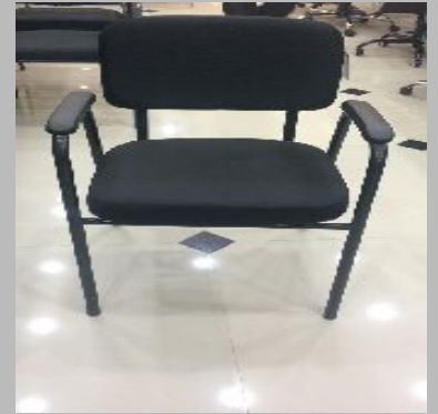
REGENCY V-4 HDL