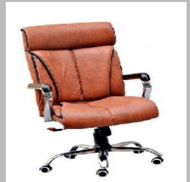
C-12 HB Corporate Chair