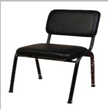
REGENCY V-4 W/H