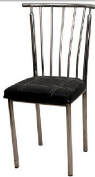
Designer Dining Chair