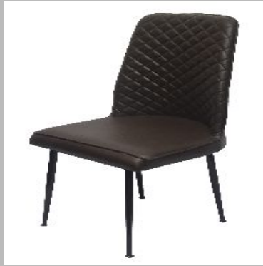
NEW DINNING 03