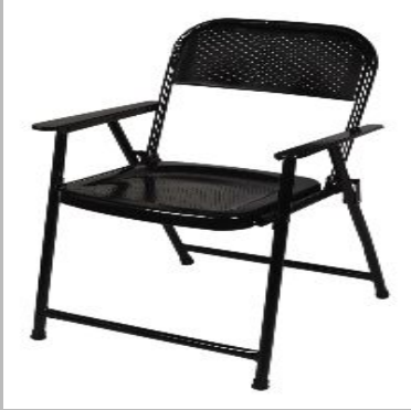
PF-02 Iron Chair