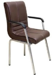
MEXON AIR HANDLE