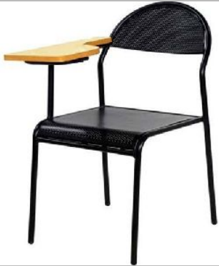
ONE SIDE HANDLE