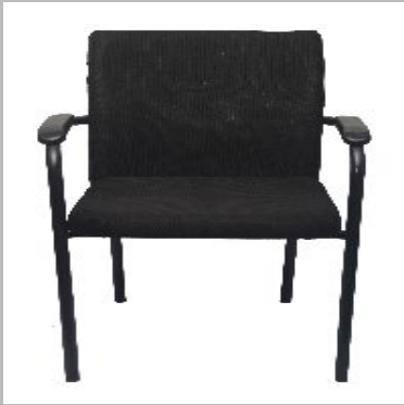
V-11 ROUND HDL