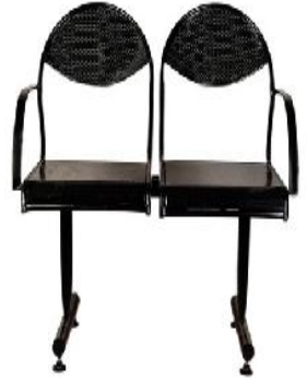
2 Seater Waiting Chair