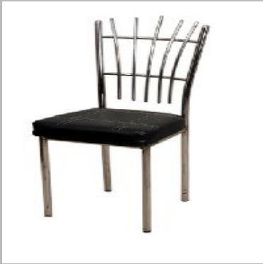
Fancy Dining Chair