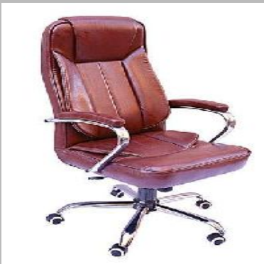
C-06 HB Corporate Chair