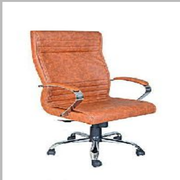
C-08 HB Corporate Chair