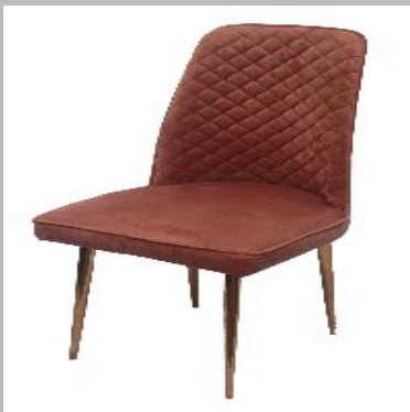
NEW DINNING 01