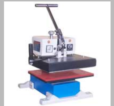
M1000 Manual Small Manual Fusing Machine