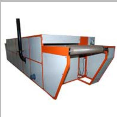
Curing Machine (PH 2005)

We Prakalya Industries are a leading and distinguished Manufacturer, Exporter, Supplier and Retailer of quality Badges, Emblems & Lanyards, Industrial Heaters, Industrial Machinery, Keychains & Bottle Openers and labels.