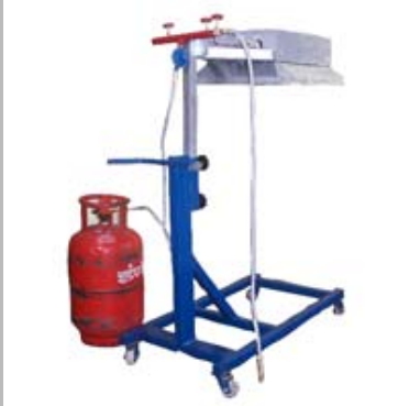
Printing Machines (Gas Heater)