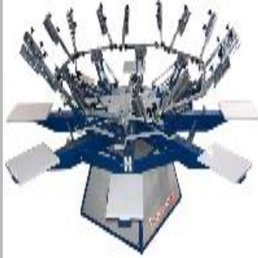
Printing Machines - (gas Heater).