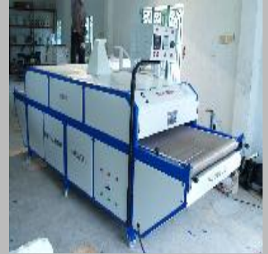
Curing Machine - (ph 2001)