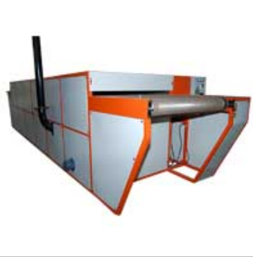
Curing Machine (PH 2005)