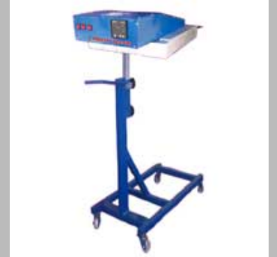
Printing Machines (Ele Heater)