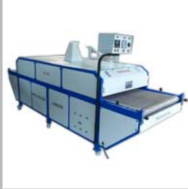
Curing Machine (PH 2001)