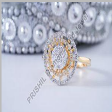
Halo Diamond Engagement Ring