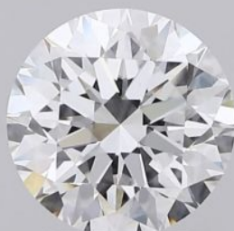
lab grown diamond