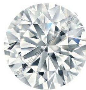
3 mm Round Shape Lab Grown Diamond