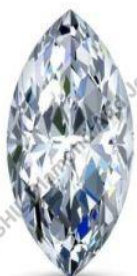
Marquise Shape Lab Grown Diamond