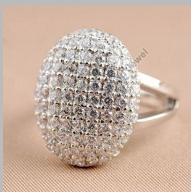
Twilight Bella Engagement Ring