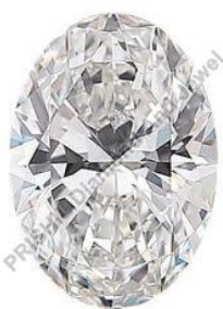
Oval Shape Lab Grown Diamond

Prishil Diamond and Jewel is known as top Exporter, Supplier, Trader, Service Provider, Manufacturer, Retailer, Distributor and Importer of best Art Schools, Cuff Bracelet, Diamond Jewellery Set, Diamond Rings and Diamond Studded Gold Jewellery.