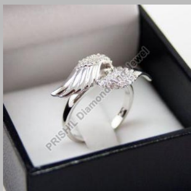
Diamond Angle Wing Rings