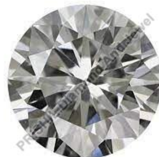
ID88 2.01 mm Round Shape Lab Grown Diamond