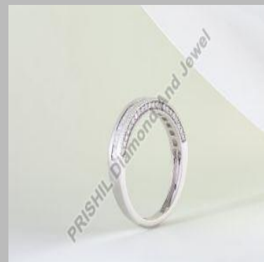
Diamond Engagement Ring