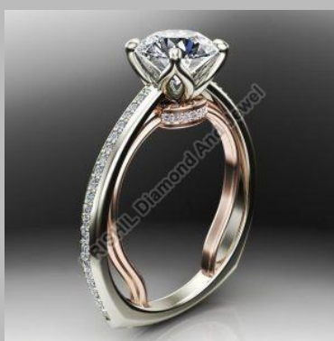
Diamond Solitaire Ring