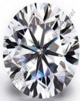
1.55 mm IF Round Shape Lab Grown Diamond