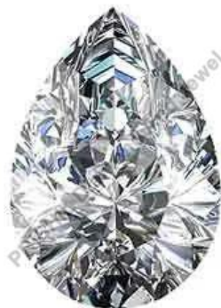
Pear Shape Lab Grown Diamond