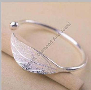
Leaf Engagement Rings