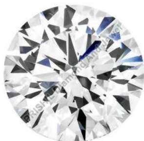
ID89 1.72 mm Round Shape Lab Grown Diamond