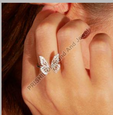
Butterfly Diamond Ring