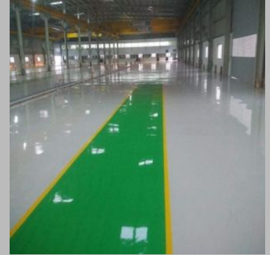
3 Mm Industrial Epoxy Flooring Services