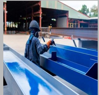
Industrial Structure Painting Services