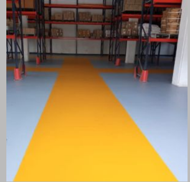
PU Concrete Flooring Services