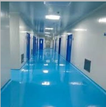
1 mm epoxy flooring services