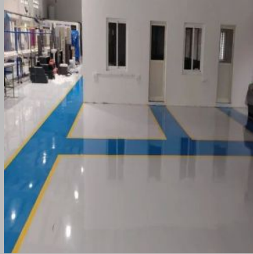
3 Mm Self Leveling Epoxy Flooring Services