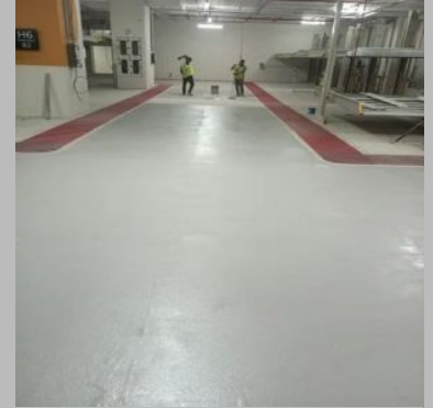
Anti Skid Epoxy Flooring Services