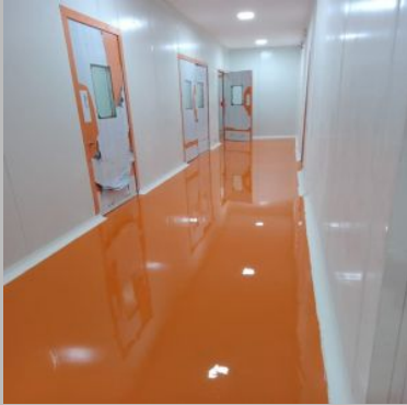
Industrial Wall Coating Services