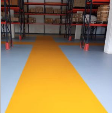
PU Concrete Flooring Services