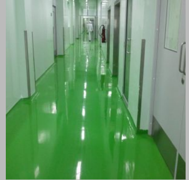
2 mm epoxy flooring services