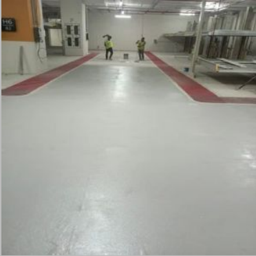
Anti Skid Epoxy Flooring Services

Pristine Solutions is known as top Manufacturer, Supplier, Retailer, Trader, Distributor and Service Provider of best Building & Real Estate Developers, Fabrication Services, Flooring Services, Interior Designing & Decoration and Metal Finishing & Coating Services.