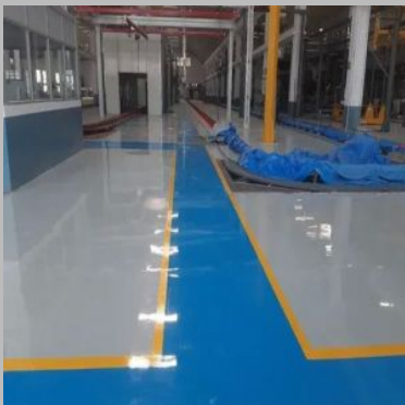
2 Mm Self Leveling Epoxy Flooring Services