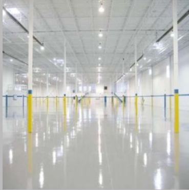
Industrial PU Coating Services