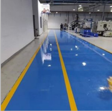
Anti Static Epoxy Flooring Services