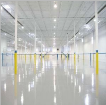
Industrial PU Coating Services