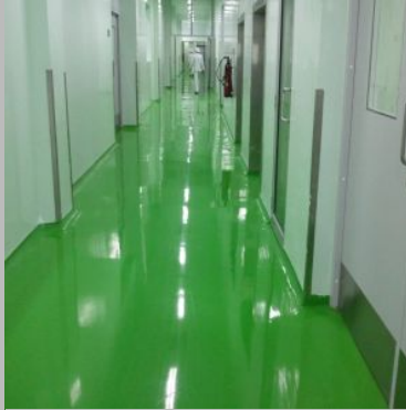
3mm epoxy flooring services