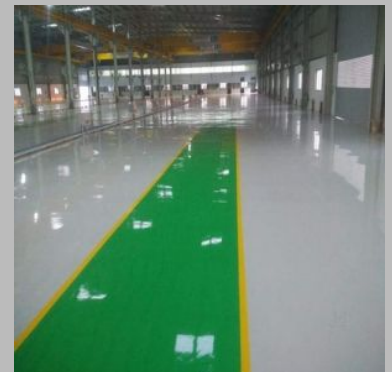
1 Mm Self Leveling Epoxy Flooring Services