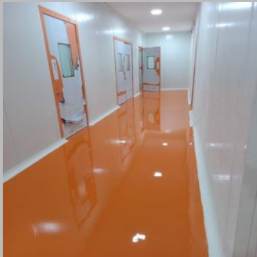
Industrial Wall Coating Services