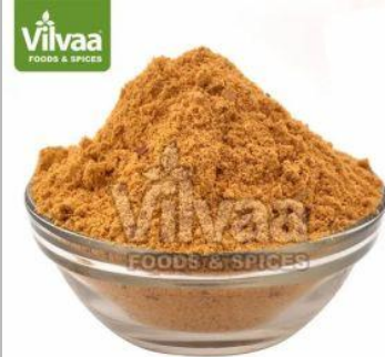
NOODLES MASALA SEASONINGS