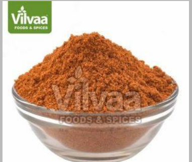
EGG CURRY MASALA