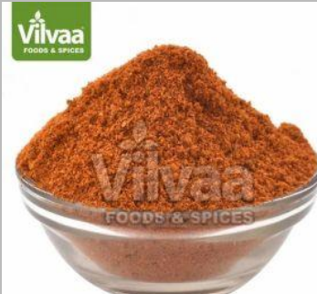
FISH & PRAWN BRIYANI MASALA