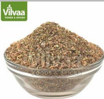
PIZZA & GARLIC BREAD SEASONING