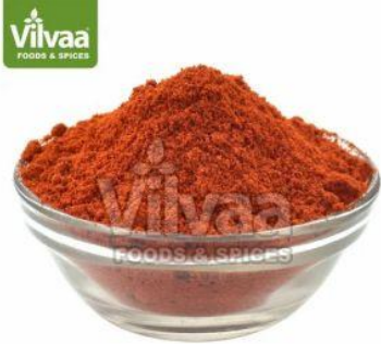
KASHMIRI CHILLI POWDER