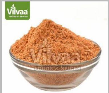
PERI PERI SEASONING - MILD