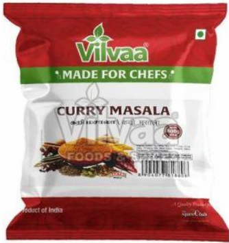
Vilvaa Curry Masala Powder