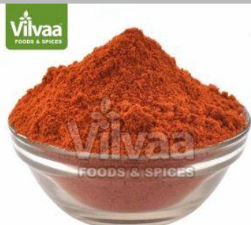
RED CHILLI POWDER - (SPL)