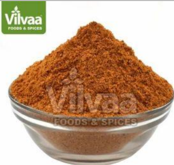
KADAI CHICKEN MASALA