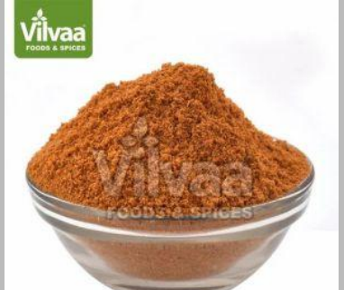
KADAI VEG MASALA