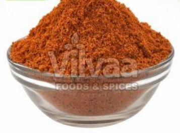
BUTTER CHICKEN MASALA