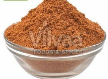
CHICKEN MASALA CLASSIC