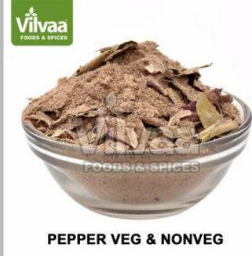
PEPPER VEG & NONVEG