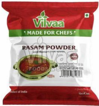
Vilvaa Rasam Powder