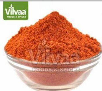
RED CHILLI POWDER - (CLASSIC)