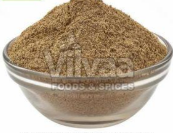
BLACK PEPPER POWDER