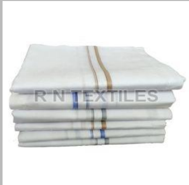
Mens Cotton Handkerchief