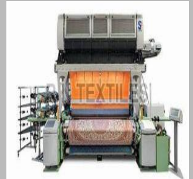
Jacquard Rapier Looms