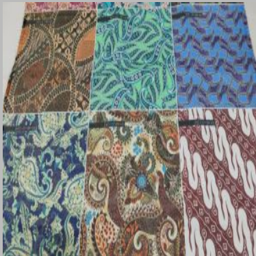
Digital Printed Fabric