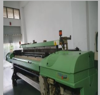
Automatic Power Loom Machine